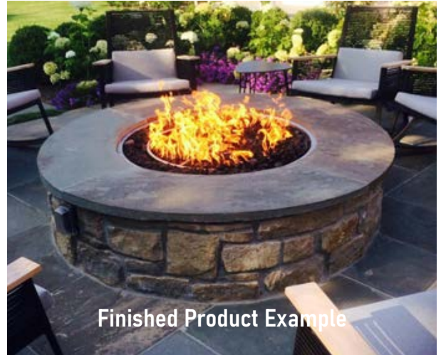
Finished Product Example