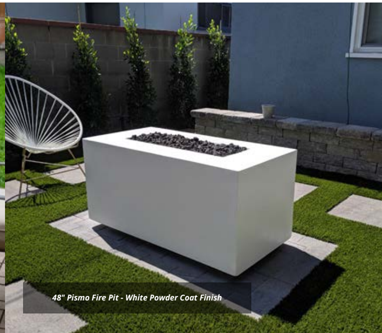
48" Pismo Fire Pit - White Powder Coat Finish