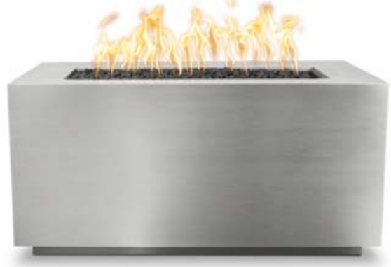
48" STAINLESS STEEL