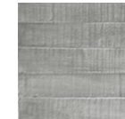
Classic Gray ONB018CG