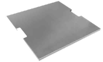
ONF01-214D 14" x 14" x 1"