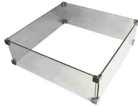
ONC05-003A 17.7" x 17.7" x 9.8"