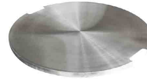
ONF01-120D 20.7" x 20.7" x 1"