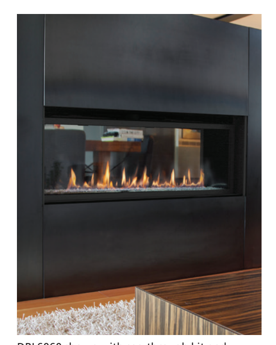
DRL6060 shown with see-through kit and platinum crushed glass