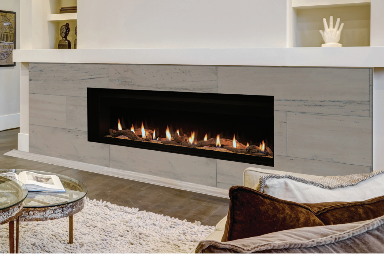
FEATURED DRL6072 shown with driftwood log set and platinum crushed glass media