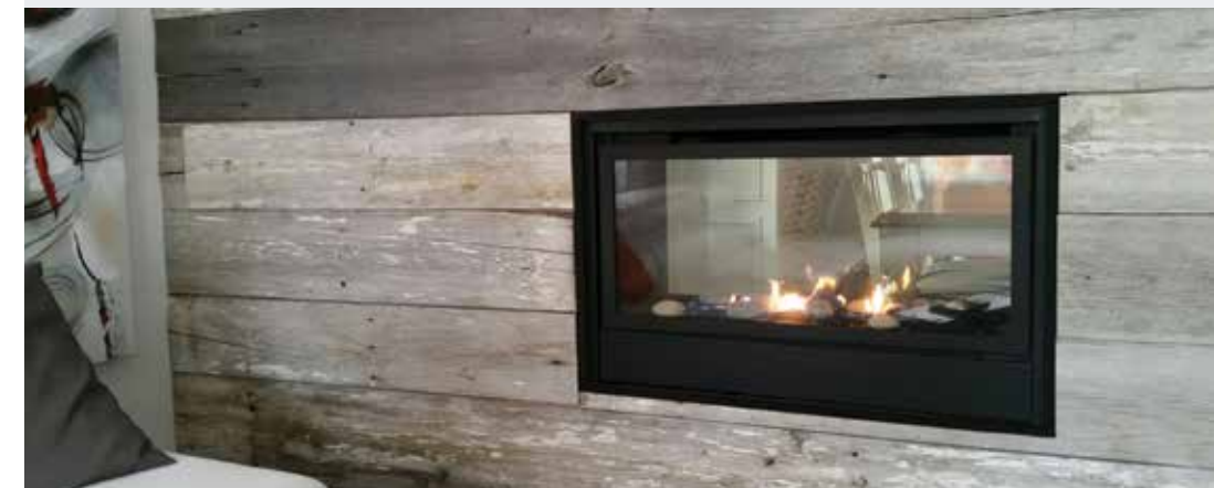
THE NEWCOMB 36DV

*For surrounds add between 5-20 lbs depending on the size of the unit.