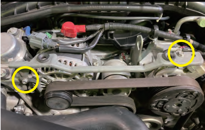
Reference for "D" "F"