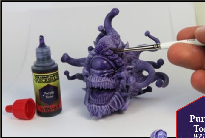
Purple Tone WP1140

Leave it to dry completely (perhaps making yourself a fresh cup of coffee in the meantime).