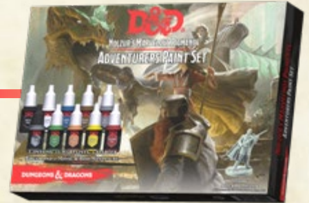
75001 Adventurers Paint Set