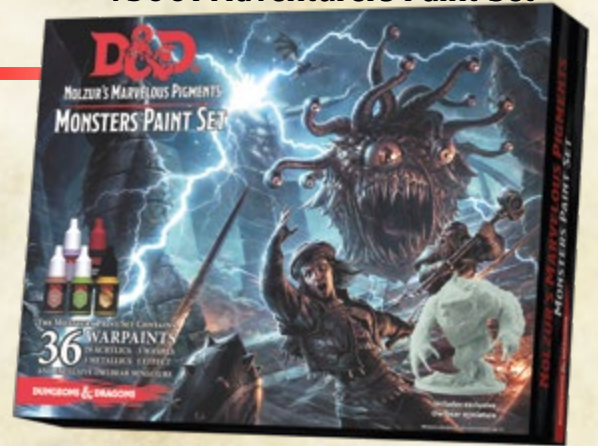
75002 Monsters Paint Set