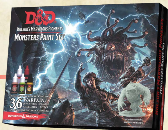
75002 Monsters Paint Set

The colours in the Adventurers Paint Set is great for getting your mini on the table - if you want a greater look, the extra colours of the monsters paint set is a great add on.