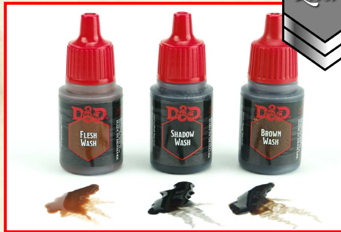
Washes are thin paint with a lot of fine pigment.

Washes are essentially thinned down specialist's paints, designed to create 3D shading to the miniature as the thin wash flows into the deepest crevasses. The Washes are thin and runny and have a consistency of milk, so you need to take care not to splash it onto the entire model or let it run onto unwanted parts of the models.