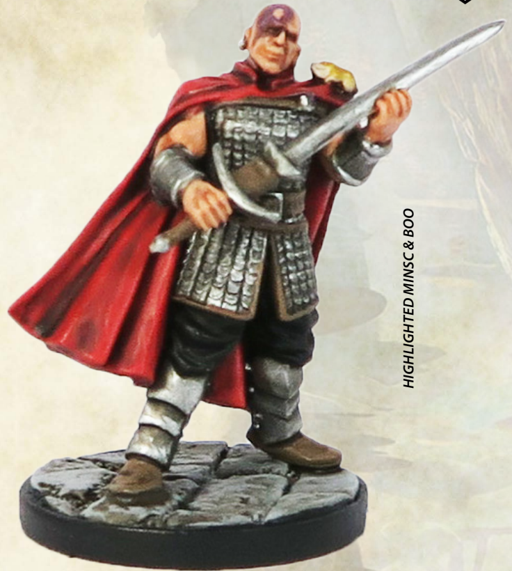
HIGHLIGHTED MINSC &amp; BOO

If you are happy with the result and want to start gaming, we recommend using either AEGIS SUIT SATIN VARNISH SPRAY or the brush-on WARPAINTS ANTI-SHINE VARNISH to protect your precious paint job.