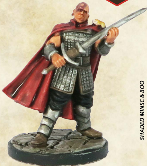
SHADED MINSC & BOO