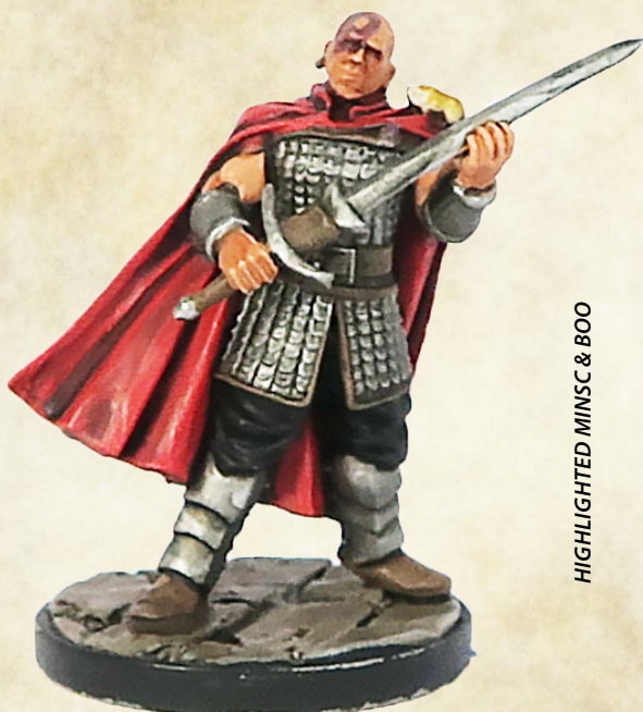
HIGHLIGHTED MINSC & BOO

For instance, highlight only on the nose, the cheek bones, the top of the ears and the bald top of Minsc's head. Likewise, try only to paint the highlight colour on the top of the fingers – not in between where you like the Flesh Wash shade to stay.