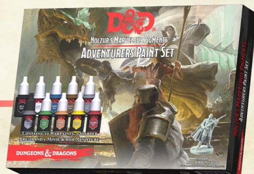
75001 Adventurers Paint Set