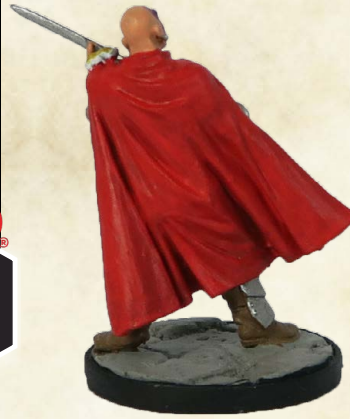
BASECOATED MINSC & BOO

We finished off the basecoat stage by painting the edge of the base with ABYSSAL BLACK and the Minsc & Boo miniature is done!