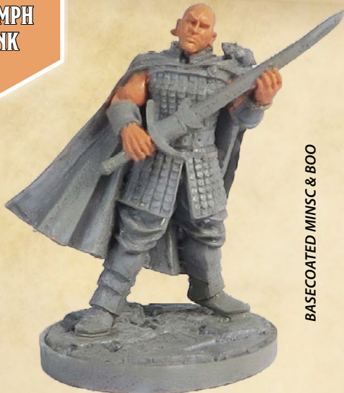
BASECOATED MINSC & BOO