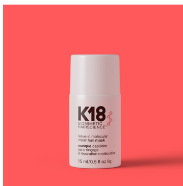
K18 leave-in molecular repair mask 15ml