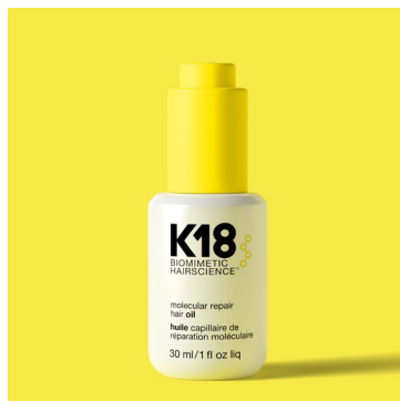
K18 molecular repair hair oil