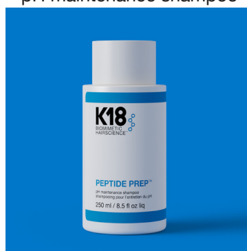
K18 PEPTIDE PREP™ pH maintenance shampoo

A color-safe, pH-optimized shampoo with K18PEPTIDE™ to effectively cleanse while maintaining hair health for hair that feels strong, smooth, and healthy.