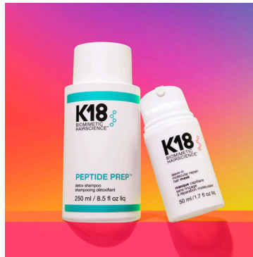
PEPTIDE PREP™ detox shampoo + leave-in molecular hair mask

Any type of coating whether it's product buildup, sebum/oil buildup, or even mineral + metal buildup from hard water can block our biomimetic peptide from getting where it needs to go. We recommend PEPTIDE PREP™ detox shampoo prior to K18 mask application for first-time users, or people that use a lot of styling products. This will clear the path for our peptide to fully penetrate hair, and deliver maximum molecular repair results.