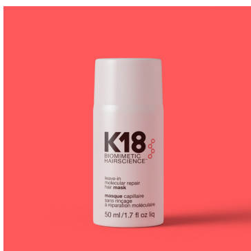
K18 leave-in molecular repair mask 50ml