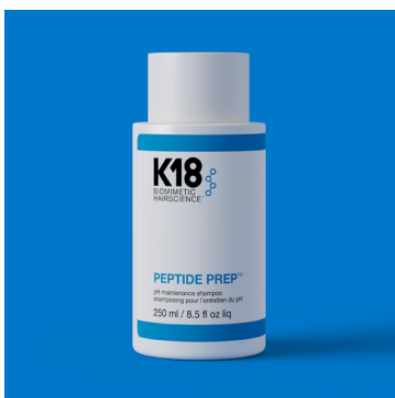
K18 PEPTIDE PREP™ pH maintenance shampoo

No, the formula of the DAMAGE SHIELD pH protective shampoo is not different from the PEPTIDE PREP™ pH maintenance shampoo . Just the name has changed, the formulation you know and love is the same.