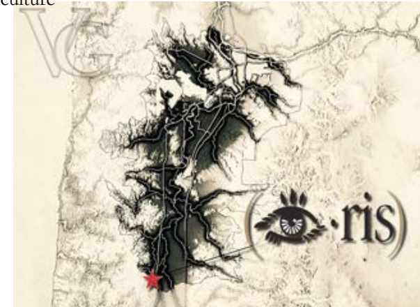
Willamette Valley Appellation