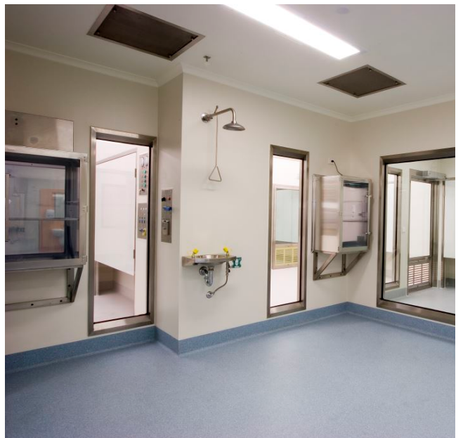
Figure 1 Wallflex 2mm Wall Cladding