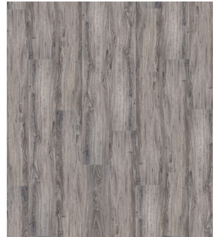
Riverland - Smoke | 3X111906