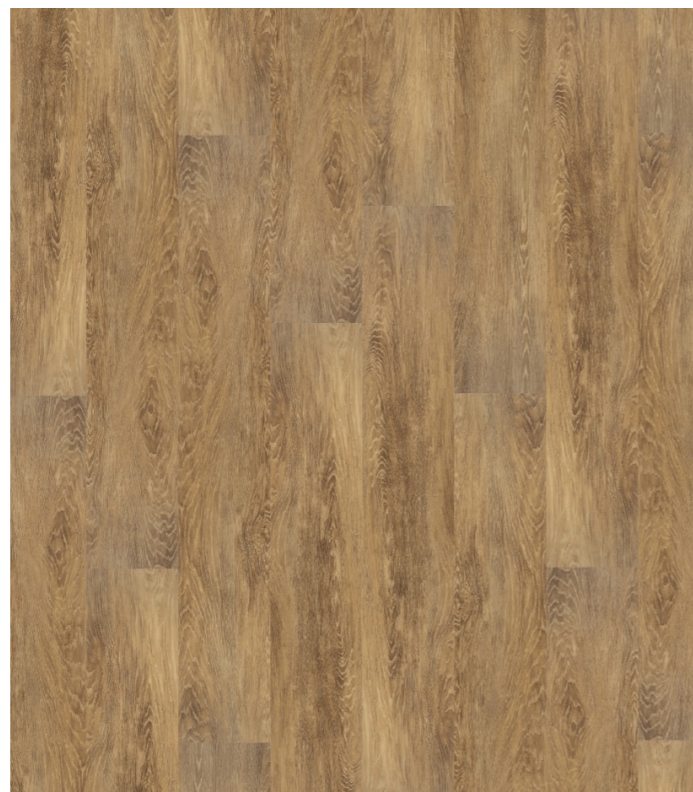
Oak - Harmony | 3X057015