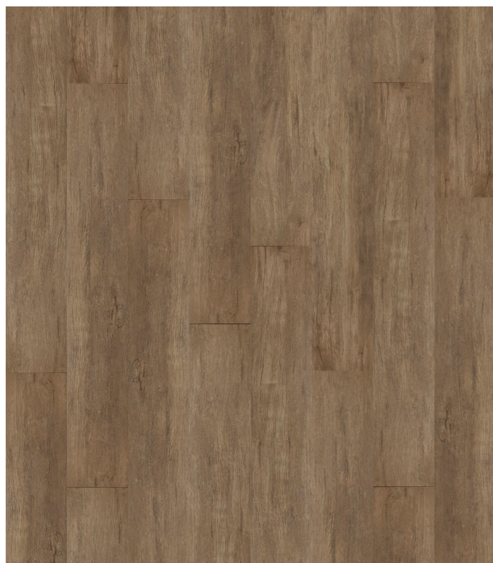
Barnyard Grey | 3X168011