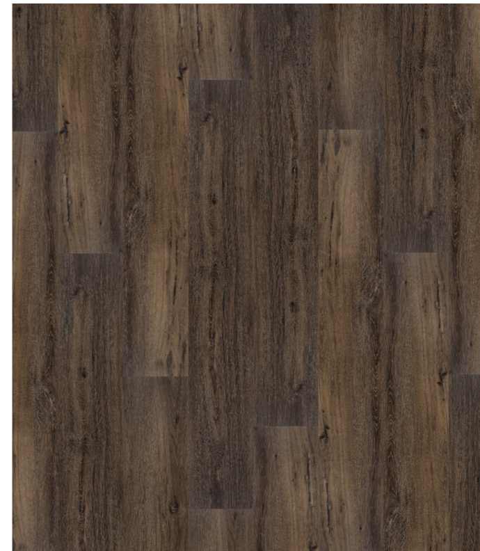
Valley Oak - Haze | 3X109508