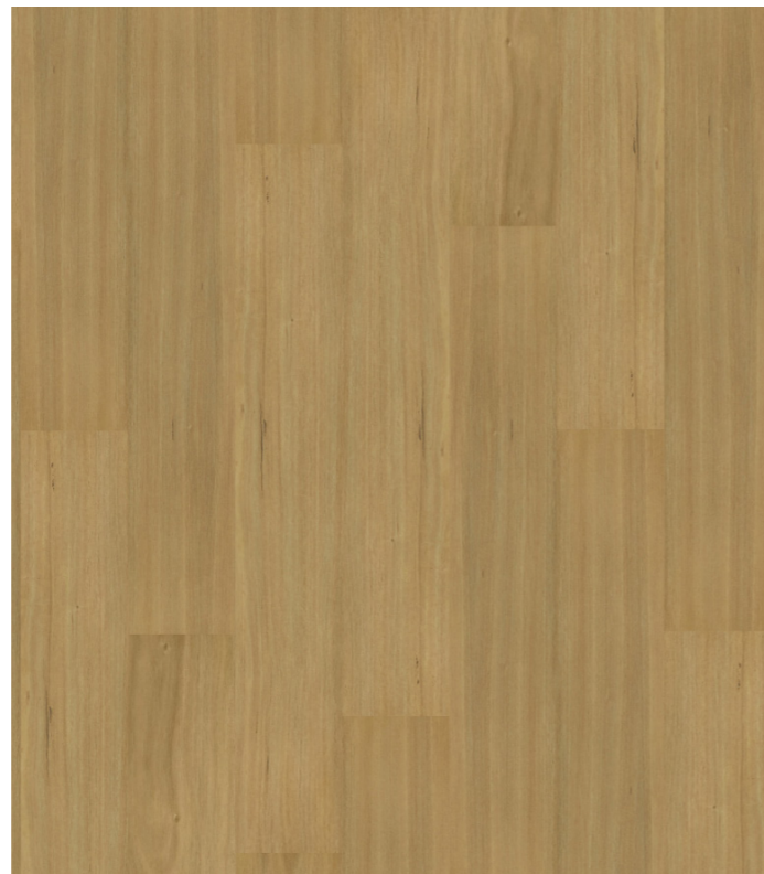
Tasmanian Oak | 3X388801