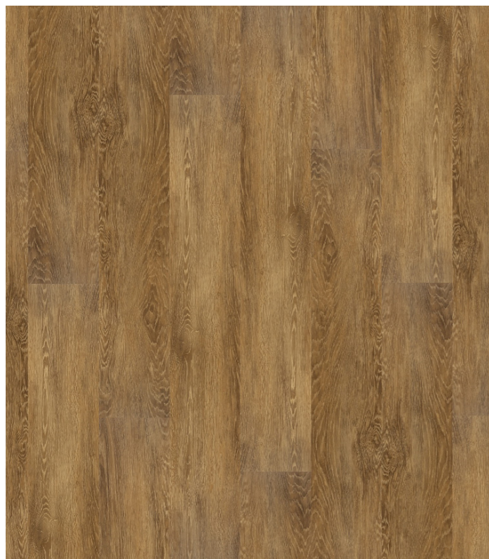
Oak - Tranquil | 3X057014