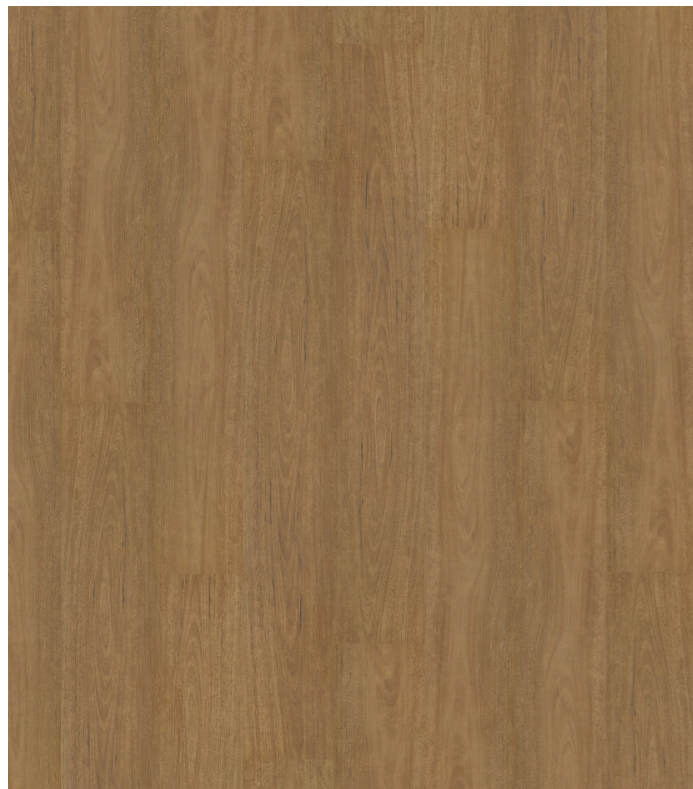
Spotted Gum | 3X389001