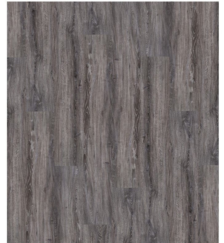
Riverland - Ash | 3X111903