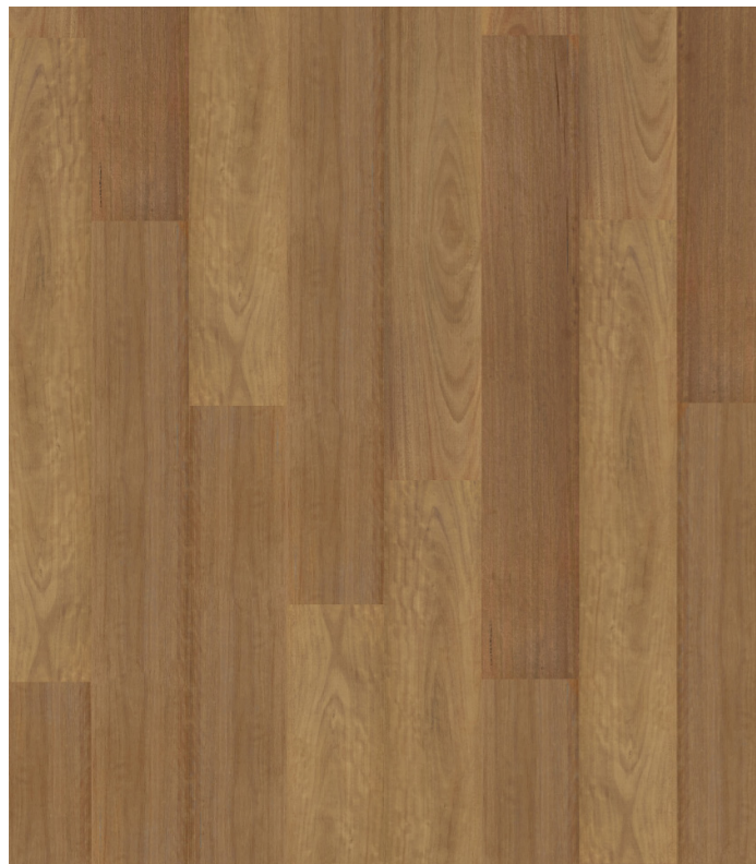
Blackbutt | 3X388901