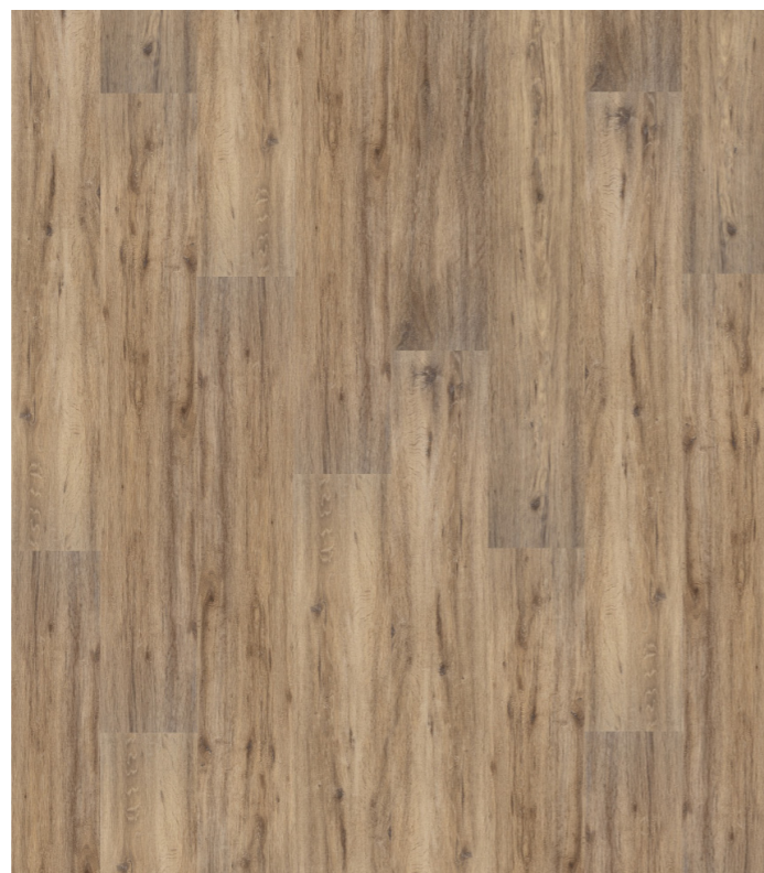
Barnwood - Ombre | 3X102605

Colour swatches may vary between digital brochure to real life product and are to be used as a guide only - refer to our Colour Variation Factsheet . It is recommended you view the actual product in store - visit our Store Locator .