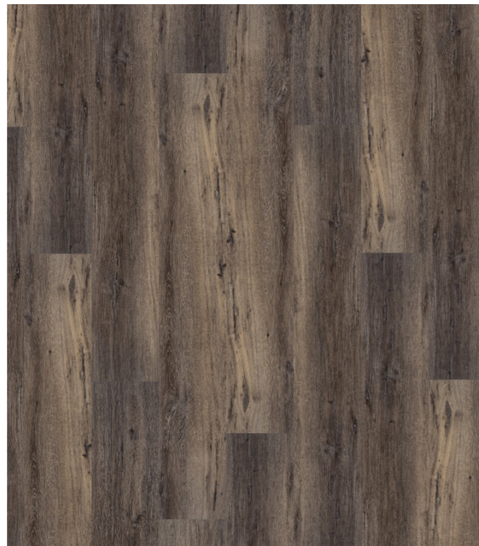
Valley Oak - Mist | 3X109505