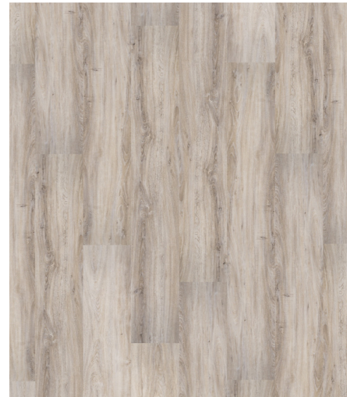
Riverland - Limed | 3X111907