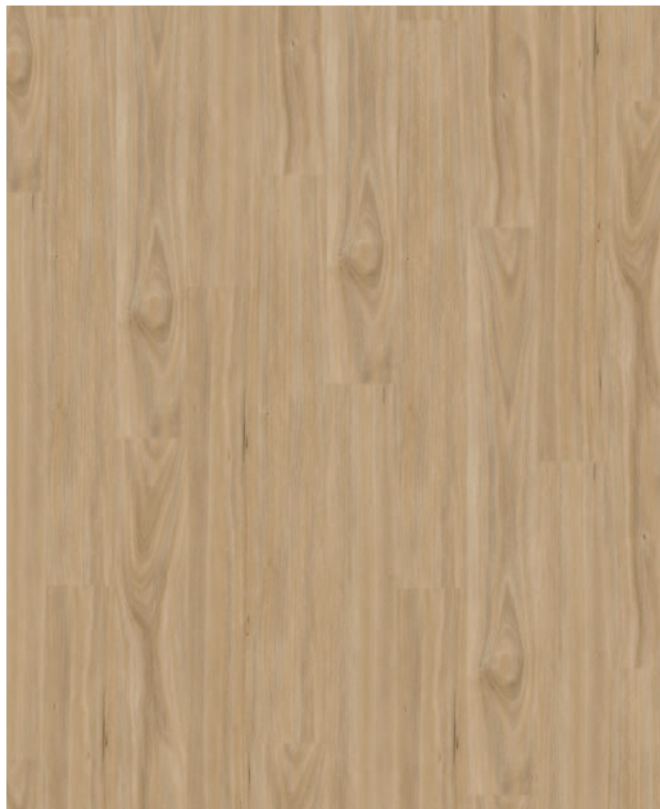
TWILIGHT TASMANIAN OAK — 3L388801