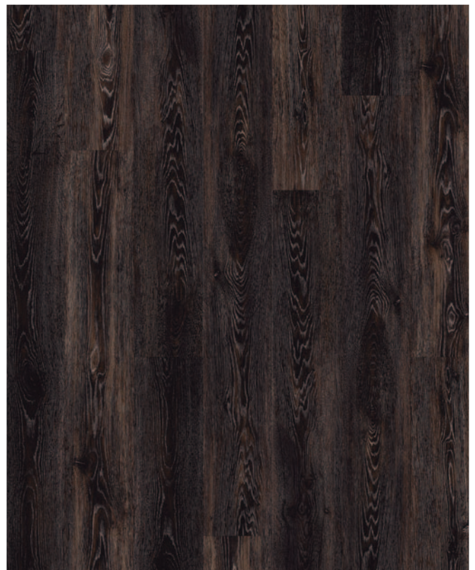
CARBON OAK — 3L165211