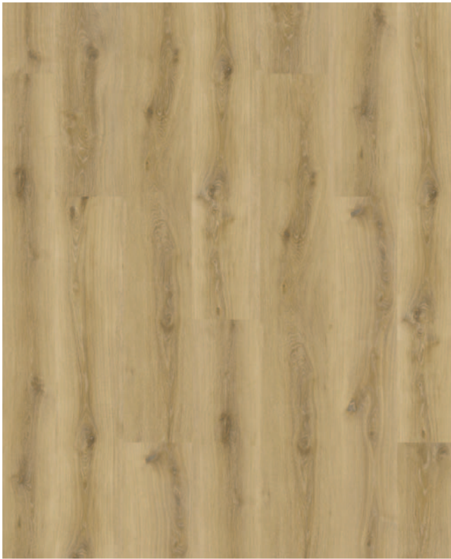
SUMMER OAK — 3L195603