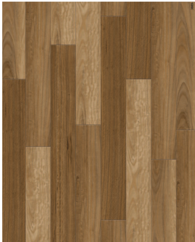
SUNRISE BLACKBUTT — 3L388901