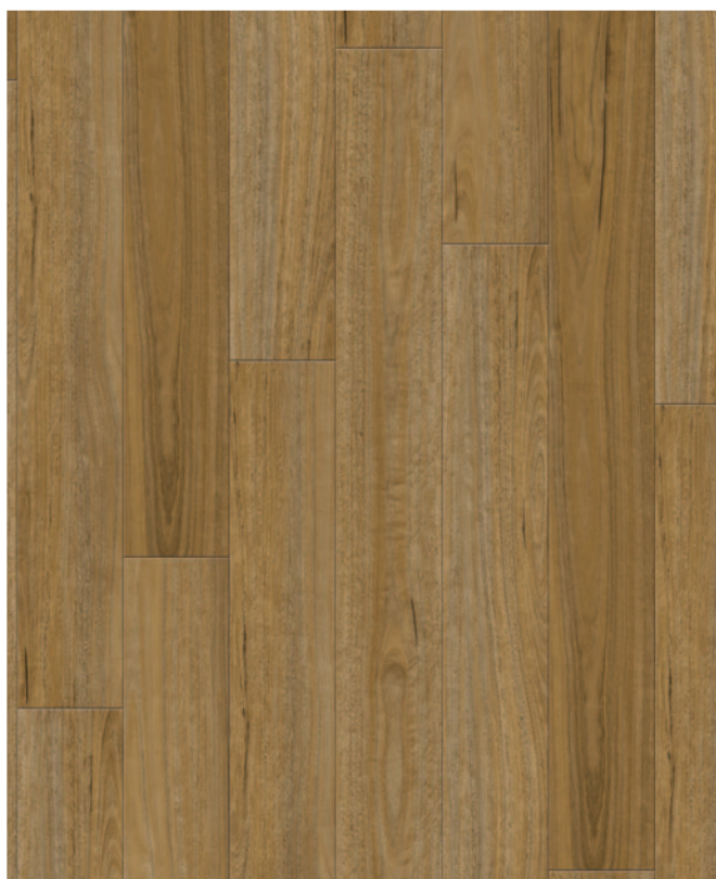
MORNING SPOTTED GUM — 3L389001