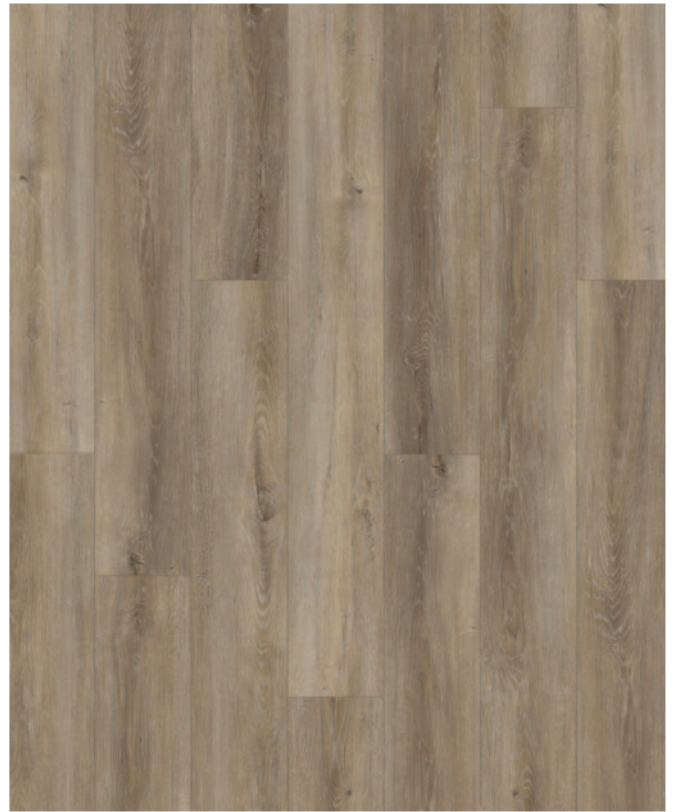
WEATHERED OAK — 3L133210