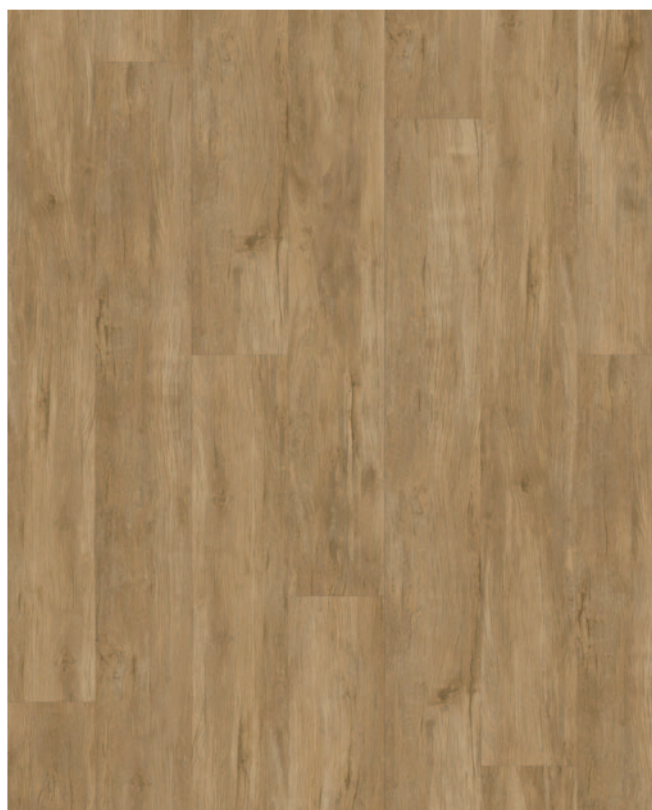
SUNSET BARNYARD GREY — 3L168011