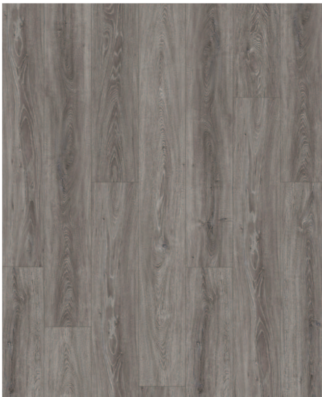
WASHED EBONY — 3L111903