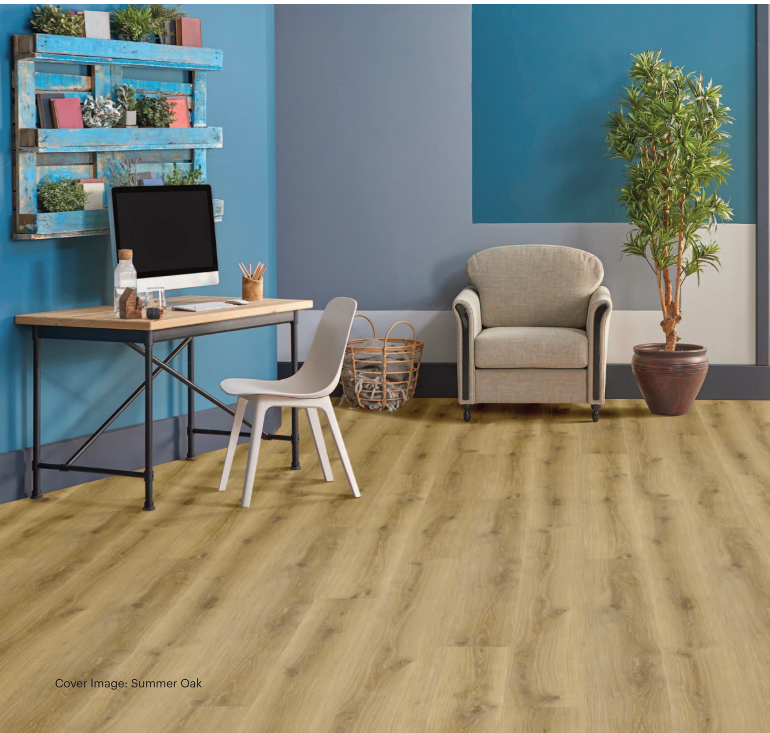
Cover Image: Summer Oak