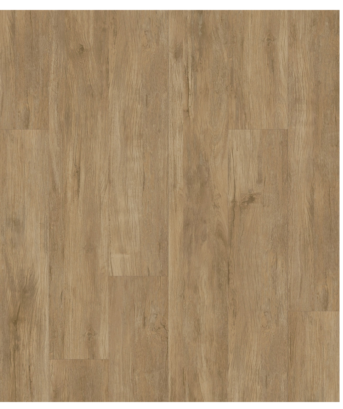
Warm Barnyard Grey | 1R716801