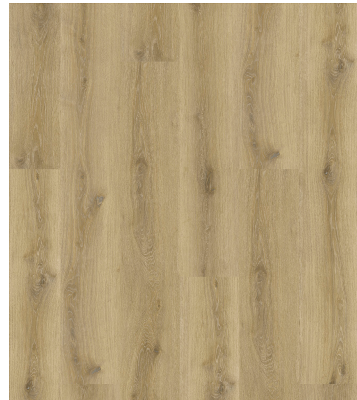
Blonde Oak | 1R795603