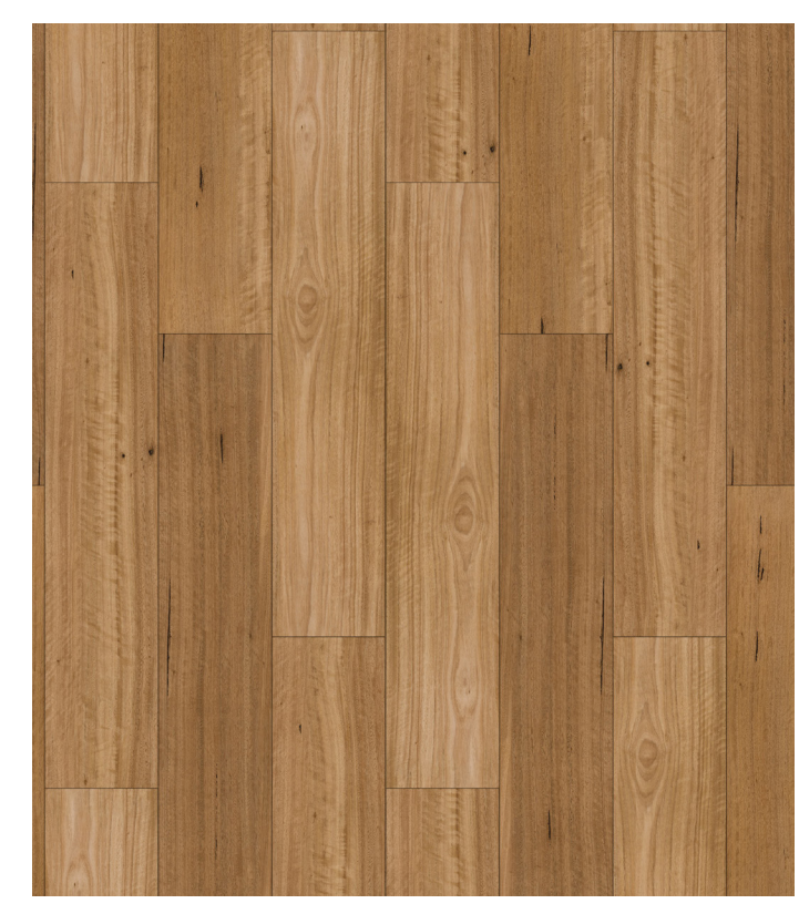
Mountain Blackbutt | 1R731304