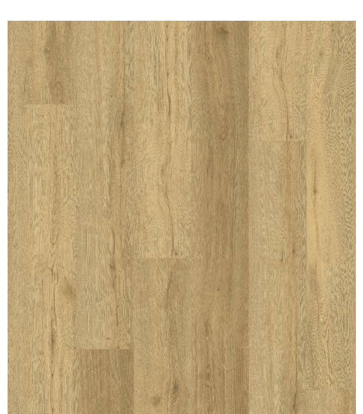
Birch | 1R788095