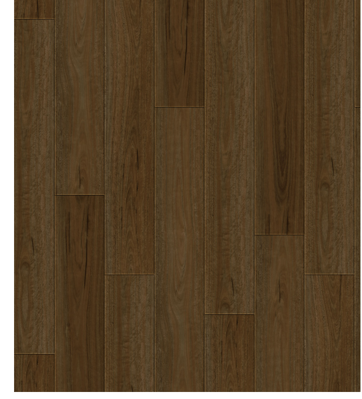
Coastal Spotted Gum | 1R731205