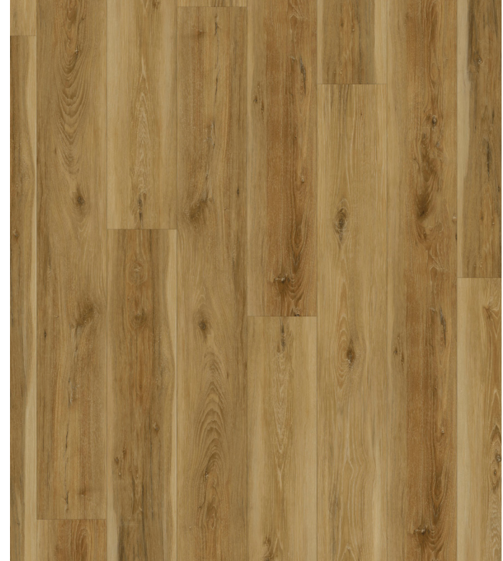
Victorian Oak | 1R762240