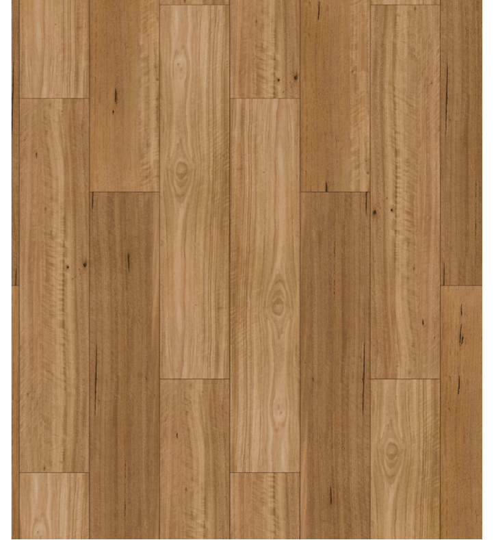
Mountain Blackbutt | 1R731304