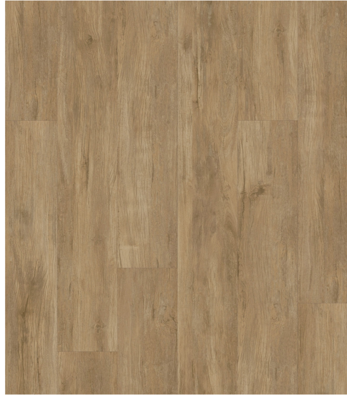
Warm Barnyard Grey | 1R716801