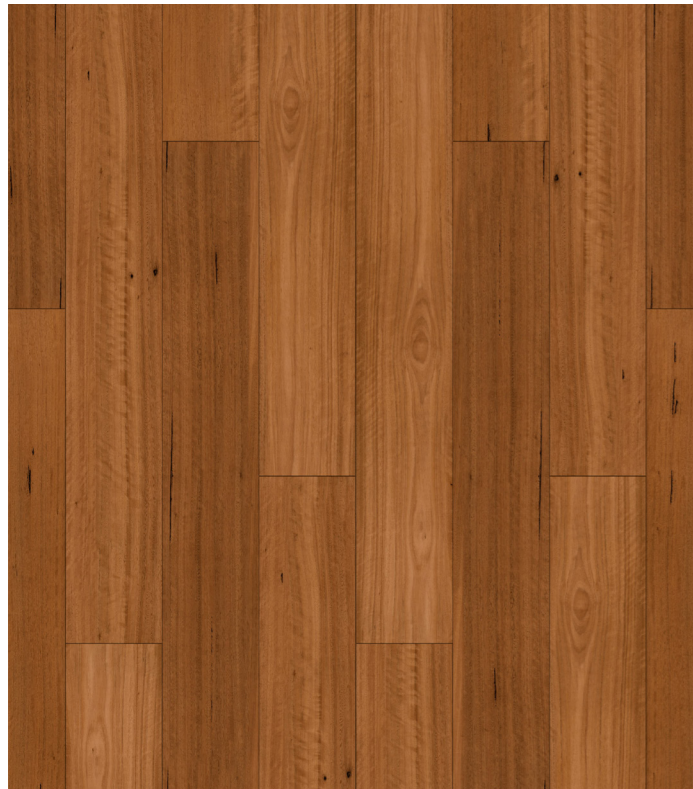
Sydney Blue Gum | 1R731308