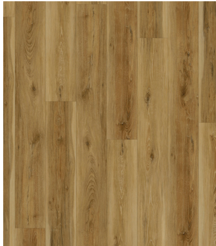
Victorian Oak | 1R762240