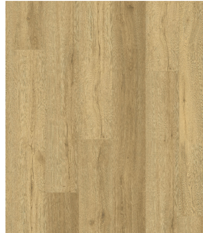
Birch | 1R788095