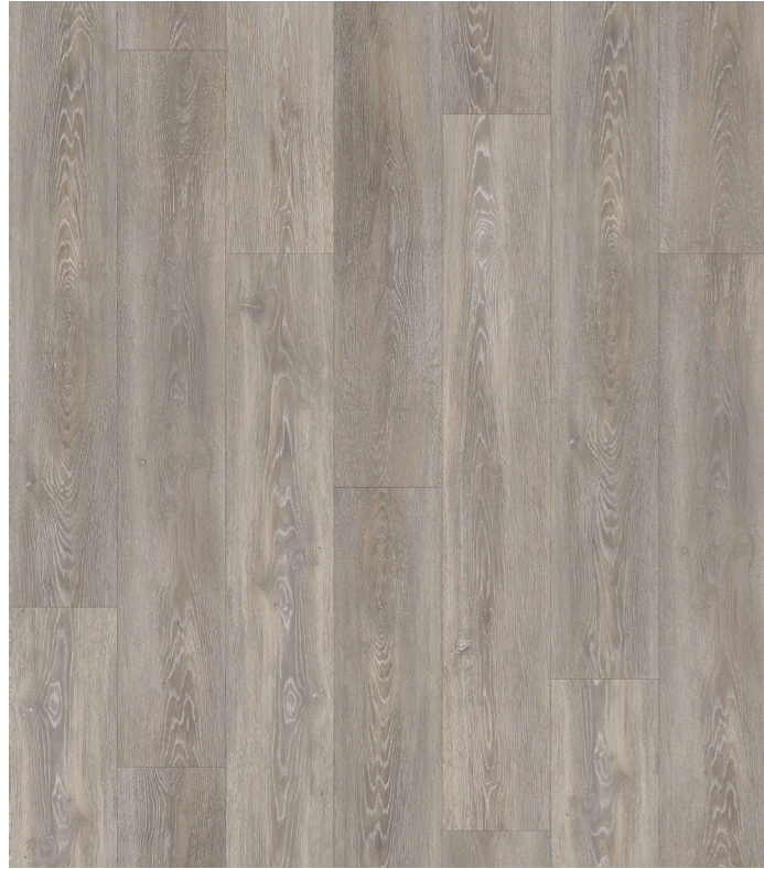
Snow Gum | 1R716521