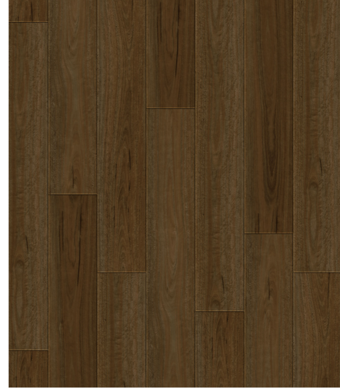
Coastal Spotted Gum | 1R731205