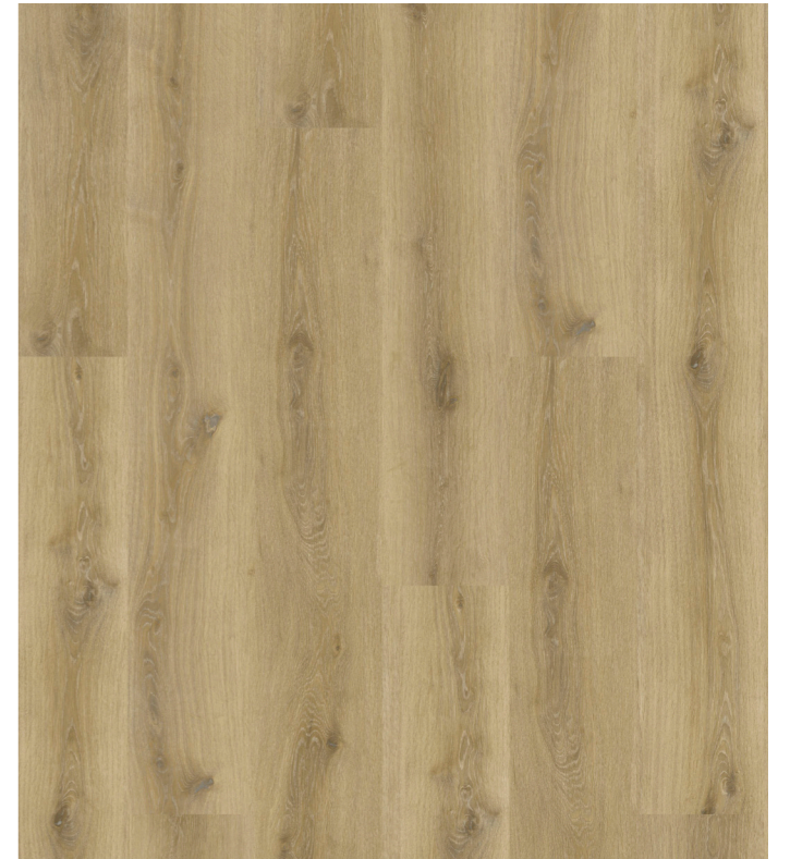
Blonde Oak | 1R795603