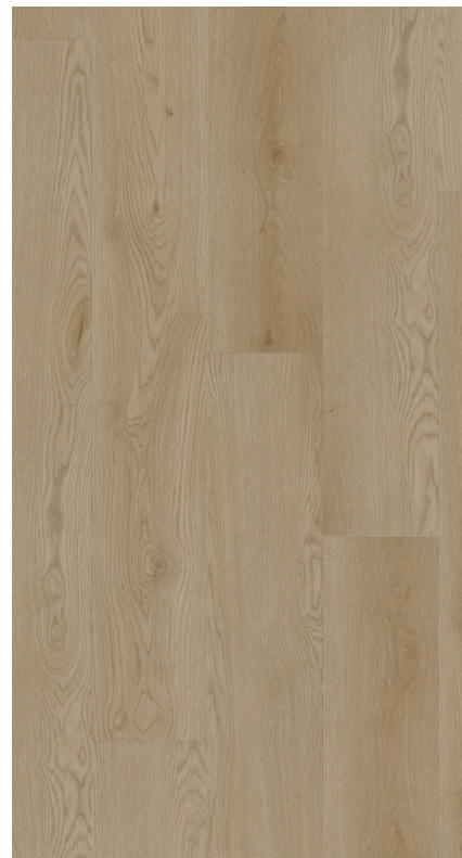
Booker Oak | 140