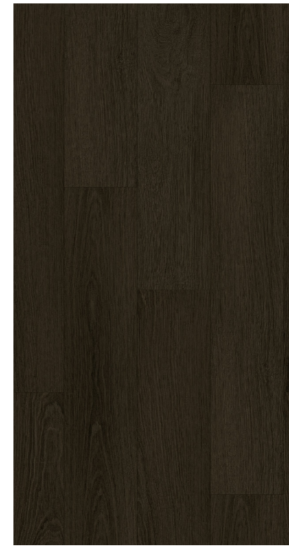
Cocoa Oak | 190