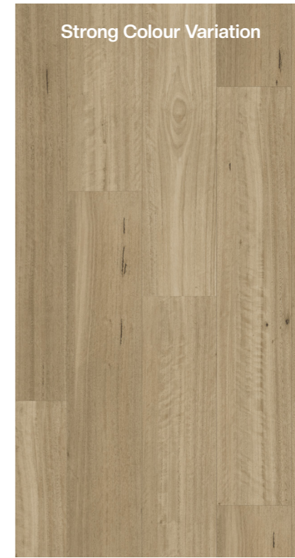
Somerset Blackbutt | 215