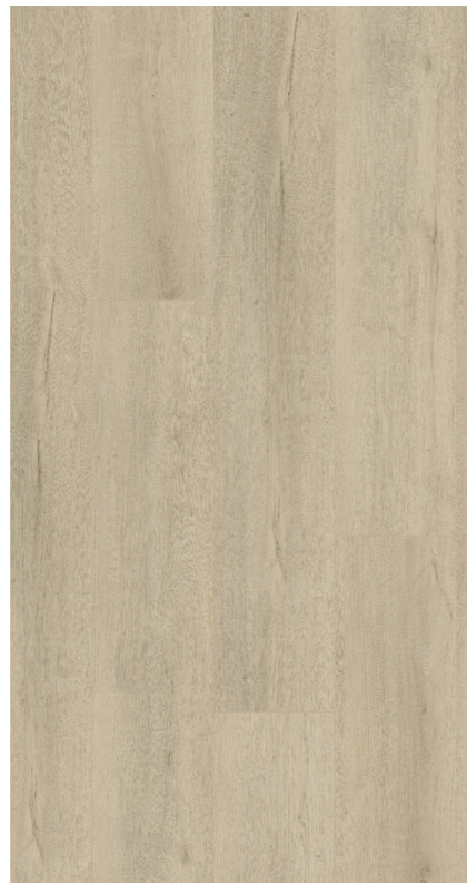
Silver Oak | 110