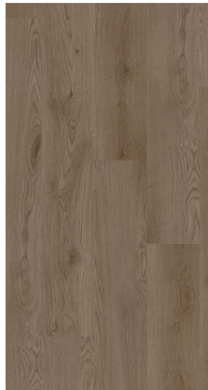
Malt Oak | 175