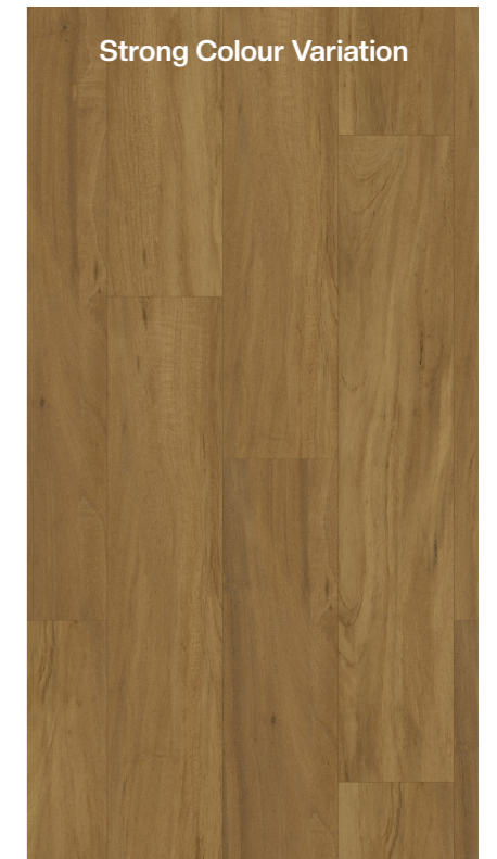
Tasmanian Hardwood Classic | 450