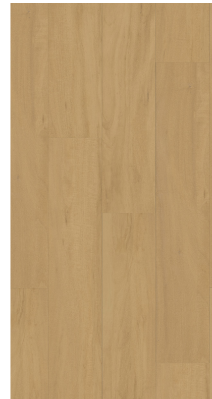
Franklin Tassie Oak | 415