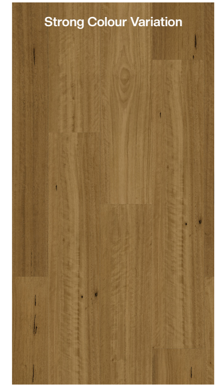
Blackbutt Traditional | 250