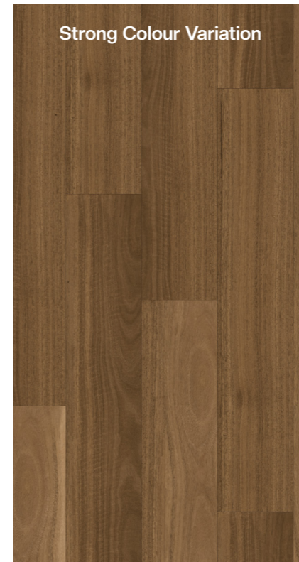
Spotted Gum Traditional | 360