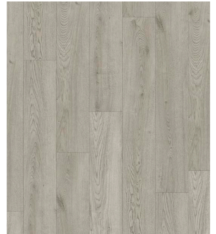
Fortuna Oak | 120