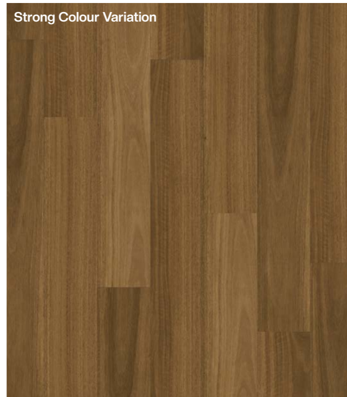
Natural Spotted Gum | 360