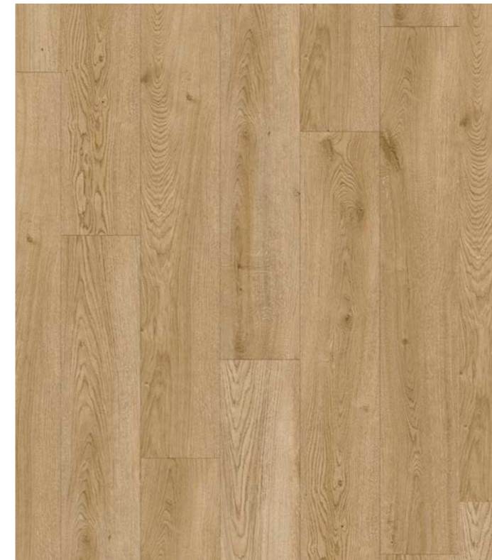
Java Oak | 140