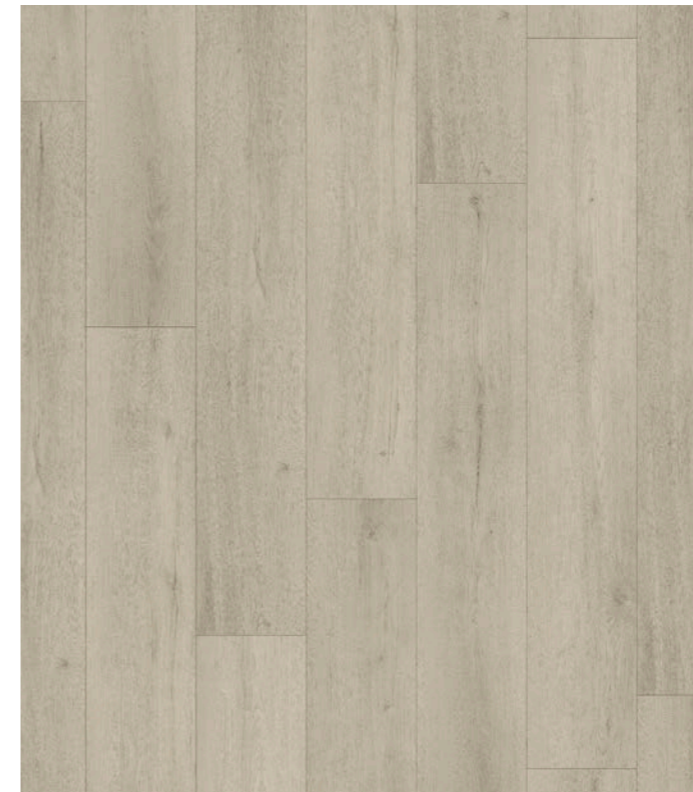
Stirling Oak | 110