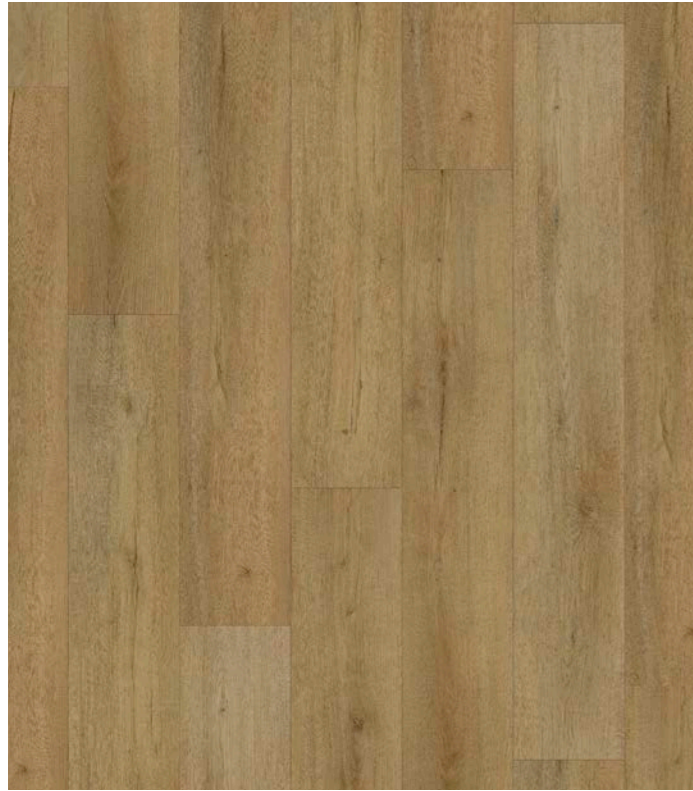
Tobacco Oak | 160