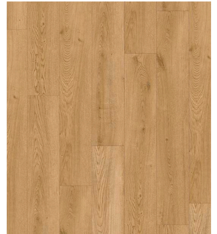
Grand Oak | 150