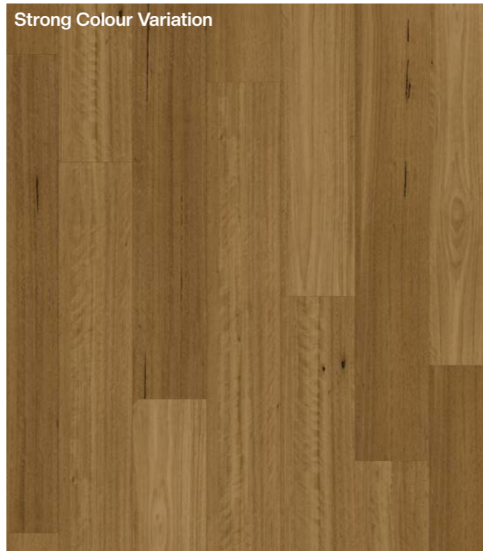
Grand Blackbutt | 250