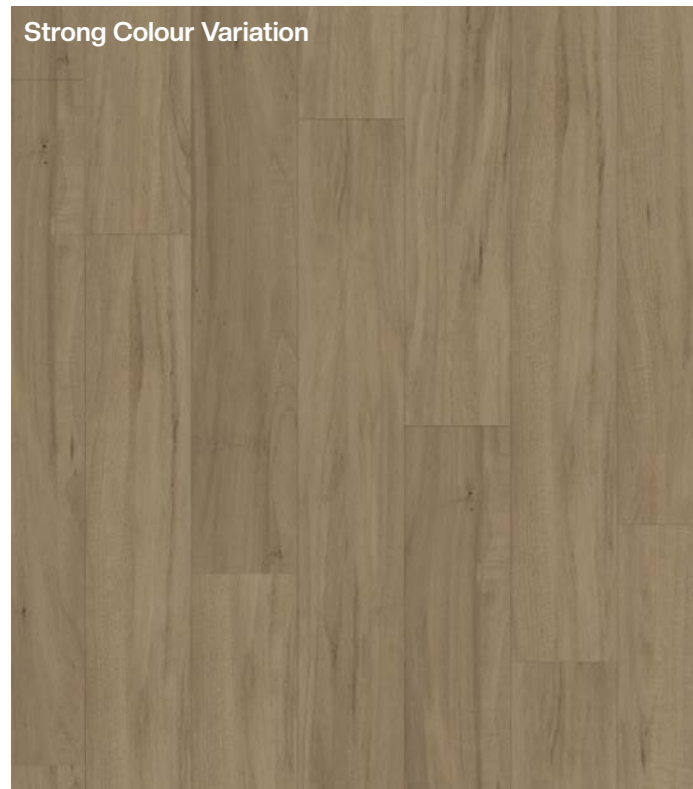
Select Tassie Oak | 430