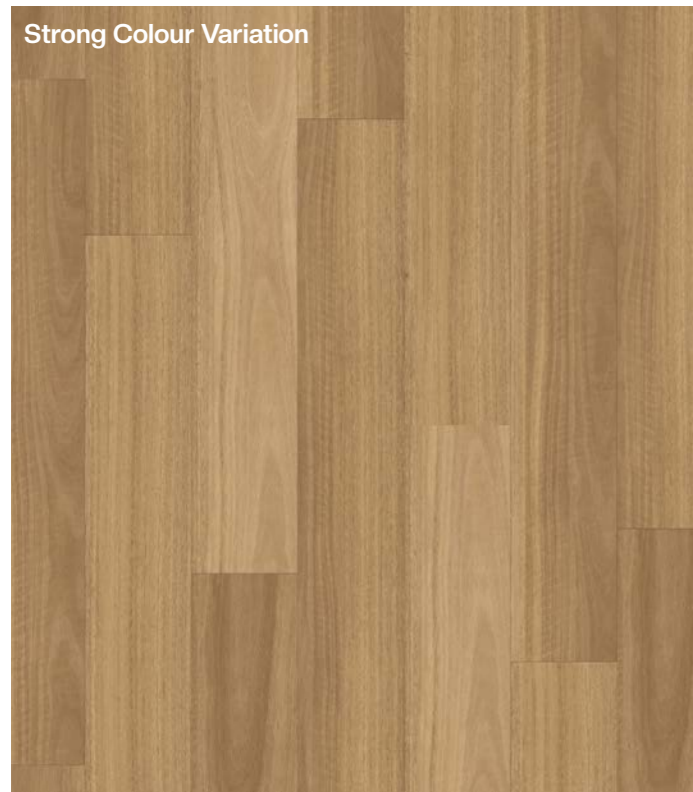
Seasoned Spotted Gum | 320