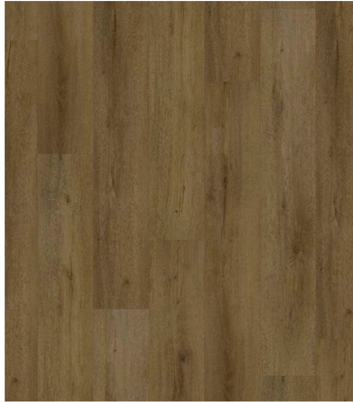
Havana Oak | 175