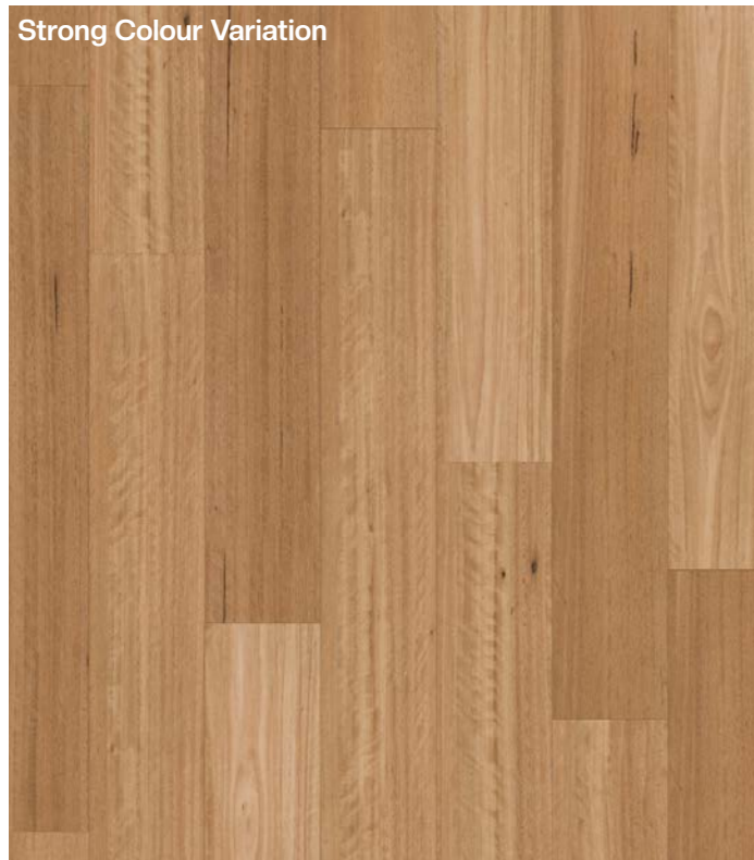
Silky Blackbutt | 220