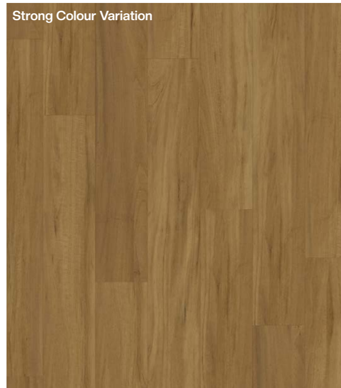
Prime Tassie Oak | 450