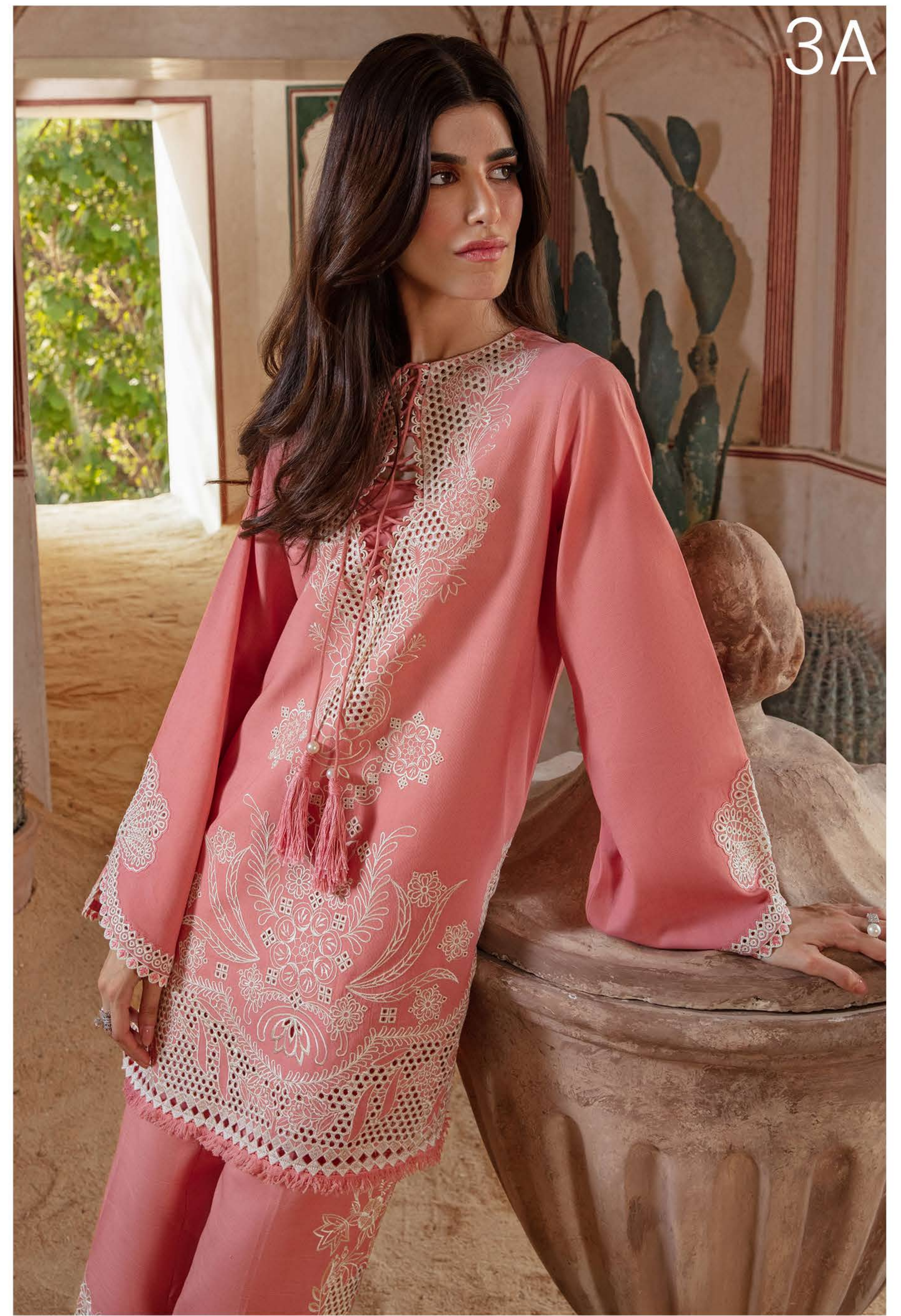
Threads that bind