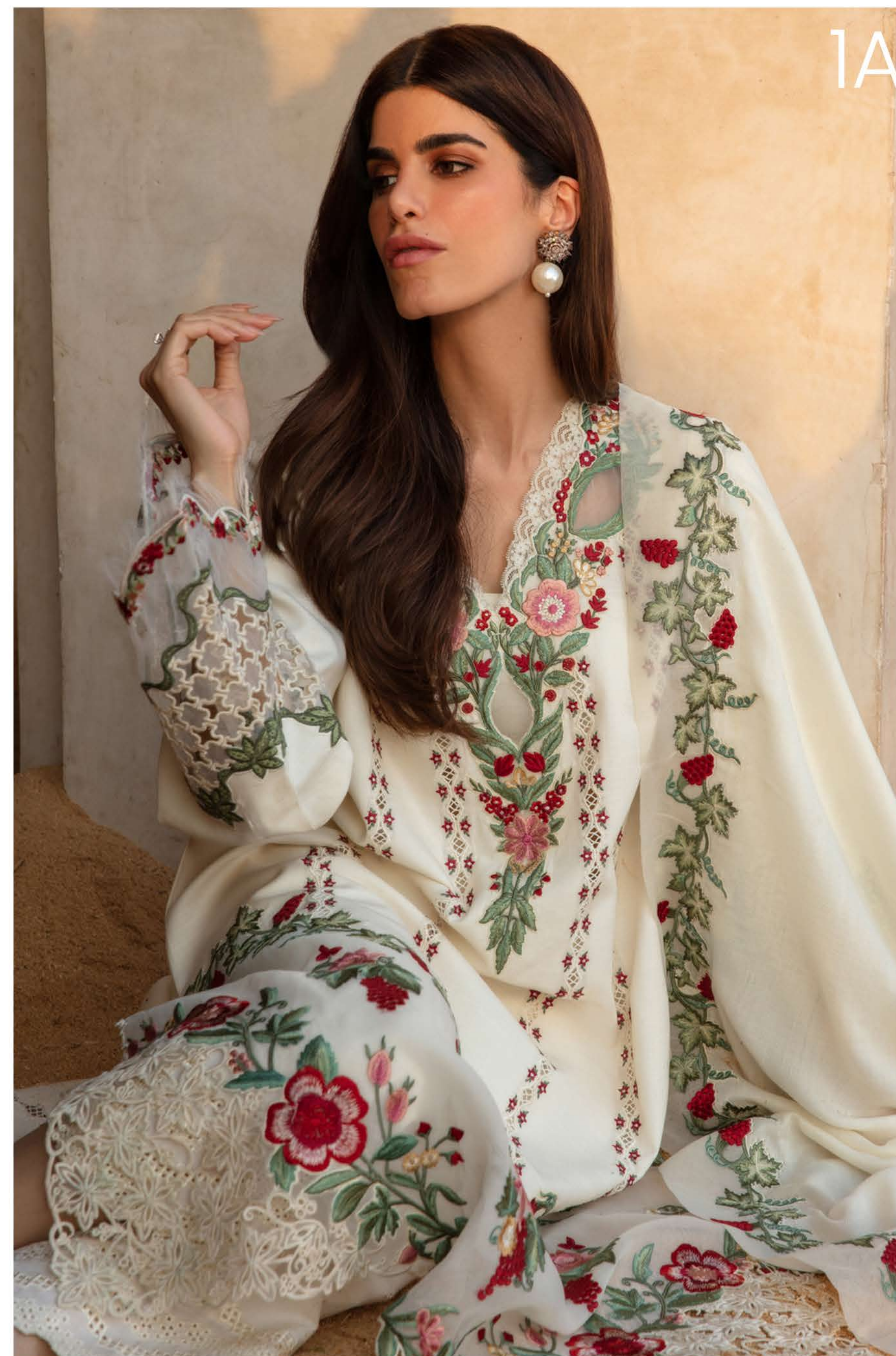
Melody in Vines