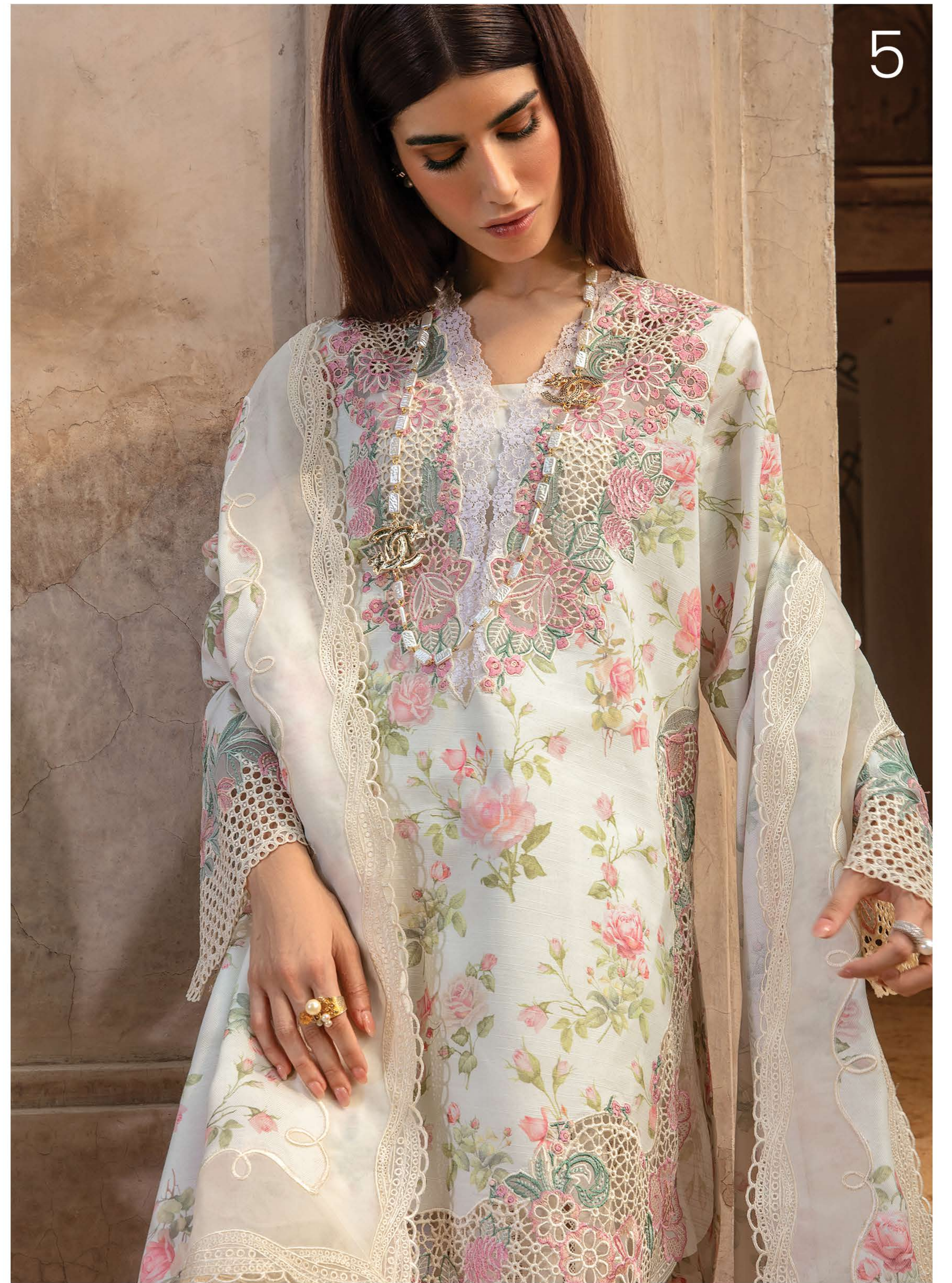
A Flower Named Peace