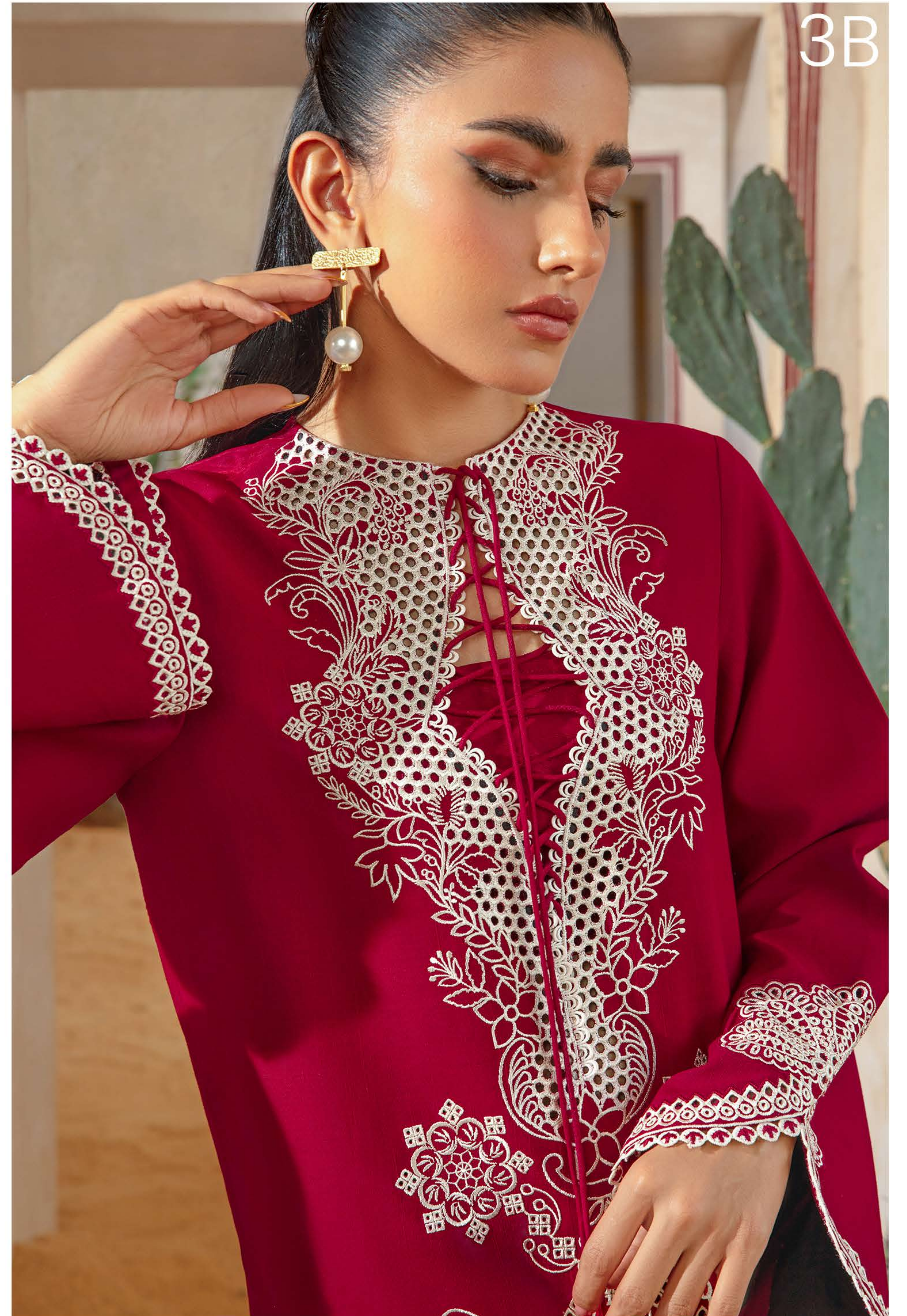
Threads that bind