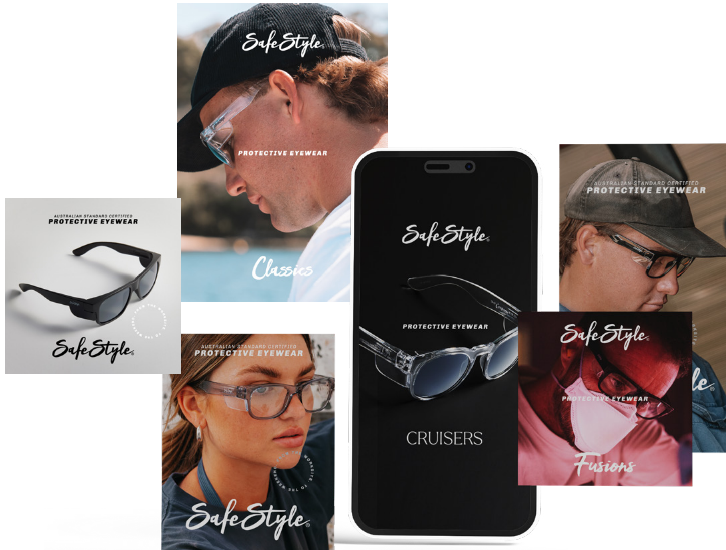
A PREVIEW OF OUR SOCIAL ASSETS