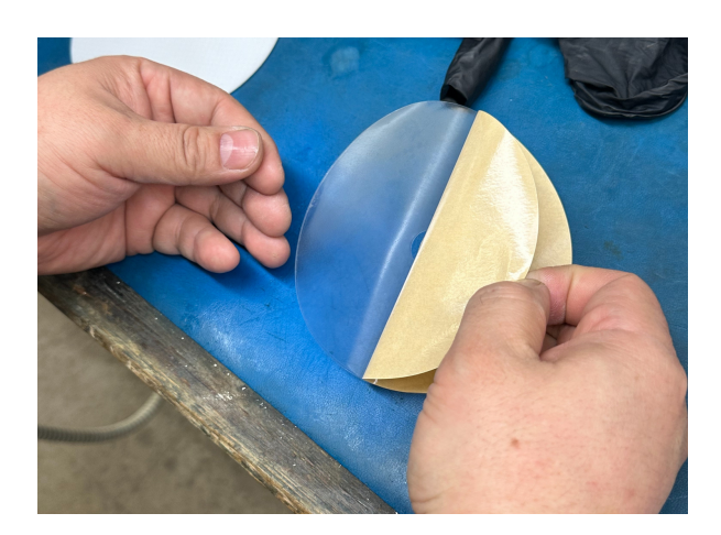
REMOVE WAX PAPER BACKING FROM DOUBLE-SIDED ADHESIVE AND AFFIX ONTO METAL BASE.

AFTER REMOVING WAX PAPER BACKING, FORM THE ADHESIVE INTO A "U-SHAPE" (WITH EXPOSED ADHESIVE FACING DOWN), AND PLACE HOLE OF ADHESIVE OVER CENTER PIN.