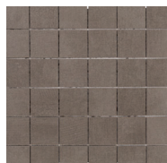
2x2 mosaic Sheet Size: 12x12