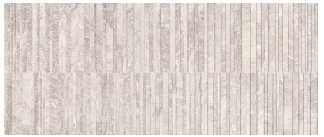
500-1502P-48X48 WHITE PLY POL RECT 500-1502N - 48x48 WHITE PLY NAT RECT