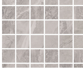
500-1501MOSN-2X2 GRAY NAT 500-1501 MOSP - 2x2 GRAY POL