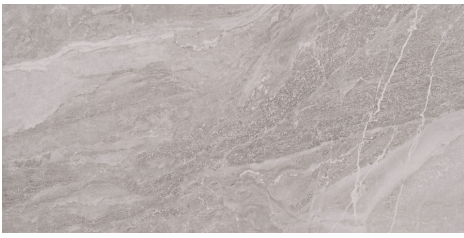
500-1501N-12X24 GRAY NAT RECT 500-1501P - 12x24 GRAY POL RECT 500-1501N - 24x48 GRAY NAT RECT 500-1501P - 24x48 GRAY POL RECT