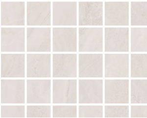
500-1502MOSN-2X2 WHITE NAT 500-1502MOSP - 2x2 WHITE POL