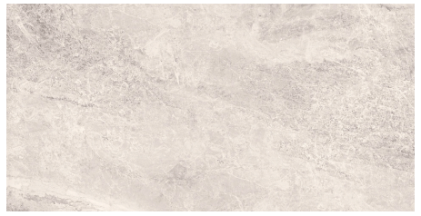
500-1502N-12X24 WHITE NAT RECT 500-1502P - 12x24 WHITE POL RECT 500-1502N - 24x48 WHITE NAT RECT 500-1502P - 24x48 WHITE POL RECT