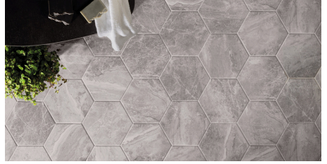
500-1501N-8X8 GRAY HEXA NAT PRESSED