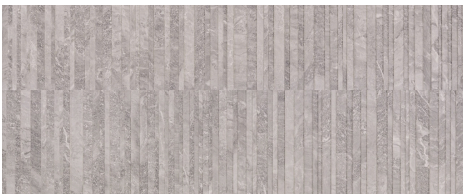
500-1501P-48X48 GRAY PLY POL RECT 500-1501N - 48x48 GRAY PLY NAT RECT