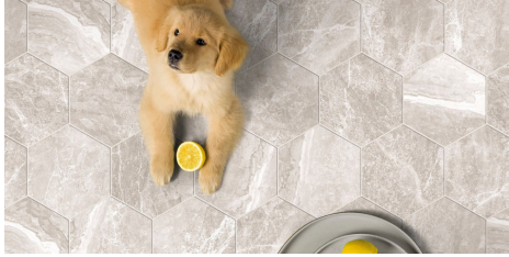
500-1502N-8X8 WHITE HEXA NAT PRESSED