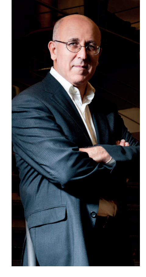
His commitment to the environment, social ethics and the idea of creating products that improve physical and emotional wellbeing still drives us today.