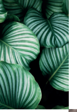
Respect for the cycles of nature.