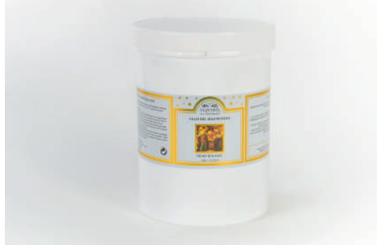
A wide range of professional cosmetic products.