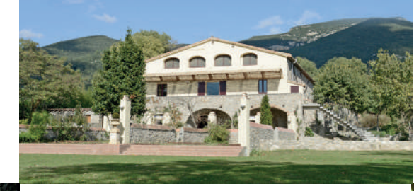
ALQVIMIA awakens every day, surrounded by nature, in a beautiful Pyrenean valley.