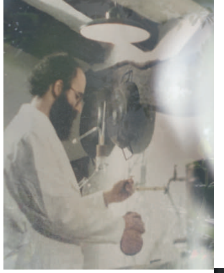
A unique CONCEPT was created from the union of the ART of perfumery, the KNOWLEDGE of ancient formulas and the POWER of aromatherapy.