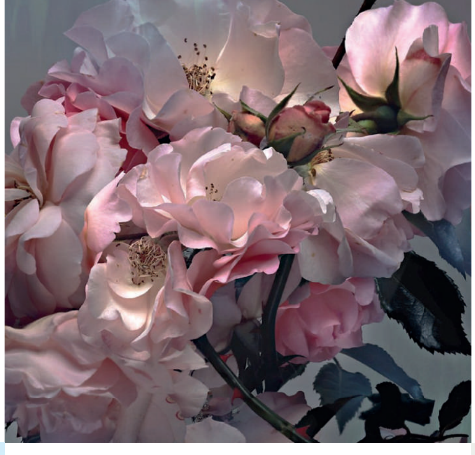
Natural ingredient selected for their excellence.