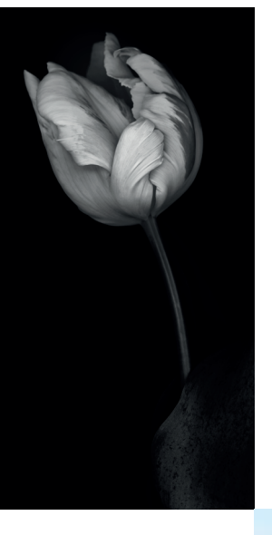
THE ORIGIN OF OUR COSMETICS: NATURE