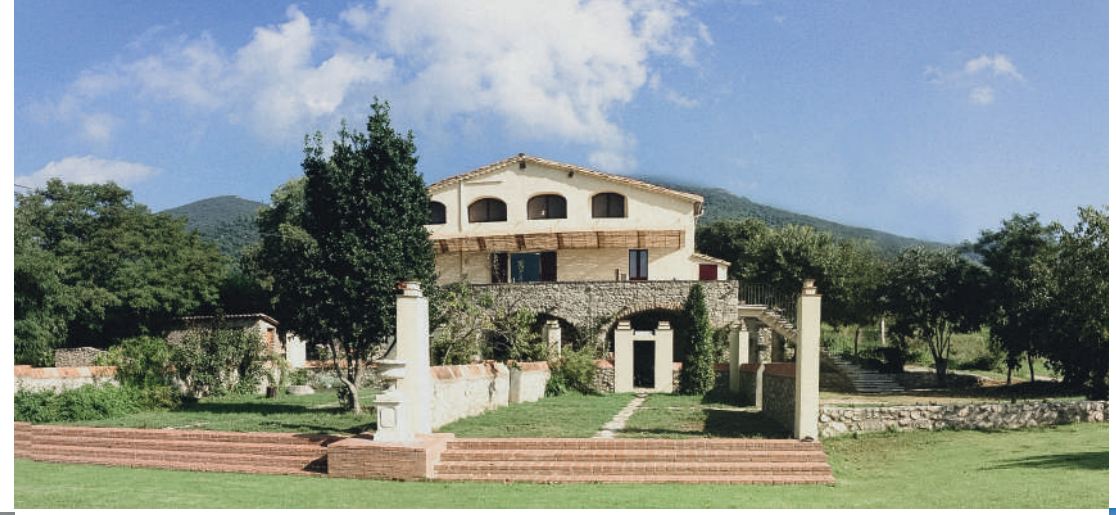
CAN DURÁN Headquarters