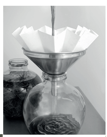
SPAGYRIC PRODUCTS ALCHEMIC TECHNIQUES