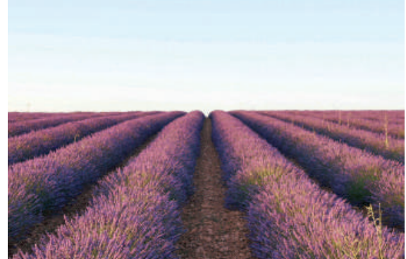
Our very own crops or selected harvests from certified suppliers.