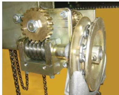
▲ RACK & PINION TROLLEY DRIVE

Available for use on inclined monorails or for shipboard use to provide increased control over the trolley to prevent unintended movement.