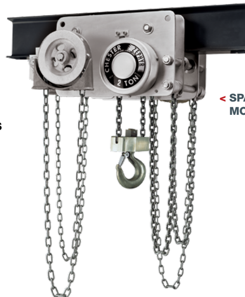
◀ SPARK-RESISTANT MODEL

Available for use on inclined monorails or for shipboard use to provide increased control over the trolley to prevent unintended movement.