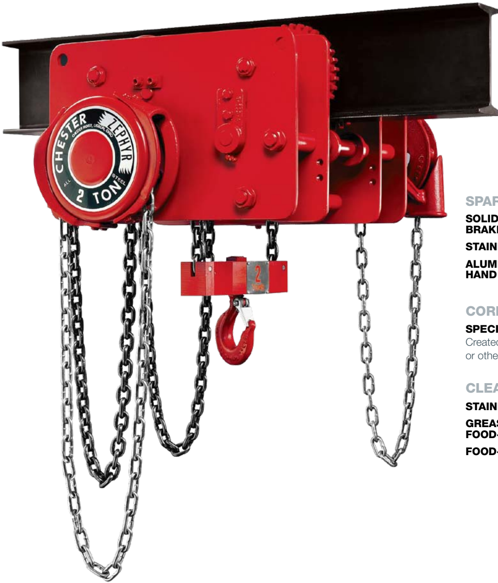
◀ STANDARD MODEL