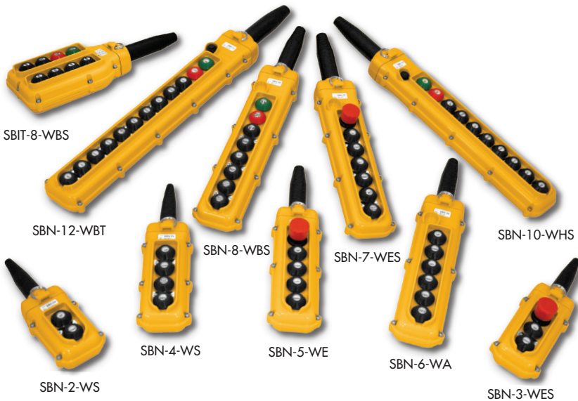
Examples of pendant configurations shown above; contact Magnetek for the entire family of available designs

SBN provides the ultimate in flexibility – select from a wide range of pendant sizes and configurations to meet any application