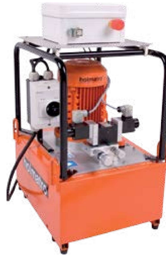
IPU 14 W 25 E