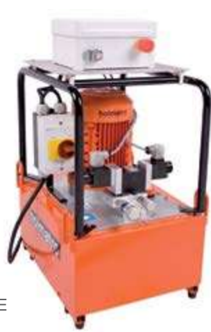
IPU-S 09 S 25 E