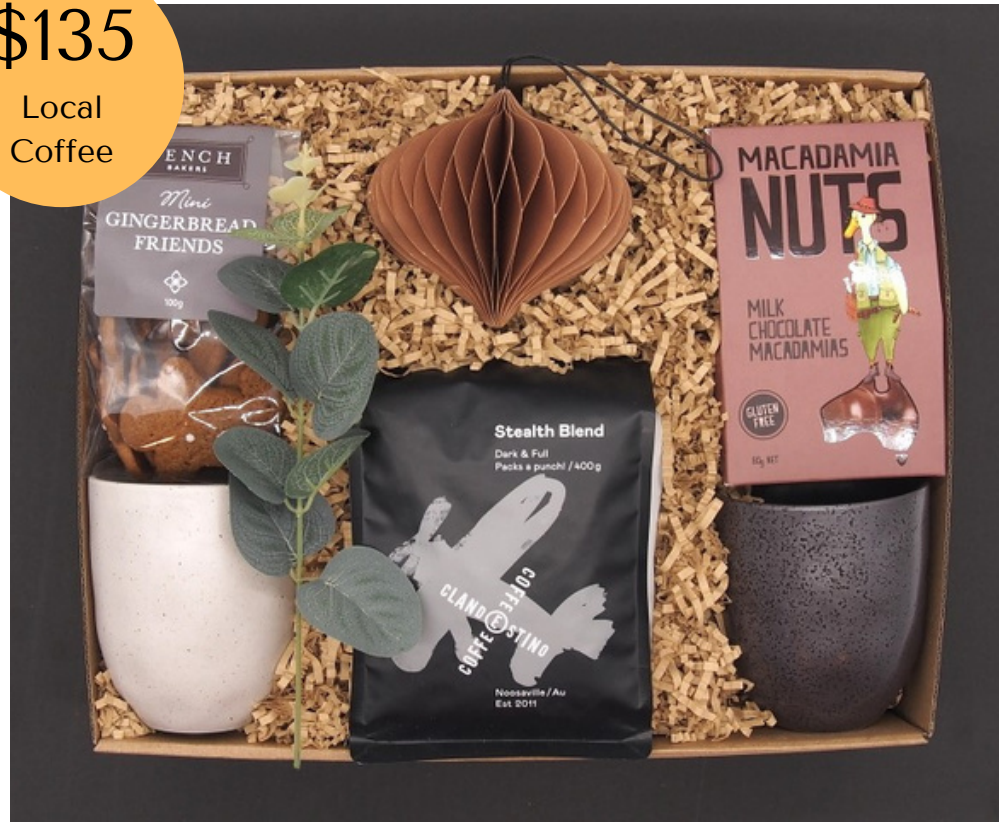
The Coffee Cup