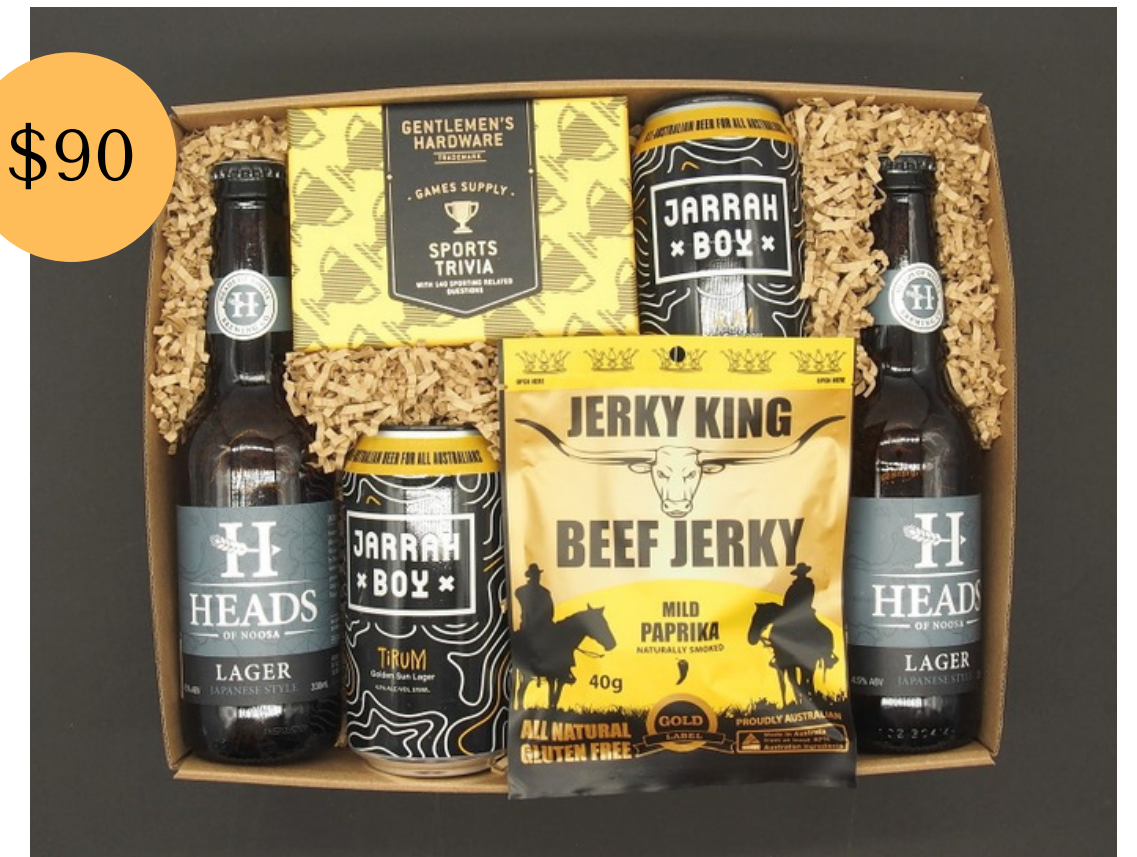
Beer & Sport at Christmas (Beer can be Swapped for Low or Non-Alcoholic)