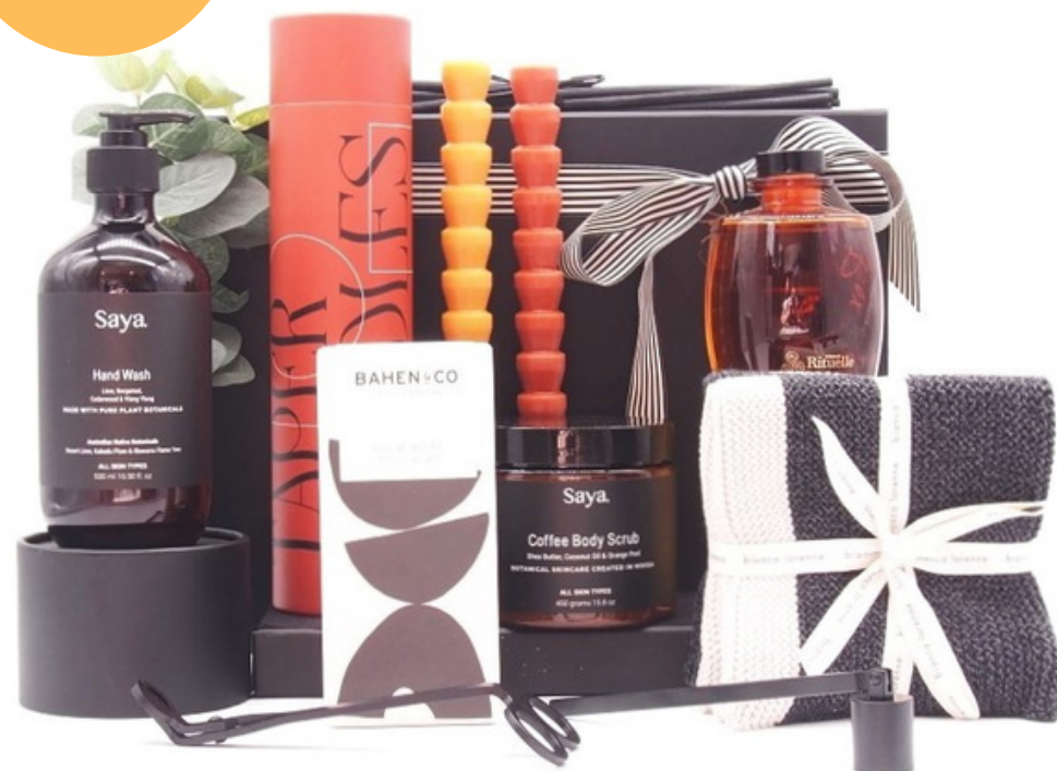
Christmas by Candlelight