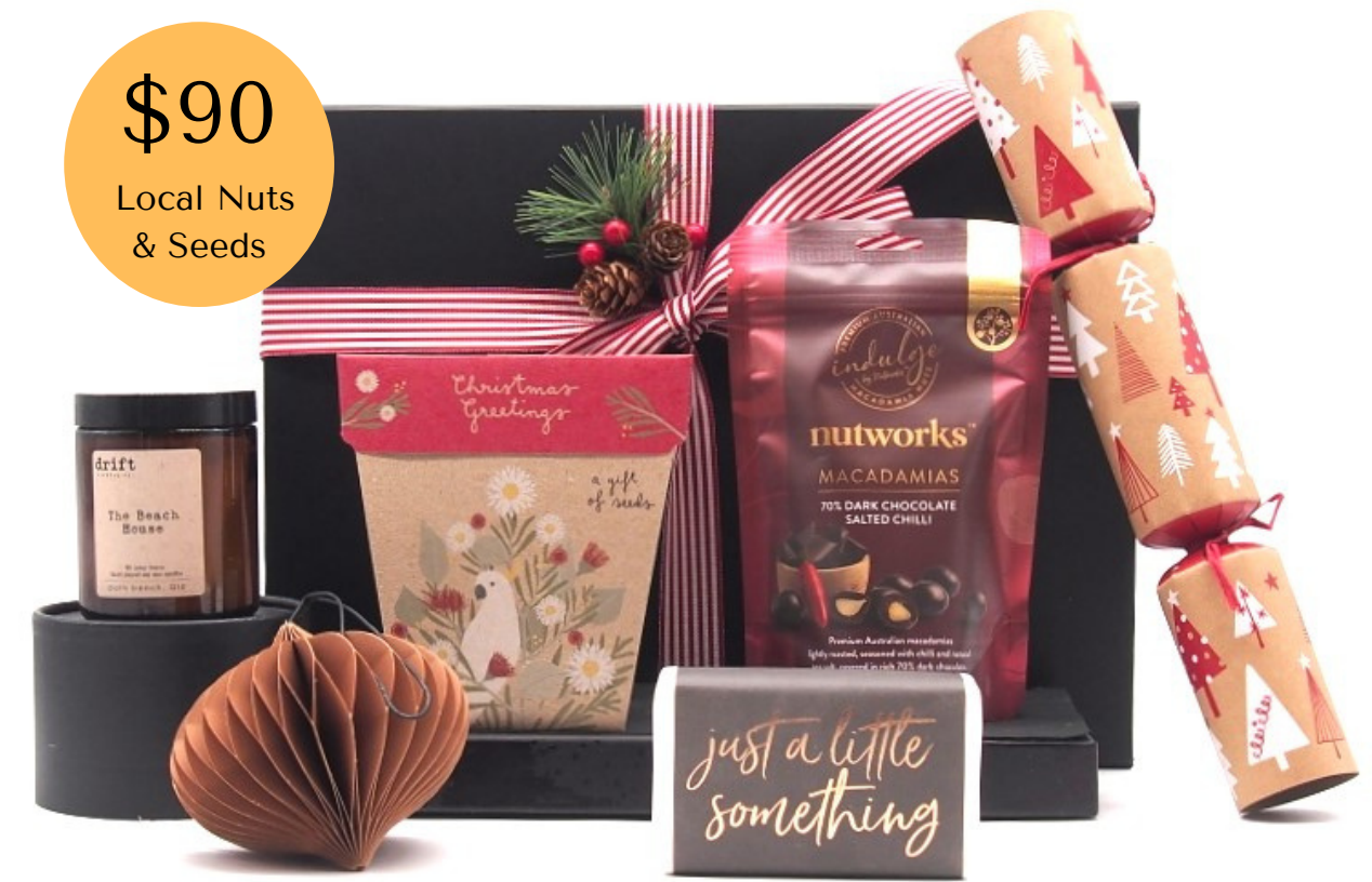
Just a Little Something for Xmas