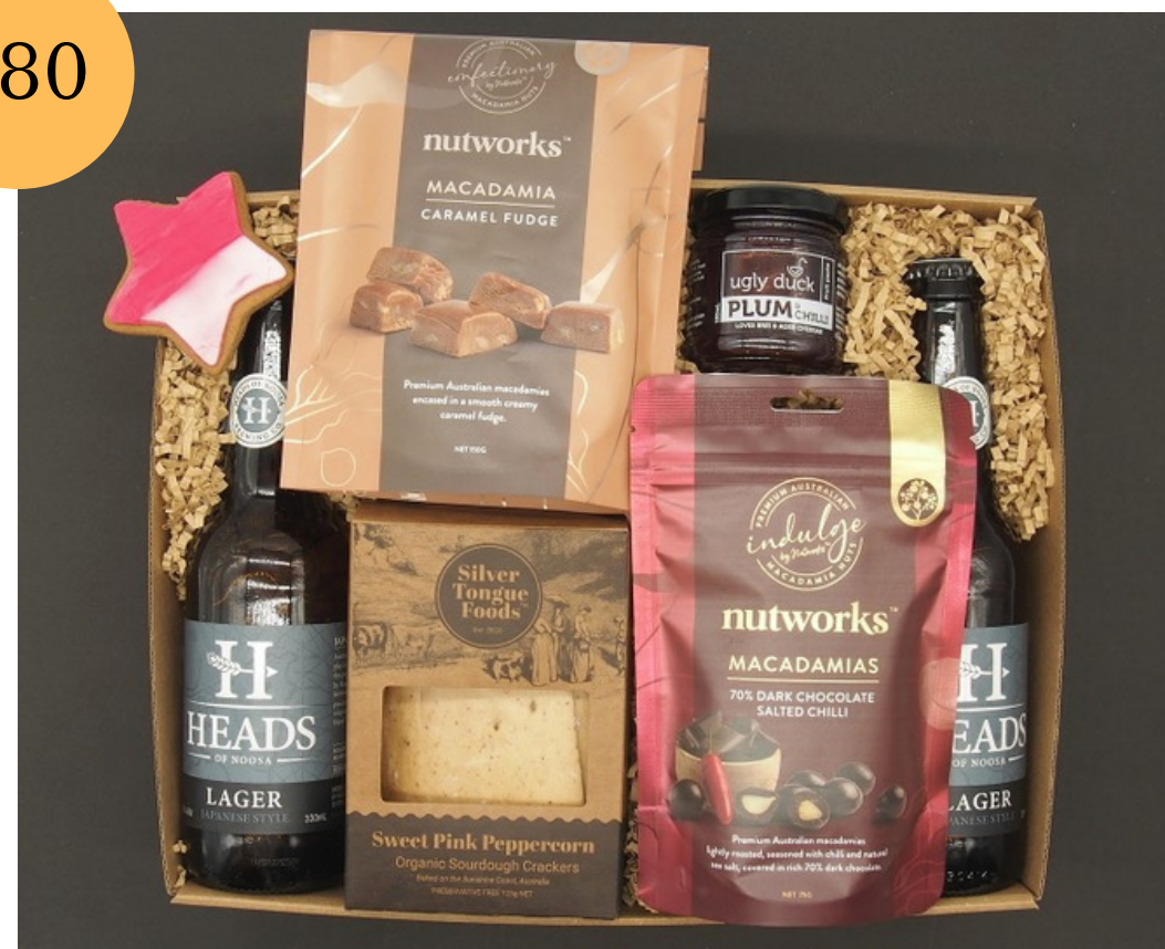
Local Christmas Beers & Bites (Beer can be Swapped for Low or Non-Alcoholic)