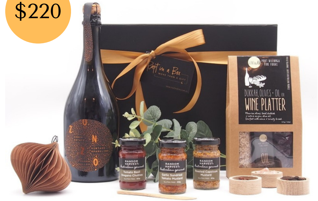
Christmas Bubbles & Savoury Delights