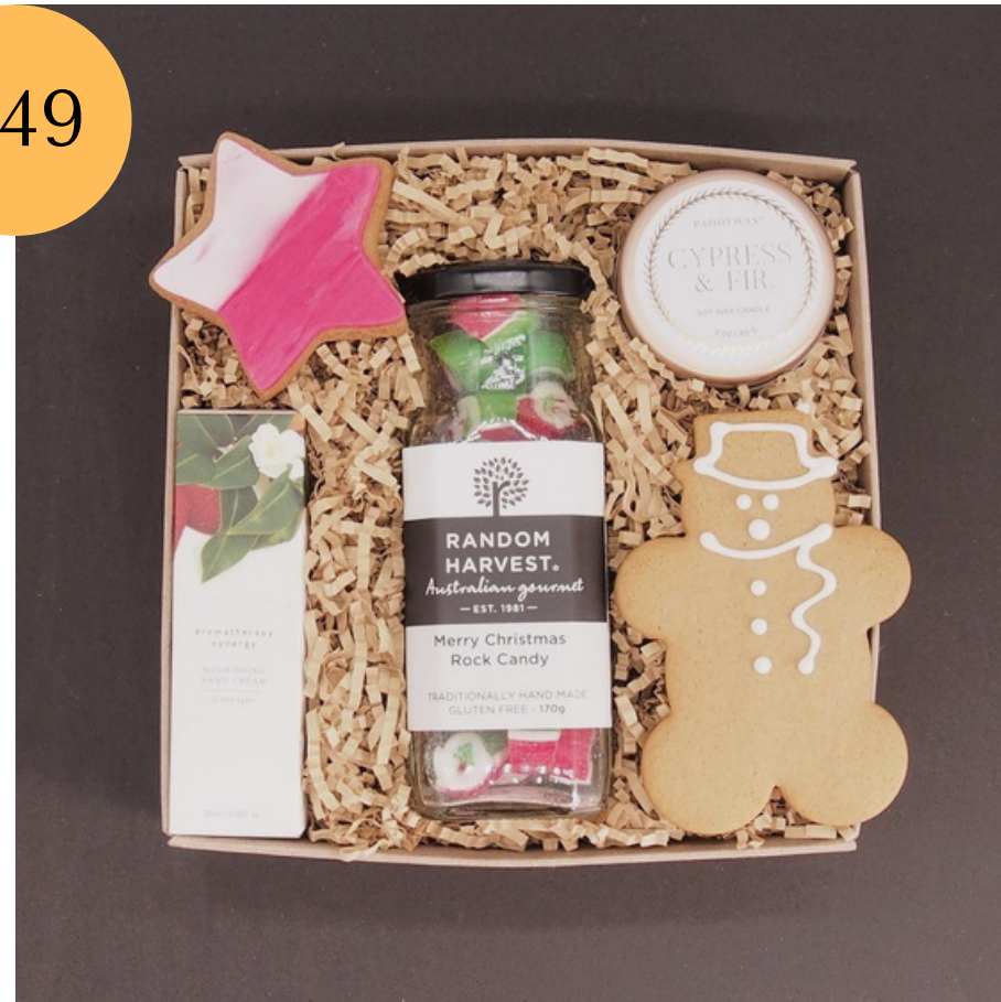
Ho. Ho. Ho!