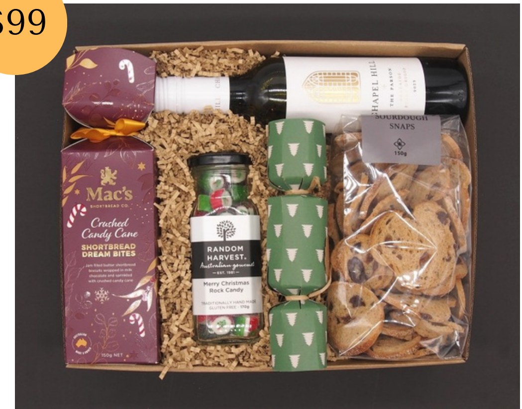
Festive Presence (Wine can be Swapped for Red or Non-Alcoholic)