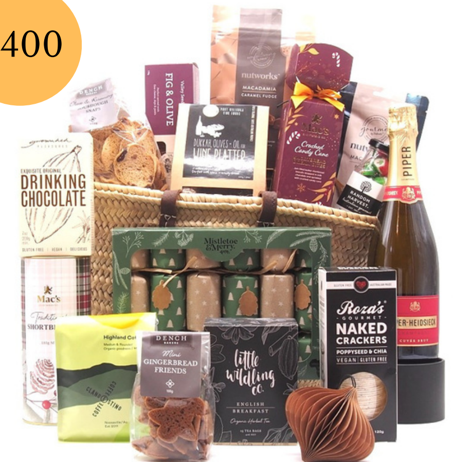
The Ultimate Christmas Basket