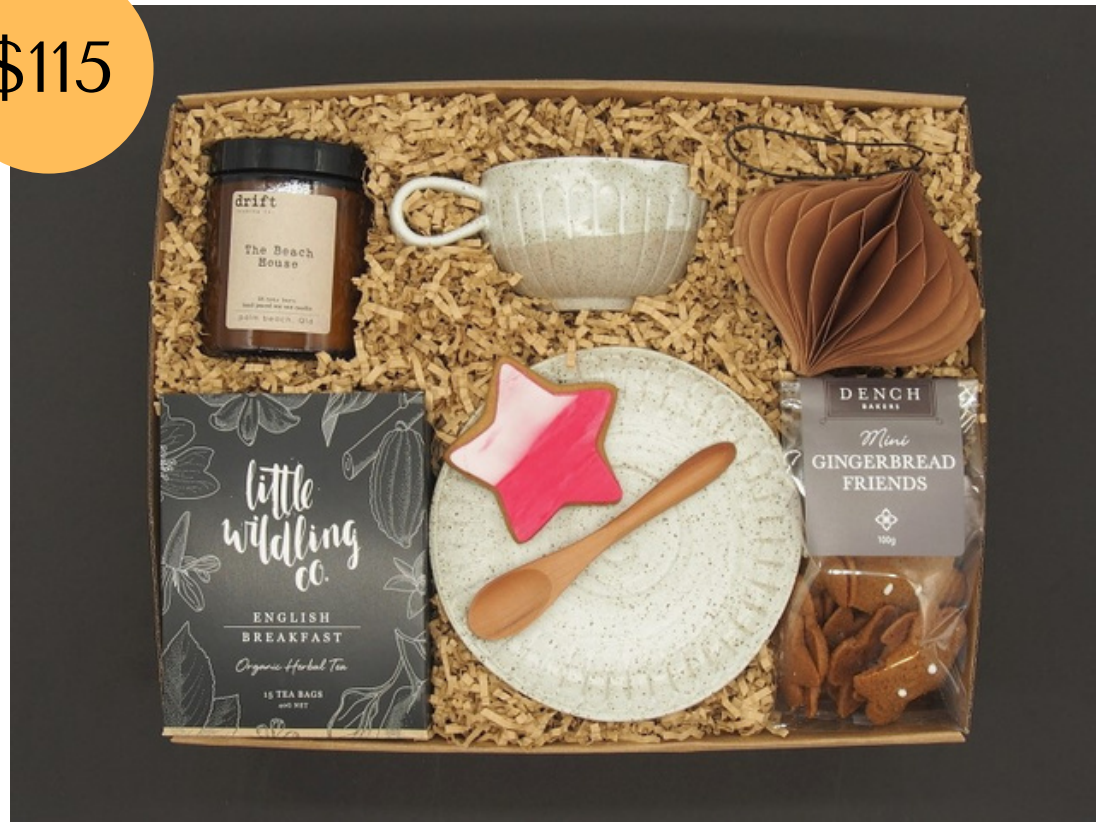
The Christmas Tea Cup