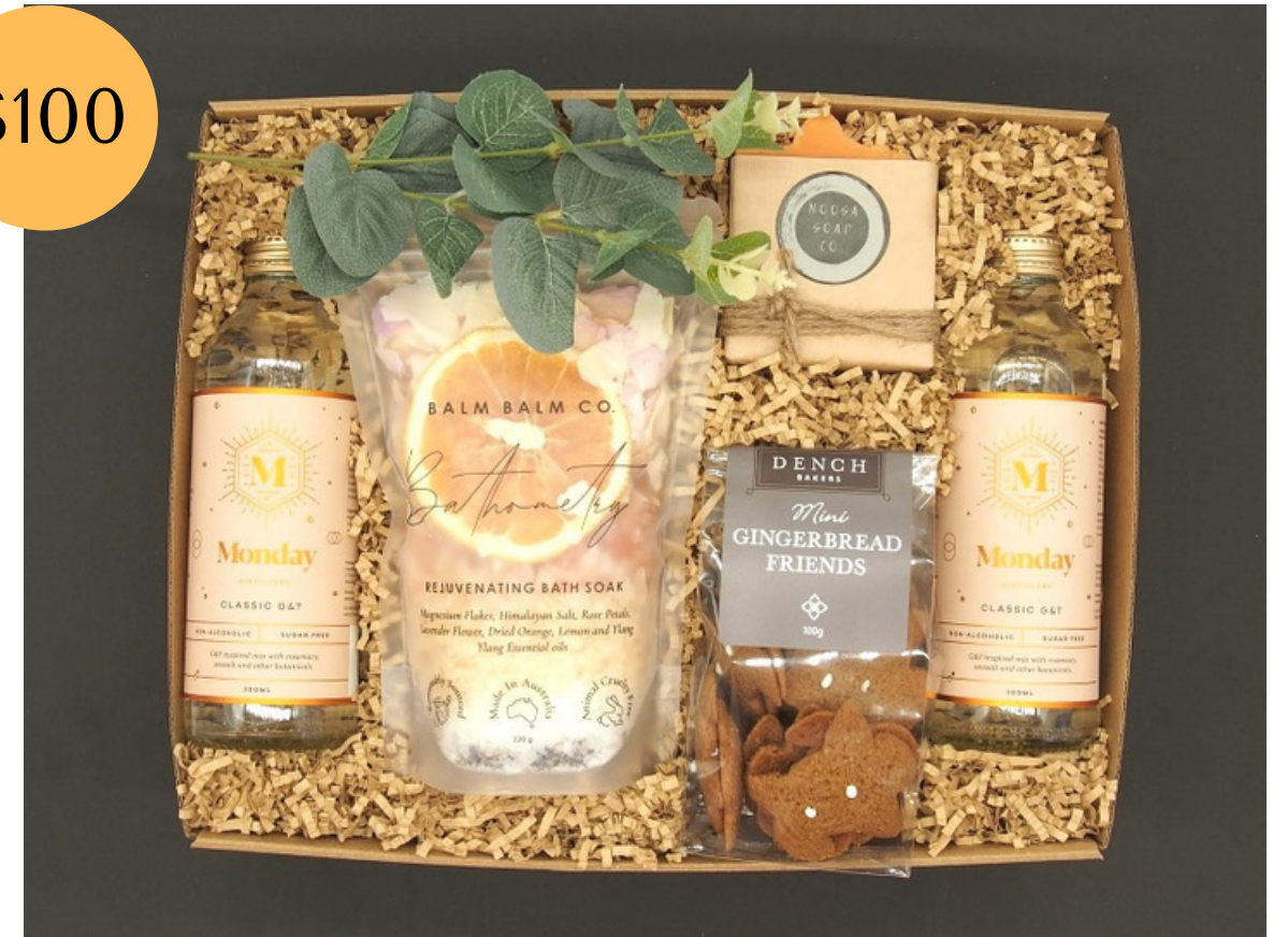
Mindful Christmas (Non-Alcoholic)