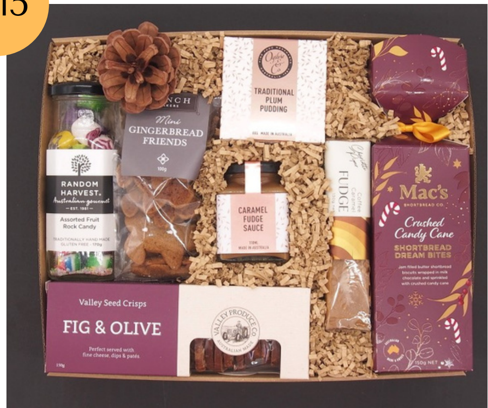
The Crushed Candy Cane