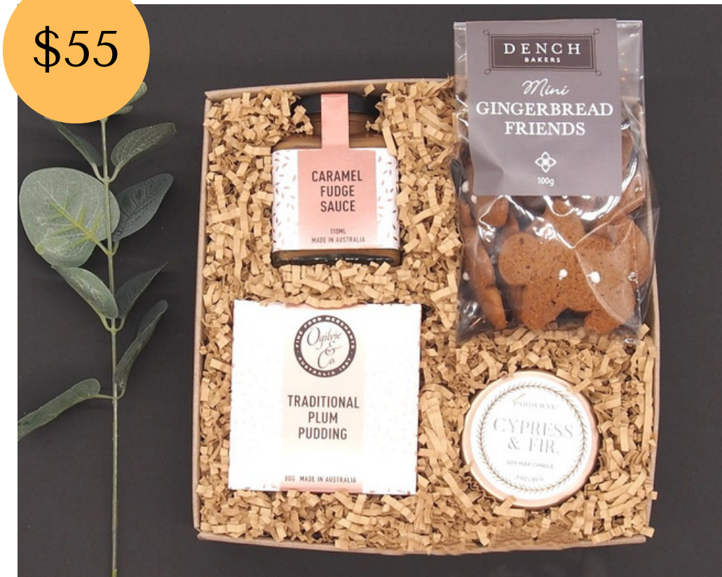
A Traditional Christmas