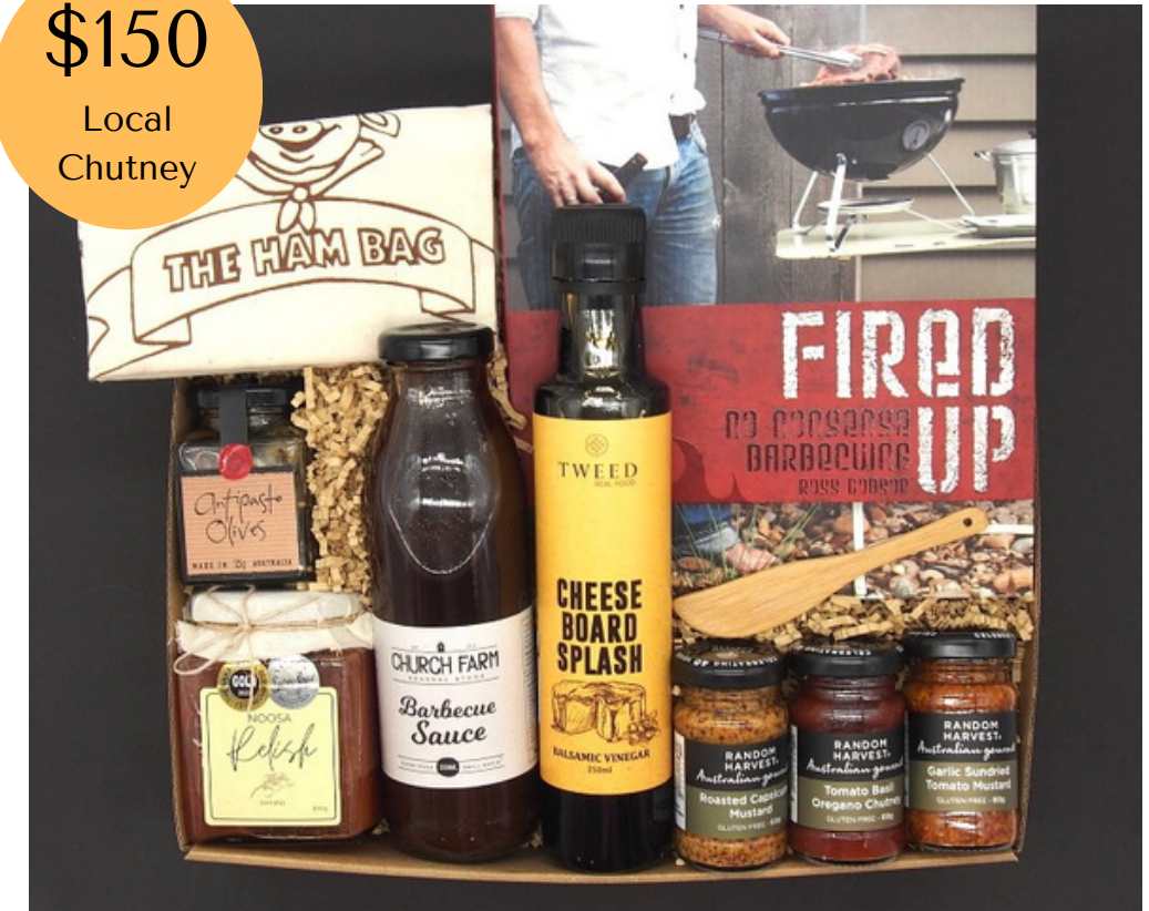
Christmas BBQ Box