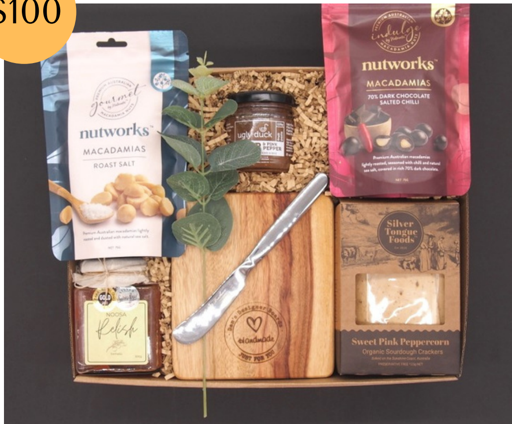
Christmas on the Sunshine Coast