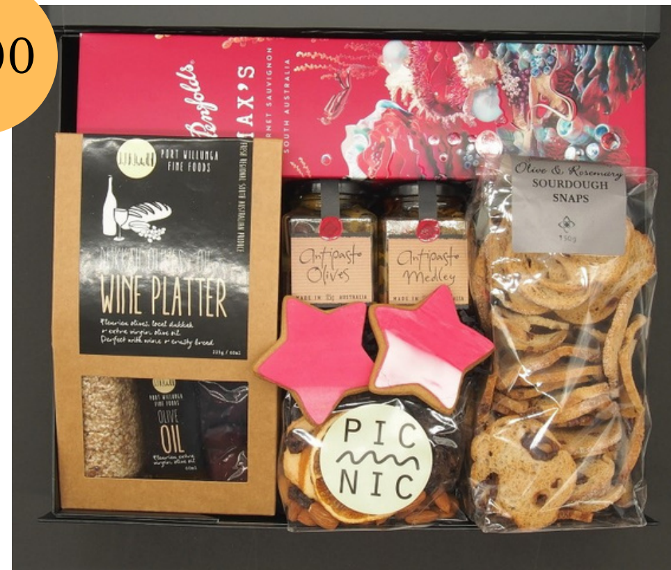
A Wine Down to Christmas