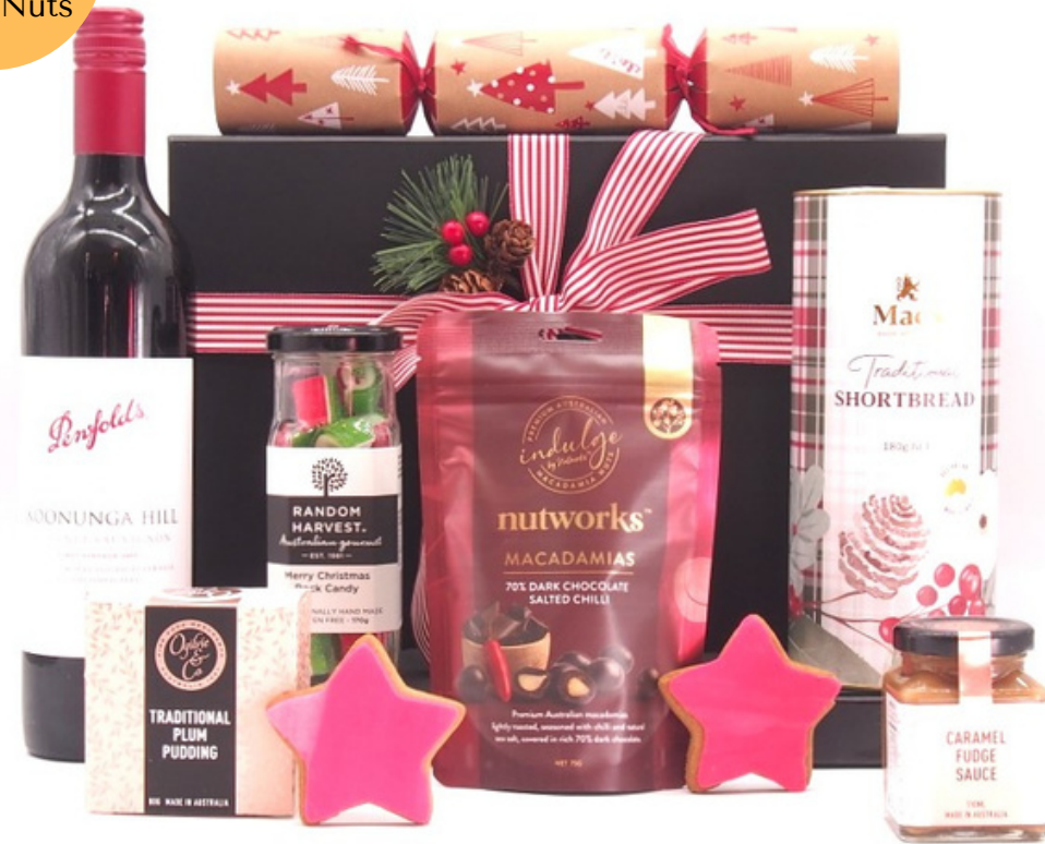
Christmas in a Box