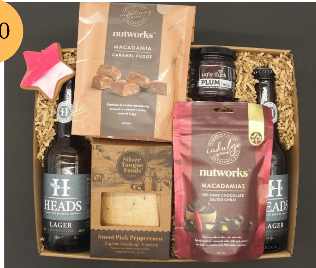
Local Christmas Bites & Beers (Beer can be Swapped for Low or Non-Alcoholic)