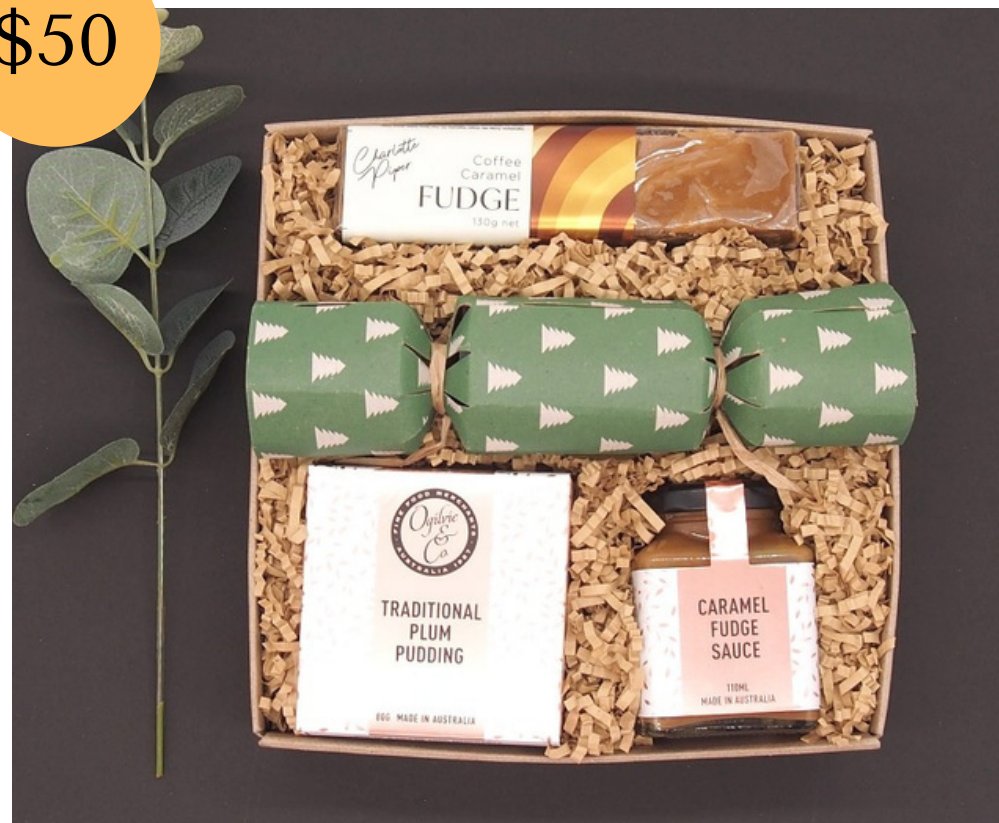
A Christmas Cracker