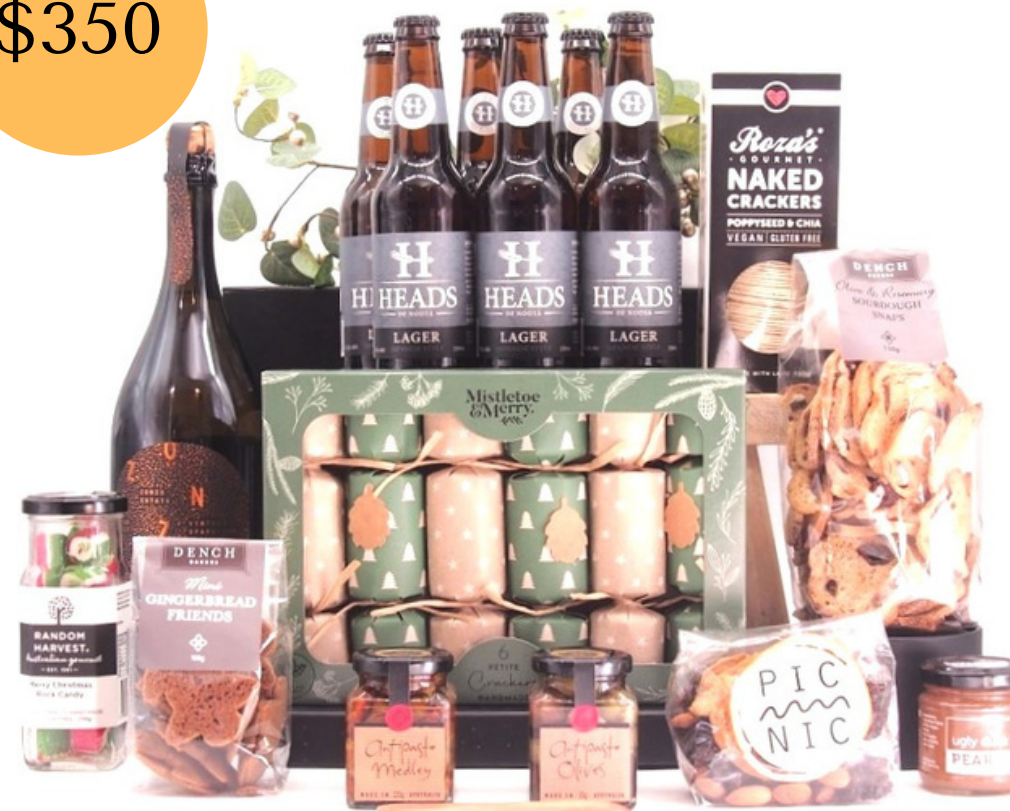
One for the Team in Hampton Cooler Bag