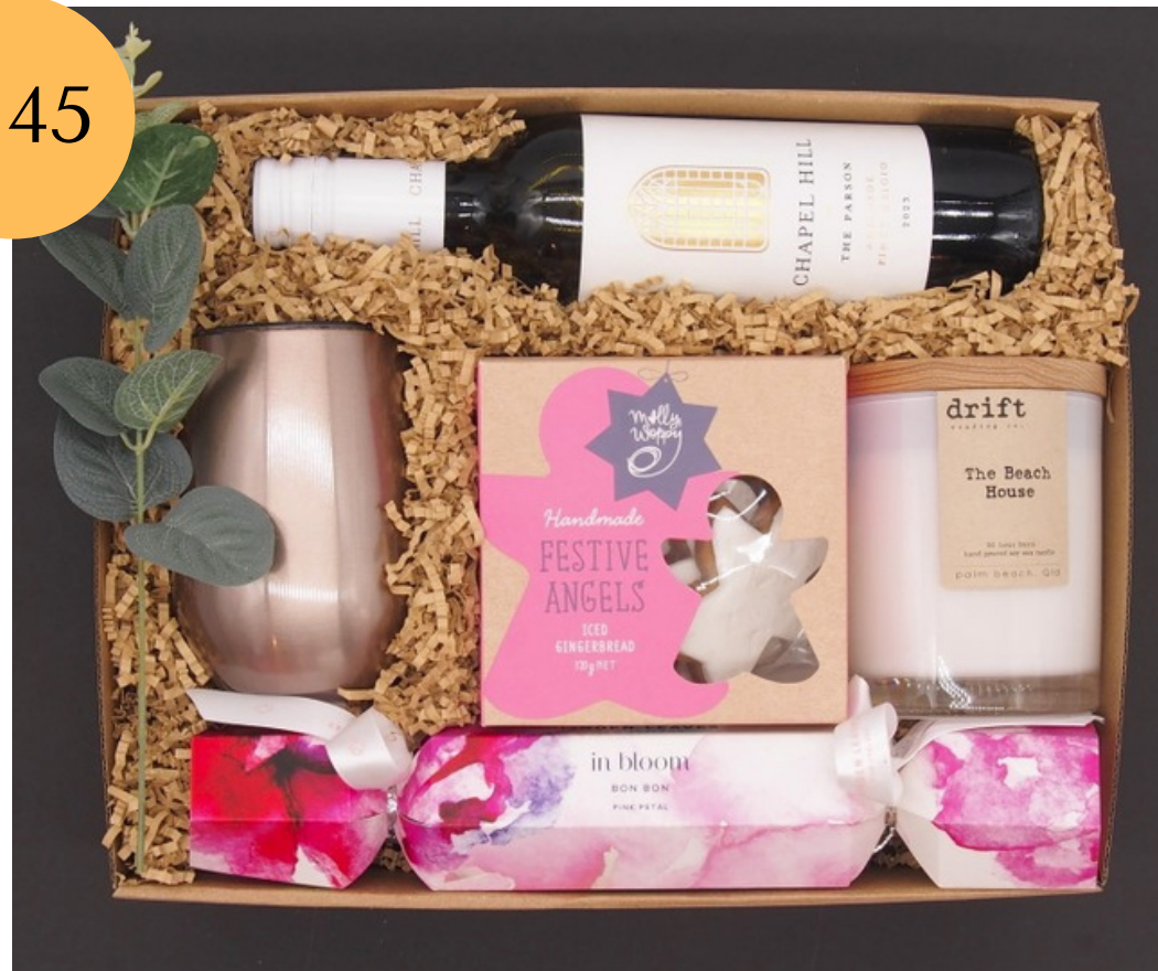
The Christmas Angel