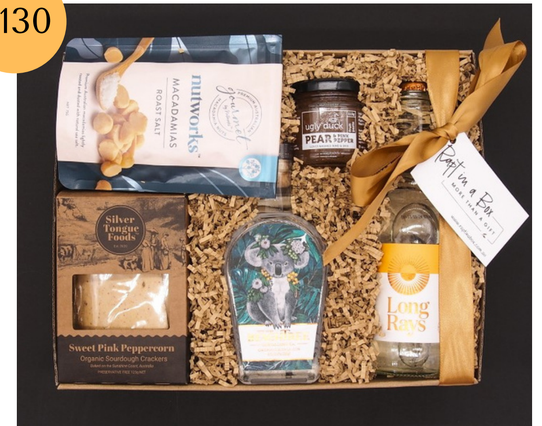
It's Gin Time