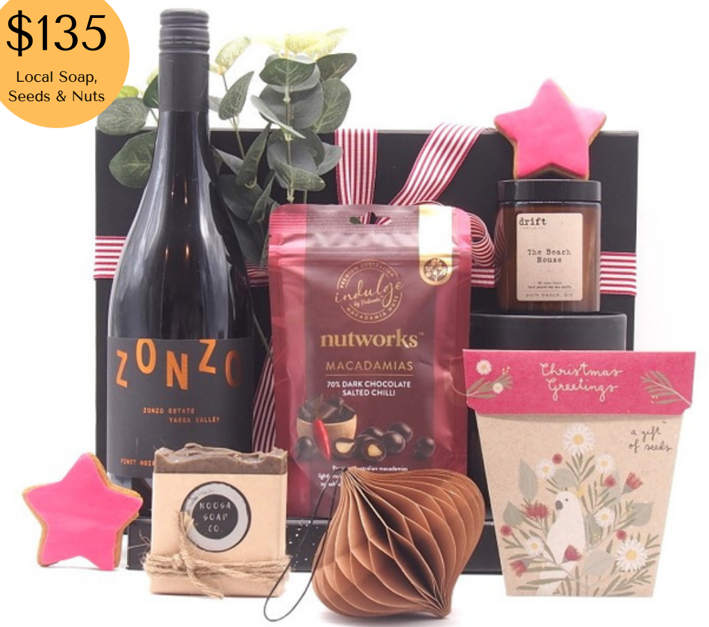
Sustainable Season Surprises