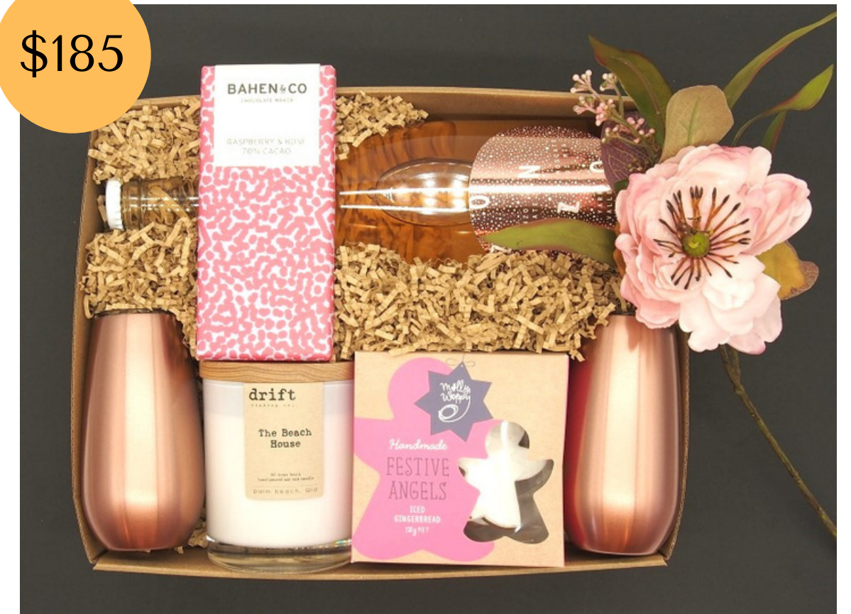
A Festive Toast