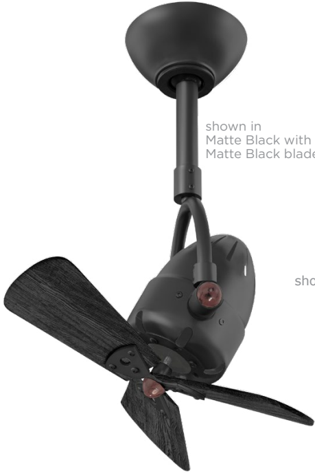
shown in Matte Black with Matte Black blades