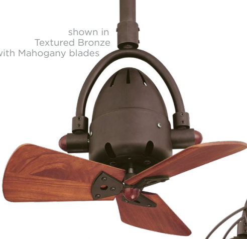
shown in Textured Bronze with Mahogany blades