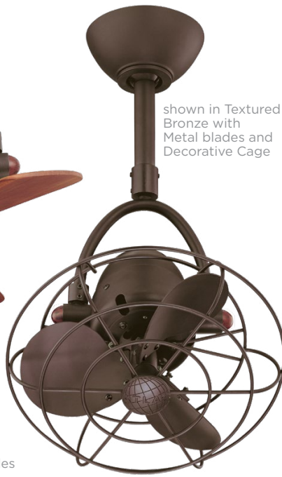
shown in Textured Bronze with Metal blades and Decorative Cage