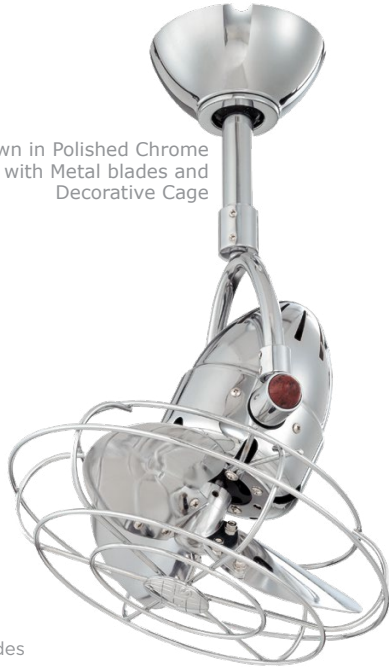
shown in Polished Chrome with Metal blades and Decorative Cage