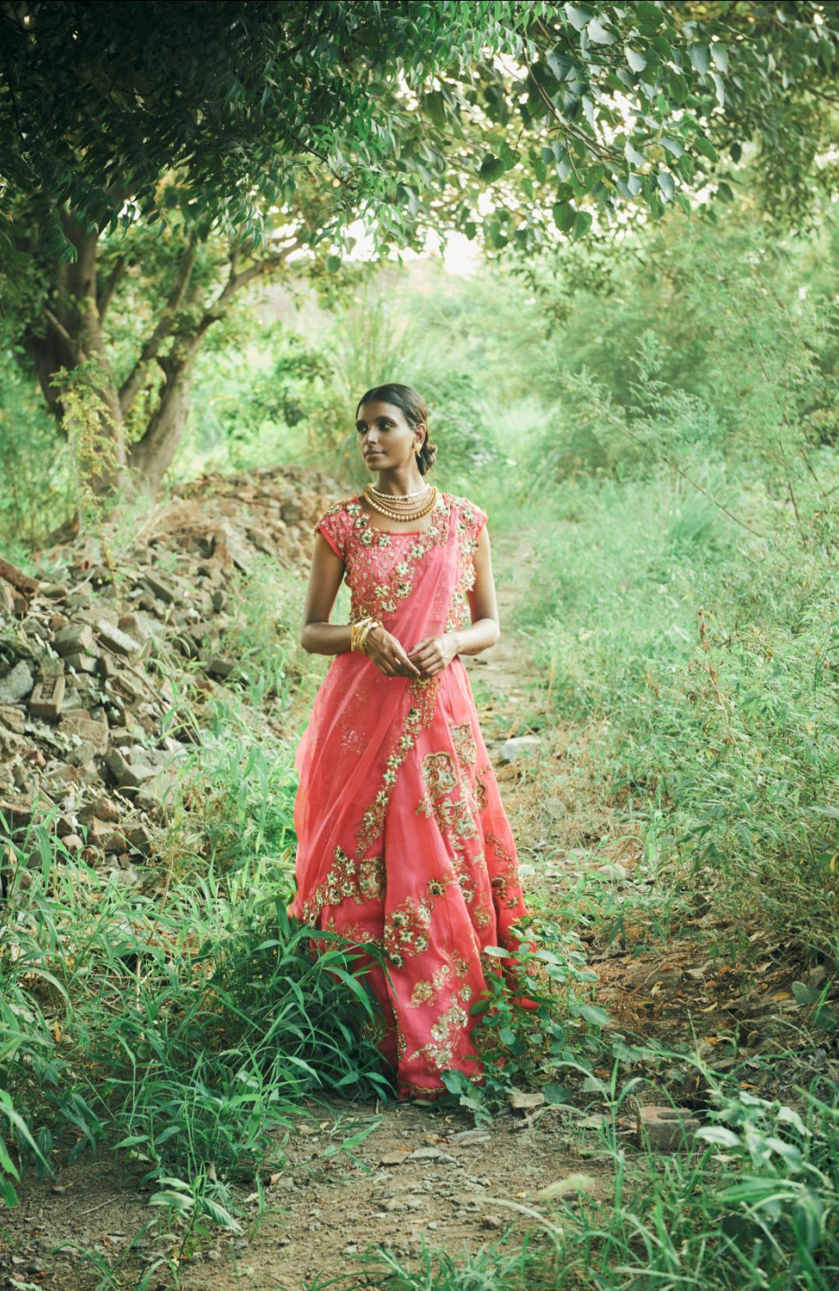
Candy pink Banarasi organza lehenga with pearl and zardozi work paired with blouse and cutwork border dupatta MRP: Rs 1,68,900