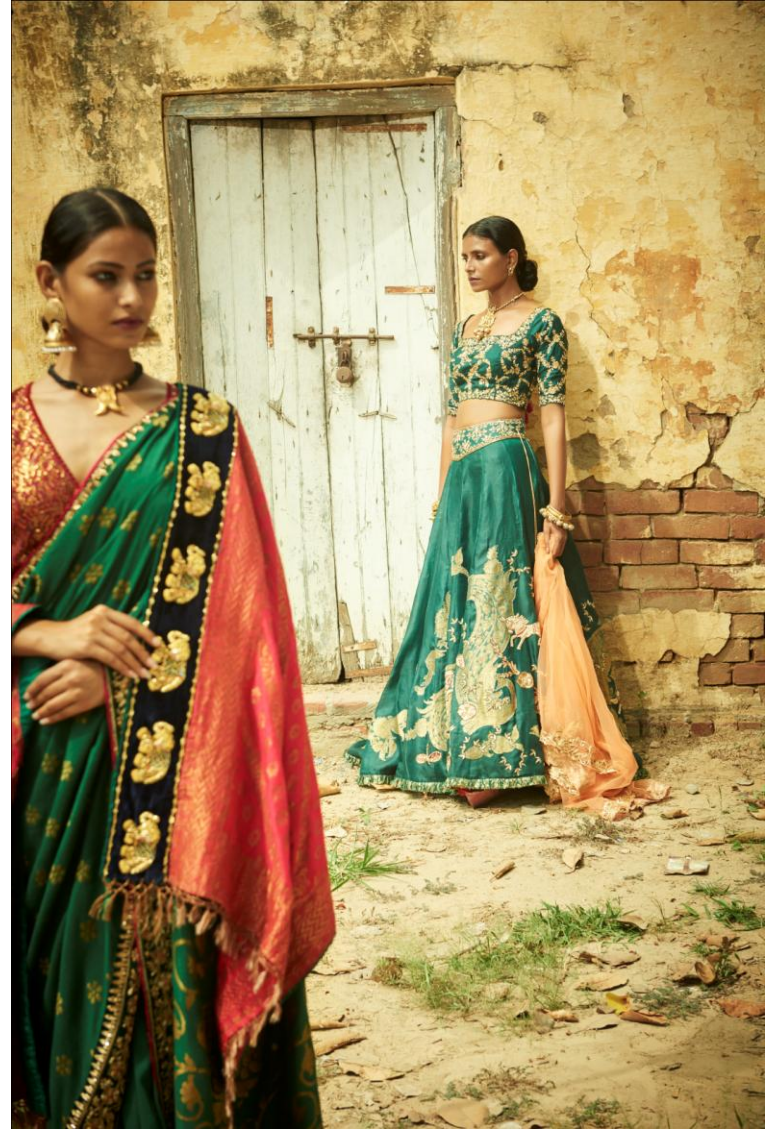
Deep Green handloom moonga silk Banarasi saree paired with a festive stole . MRP:Rs 78,900