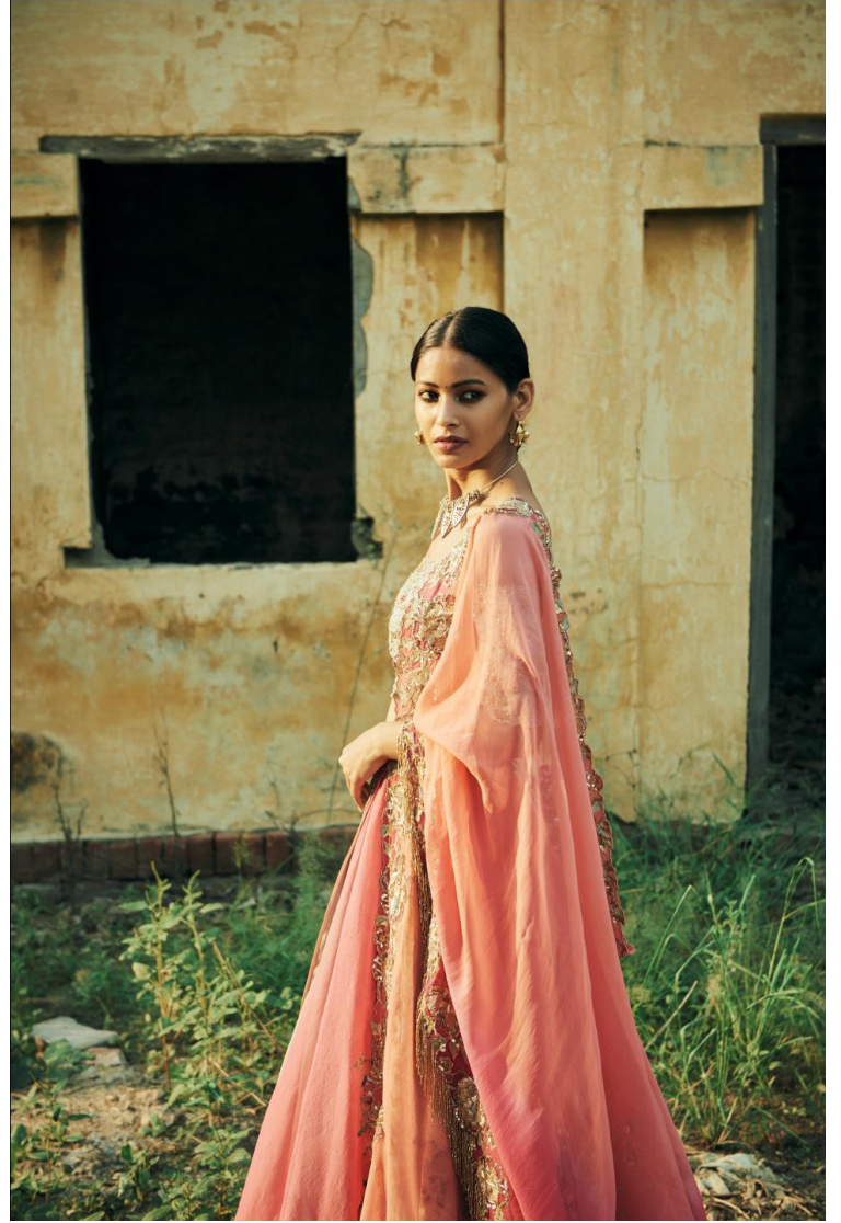
Triple layer digital banarasi fused with a layer of tissue lehenga MRP: Rs. 1,29,900