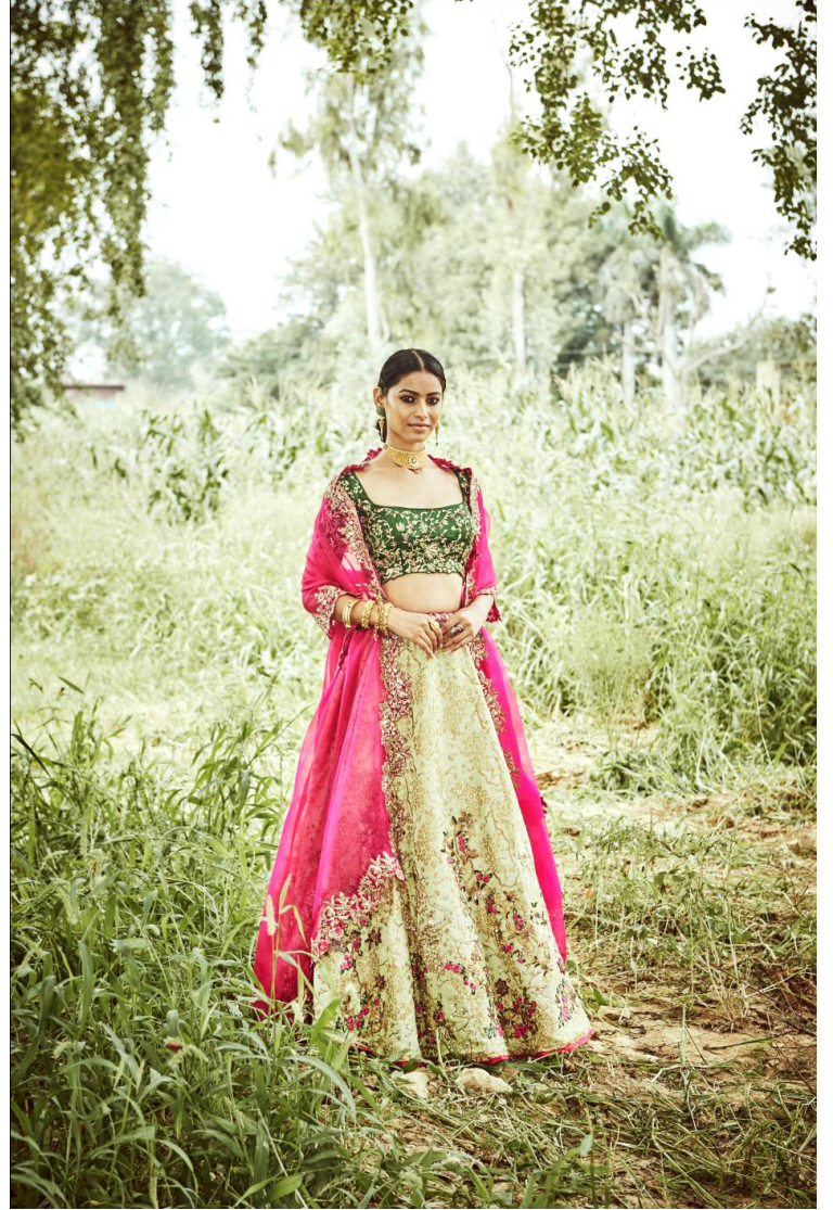
Handloom Banarasi peacock jaal lehenga with resham and colored dabka zardozi work paired with a deep green blouse and a cutwork sangaria pink orni .MRP:Rs 1,68,900