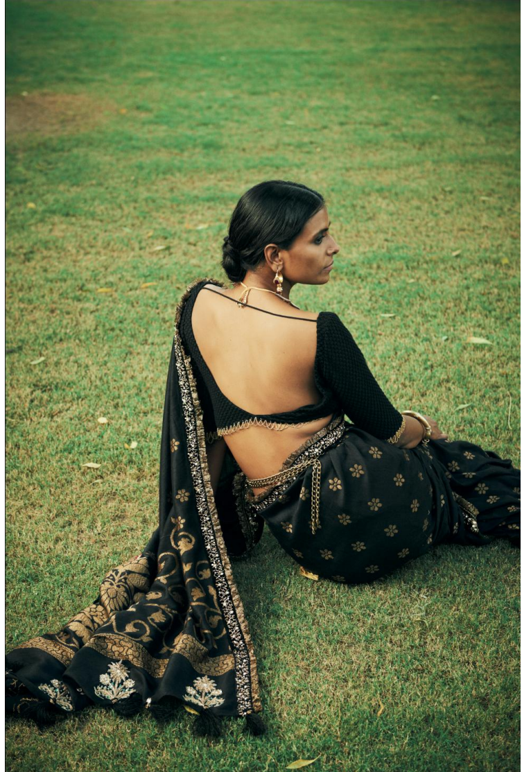
Black handloom moonga silk Banarasi saree with a paizeb blouse . MRP: 48,900