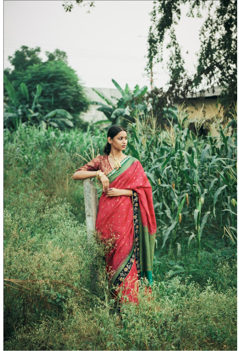
Red handloom moonga silk Banarasi embroidered saree . MRP: Rs 58,900