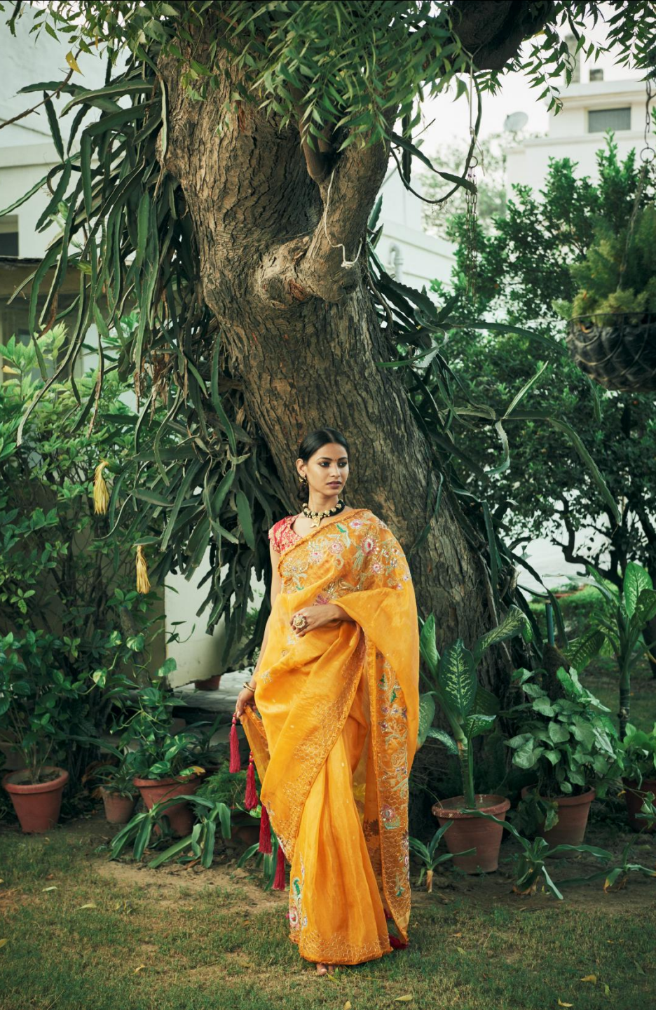
Tangerine Handloom chanderi Silk tissue saree embroidered with french knots beads and resham work fused with a beaded honeycomb jaal paired with deep pink blouse MRP: Rs 54,900