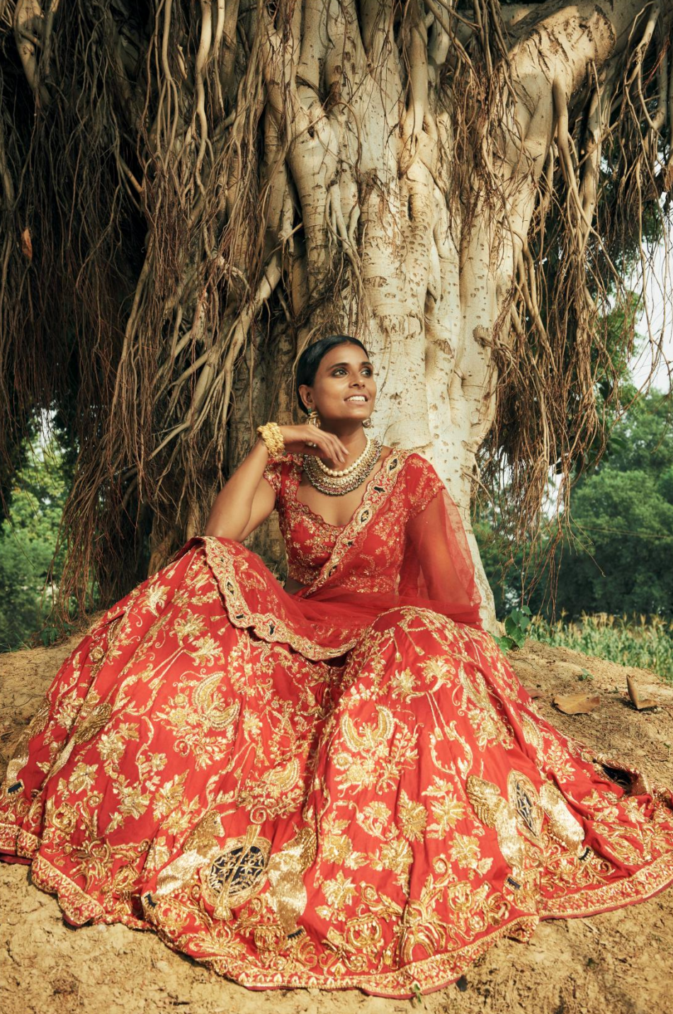
Sindoori Red silk lehenga with embossed unicorns motifs symboling magical new beginnings in heavy tarran and zardozi emb. paired with an embellished silk blouse and cutwork border orni. MRP: Rs 3,45,900