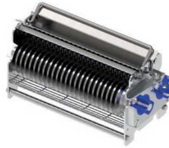
48-blade 3/8" (10MM) Strip Cutter Fajita cradle optional