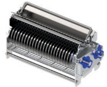
32-blade 5/8" (15MM) Strip Cutter Fajita cradle optional