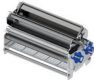
96-blade tenderizer cradle optional

Certified to UL Standard 763 and NSF Standard 08 Certified to CSA Standard C22.2