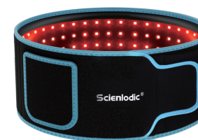
1. Red light therapy belt