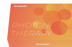
5. Packing box

*Accessories are subject to the actual item received.