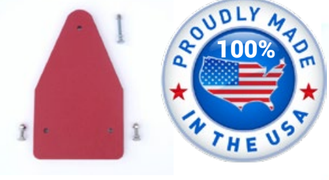
ICP-32 Infinity Cycle Seat Assembly ICP-29