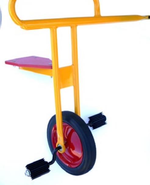
Complete Wheel & Fork Assembly