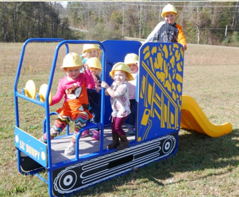
Lil Dumpy Slide Blue or yellow frame. IP-8010

USE ZONE: 21'6"L X 14'4"W DIMENSIONS: 9'6"L X 2'3"W X 4'9" WEIGHT: 255 LB