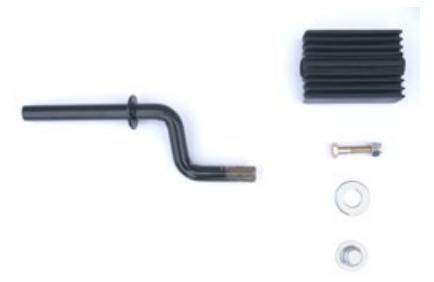
Infinity Cycle Pedal Assembly ICP-44