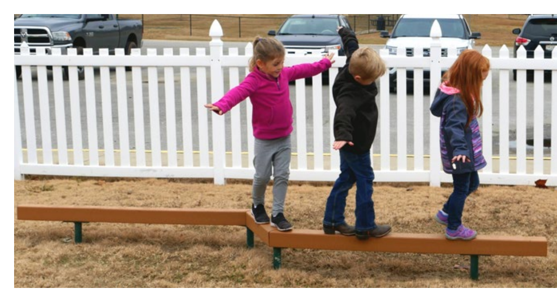
DIMENSIONS: 132"L X 24"W X 10"H WEIGHT: 80 LB USE ZONE: 23'L X 16'W

It is great for promoting coordination and physical fitness. It has the look of lumber but will not splinter or decay and very low to no maintenance. Built of Recycled Plastic Lumber. IP-8040