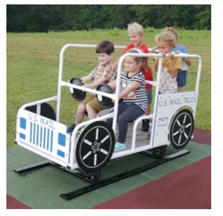
The Post Office Playhouse couples well with our Mail Truck Spring Vehicle IP-7010

USE ZONE: 17'8"L X 15'W DIMENSIONS: 5'9"L X 2'7"W X 3'1"H