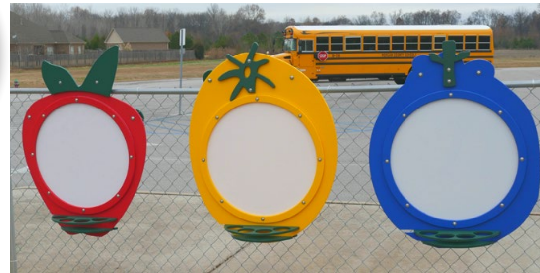
DIMENSIONS: 43"H x 31"w x 8"THICK W/PAINT CUP HOLDER