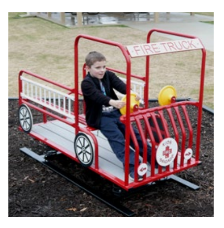
The Fire Station Playhouse couples well with our Fire Engine Spring Vehicle IP-8002

USE ZONE: 17'9"L X 15'W DIMENSIONS: 6'7"L X 3'4"W X 4'7"H