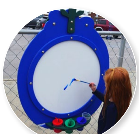
DIMENSIONS: 40"L x 34"W x 1"THICK WEIGHT: 20 LB

These apple, pineapple, and blueberry inspired panels are made of HDPE Plastic and the center white portion is made of White Plexiglass. Washable. IP-8050