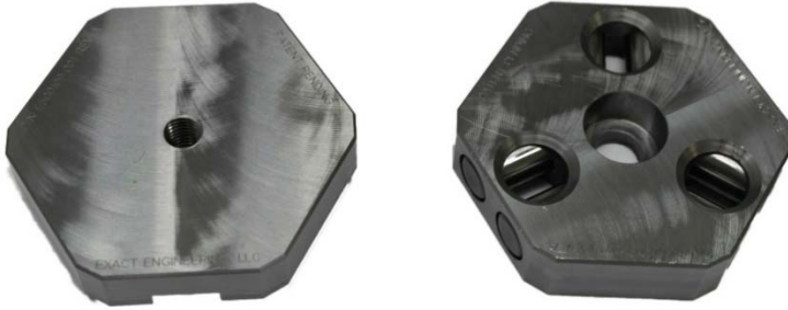
Kinematic Top (left) and Kinematic Base (right)

NOTE: The system uses 3 very strong rare earth magnets for nesting forces. Provided is a 4 th spare magnet. We recommend you not install the magnets until you have the system mounted to the machine and the probe mounted to the kinematic top. This is to prevent the magnets from “grabbing” loose parts and potentially damaging the magnets. See our youtube channel Exact Engineering, LLC for video installation instructions.