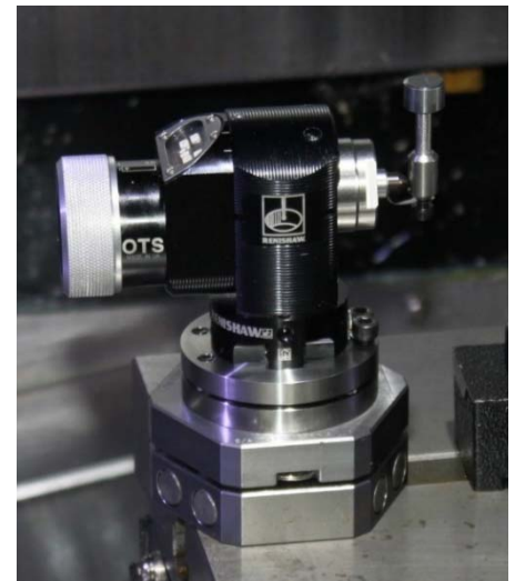
Probe mated to Kinematic Base.