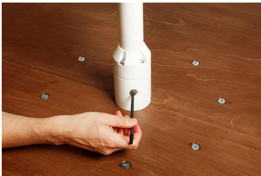
Picture 5. The bolt for switching between static/spinning mode

Note! The bolt needs to be lubricated every 5th time the pole is mounted or at least every other month.