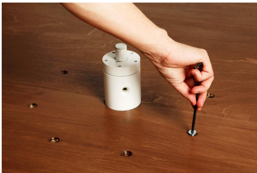
Picture 2. Tightening the bolts between the wooden elements and the metallic plate

Screw the bolts (8 pcs) to their holes according to the picture (picture 2.). Tighten the bolts to appropriate tightness. Be careful not to damage the threads in the metallic plate.