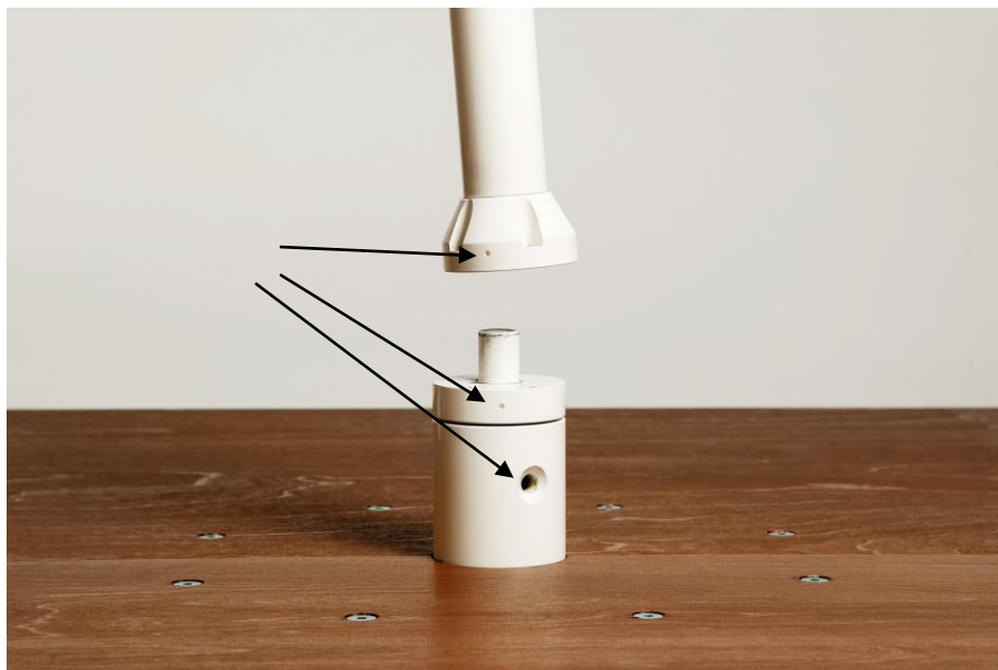
Picture 3. Attaching the pole to the stage

The pole and the metallic base plate both have alignment marks for aligning the bolt holes (picture 3). Make sure that the alignment holes indicated by the upper arrows (picture 3) are aligned properly.