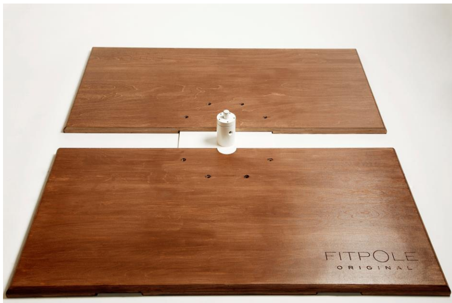
Picture 1. Attaching the metallic plate to the wooden stage elements

Screw the bolts (8 pcs) to their holes according to the picture (picture 2.). Tighten the bolts to appropriate tightness. Be careful not to damage the threads in the metallic plate.