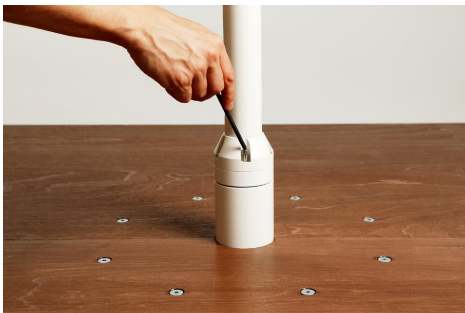
Picture 4. Installing the bolts

Screw the bolts of the pole (5 pcs) to their holes according to the picture (picture 4) with the ball end of the hex wrench. Tighten the bolts to appropriate tightness with the other end of the wrench.