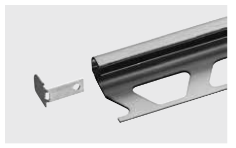
Schlüter®-RONDEC-EB/EK (Brushed stainless steel end cap for Schlüter®-RONDEC-E and -EB)