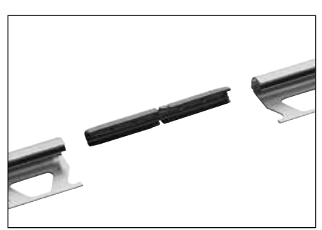
Schlüter®-RONDEC-A/V (Connector for aluminium profiles)