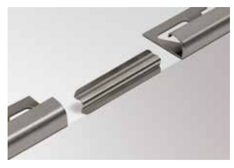
Schlüter®-RONDEC-E/V (Connector for stainless steel profiles)