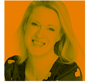
(No class: THUR 23 FEB)