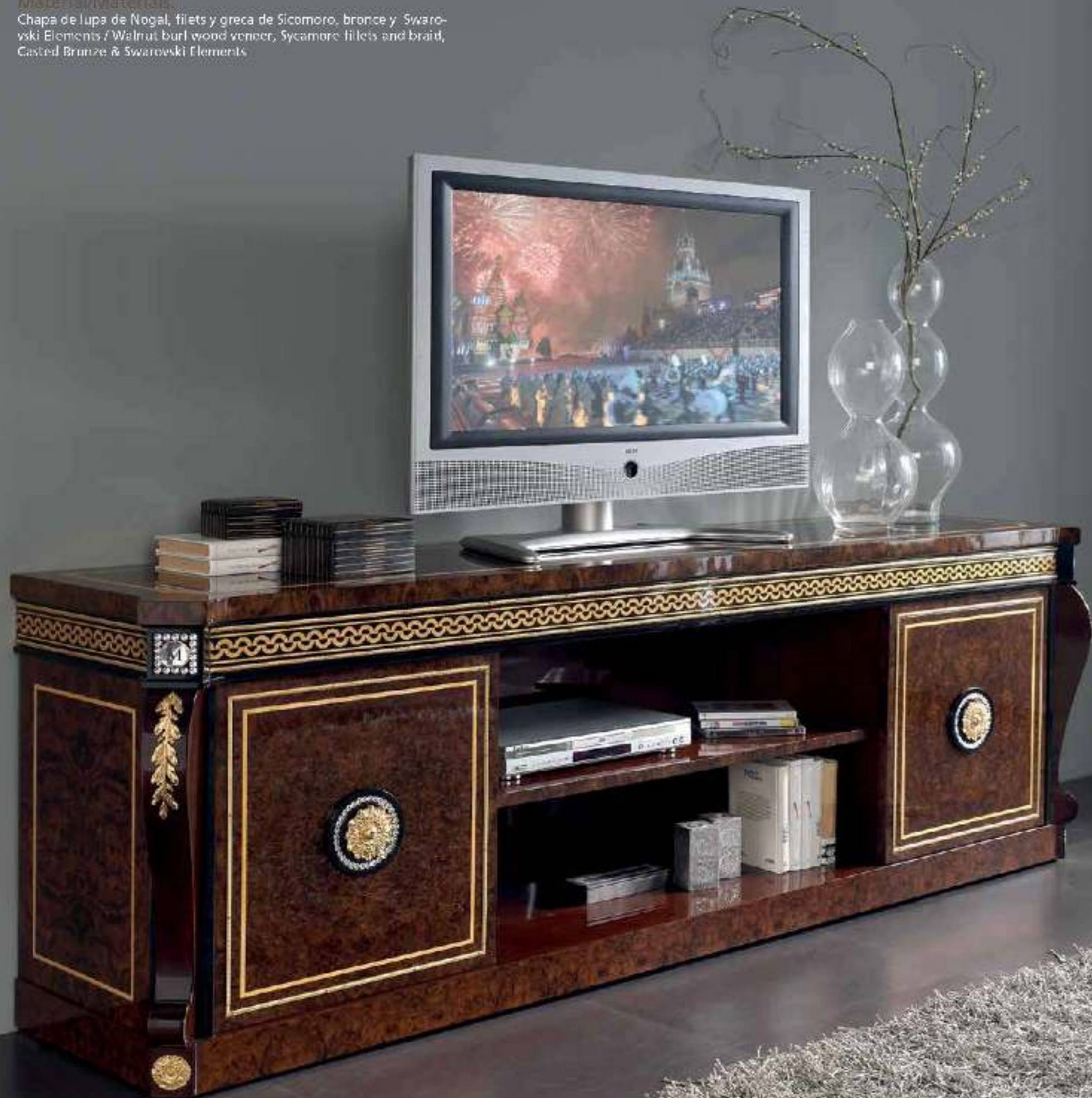
Mueble TV/TV Furniture - 772221 - 50 cm/30,31" | 87,01" | 19,69" Acabado/Finish: NO/DA (19/231) - Peso neto/Net Weight: 103,00Kg/226,87Lb

Chapa de lupa de Nogal, filets y greca de Sicomoro, bronce y Swarovski Elements / Walnut burl wood veneer, Sycamore filets and braid, Casted Bronze & Swarovski Elements