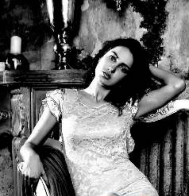
Mesa central/Coffee Table

501.125-1252cm 19,69"149,21"149,21" Acabado/Finish: N/PL.ANT. (66/387) Peso neto/Net Weight: 118,07kg/259,91lb