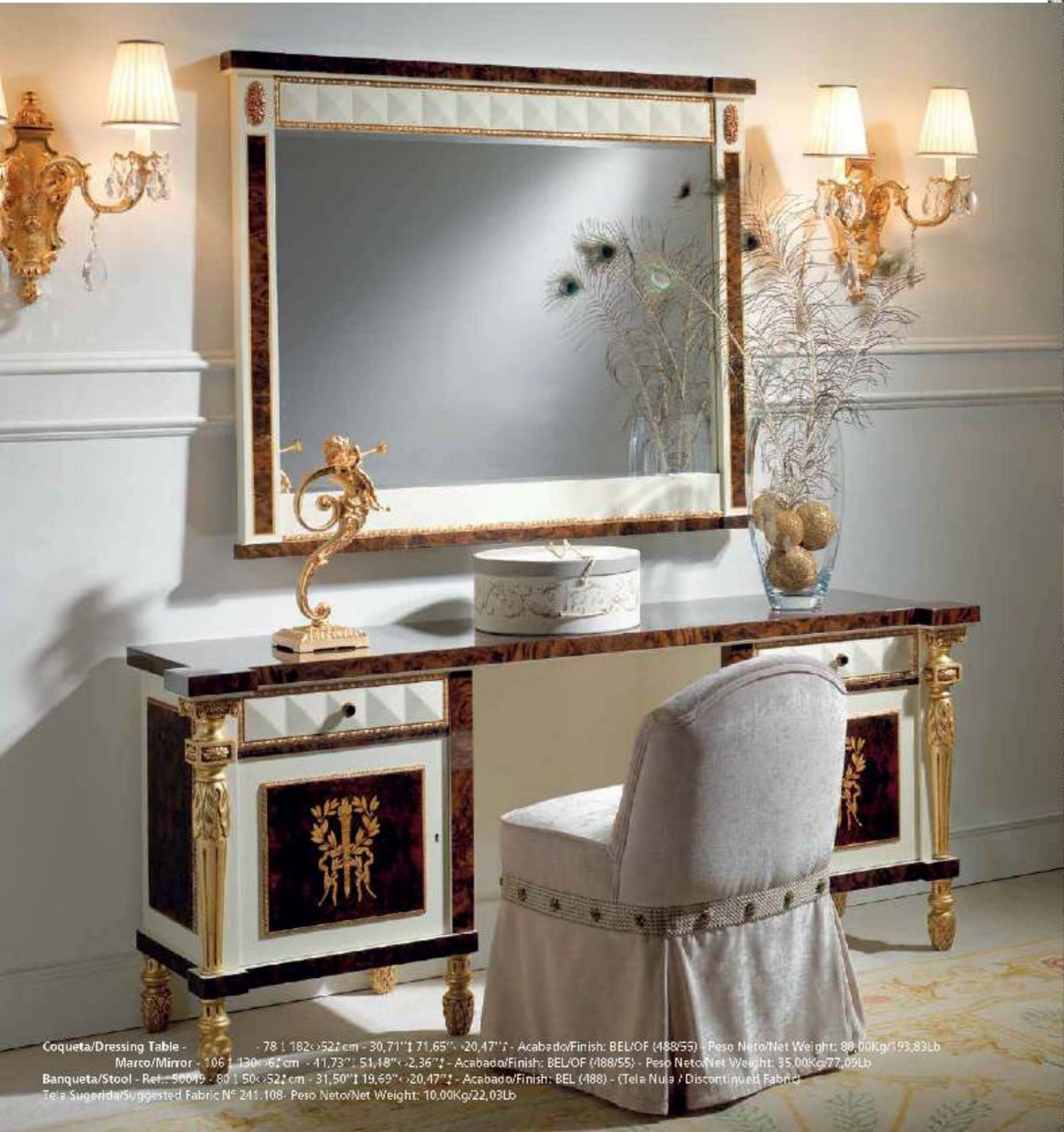
Coqueta/Dressing Table - 78 1 182x522 cm - 30,71" x 71,65" x 20,47" - Acabado/Finish: BEL/OF (488/55) - Peso Neto/Net Weight: 89,00Kg/193,83Lb Marco/Mirror - 106 1 120x62 cm - 41,73" x 51,18" x 2,36" - Acabado/Finish: BEL/OF (488/55) - Peso Neto/Net Weight: 35,00Kg/77,09Lb Banqueta/Stool - Ref.: 50049 - 80 1 50x522 cm - 31,50" x 19,69" x 20,47" - Acabado/Finish: BEL (488) - (Tela Nula / Discontinued Fabric) Tela Sugerida/Suggested Fabric N° 241.108 - Peso Neto/Net Weight: 10,00Kg/22,03Lb