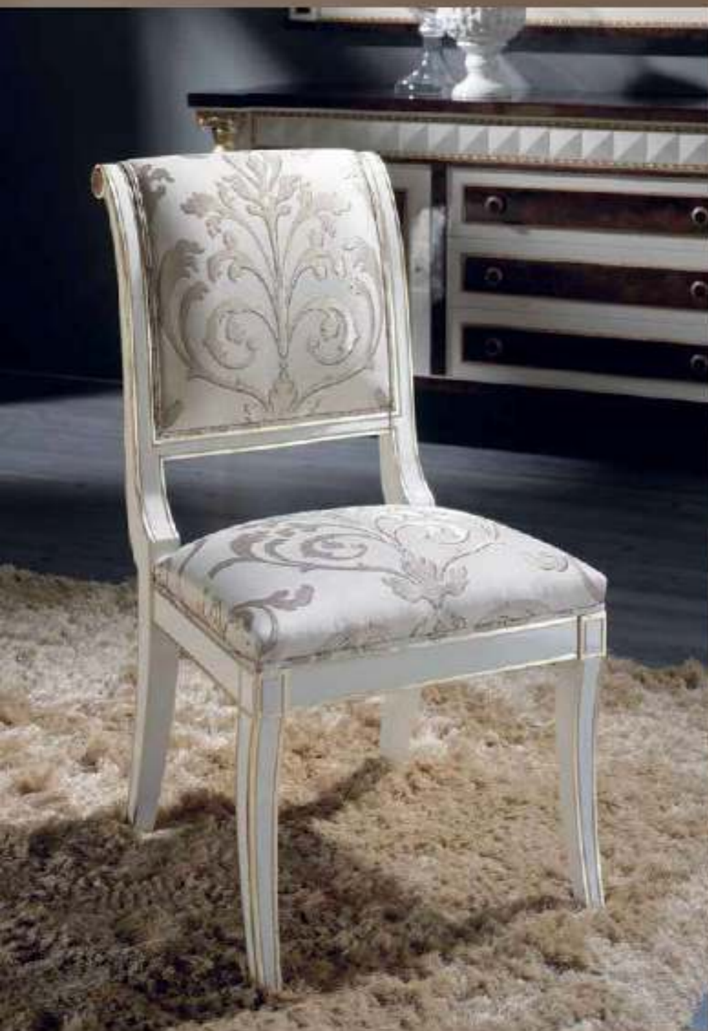
Silla/Chair 100 | 58x65 | cm 39,37" | 22,83" | 25,59" | Acabado/Finish: BEL/OF (488/55) Peso neto/Net Weight: 10,00Kg/22,03 lb

Tela Nula/Discontinued Fabric Tela Sugerida/Suggested Fabric N°241.108