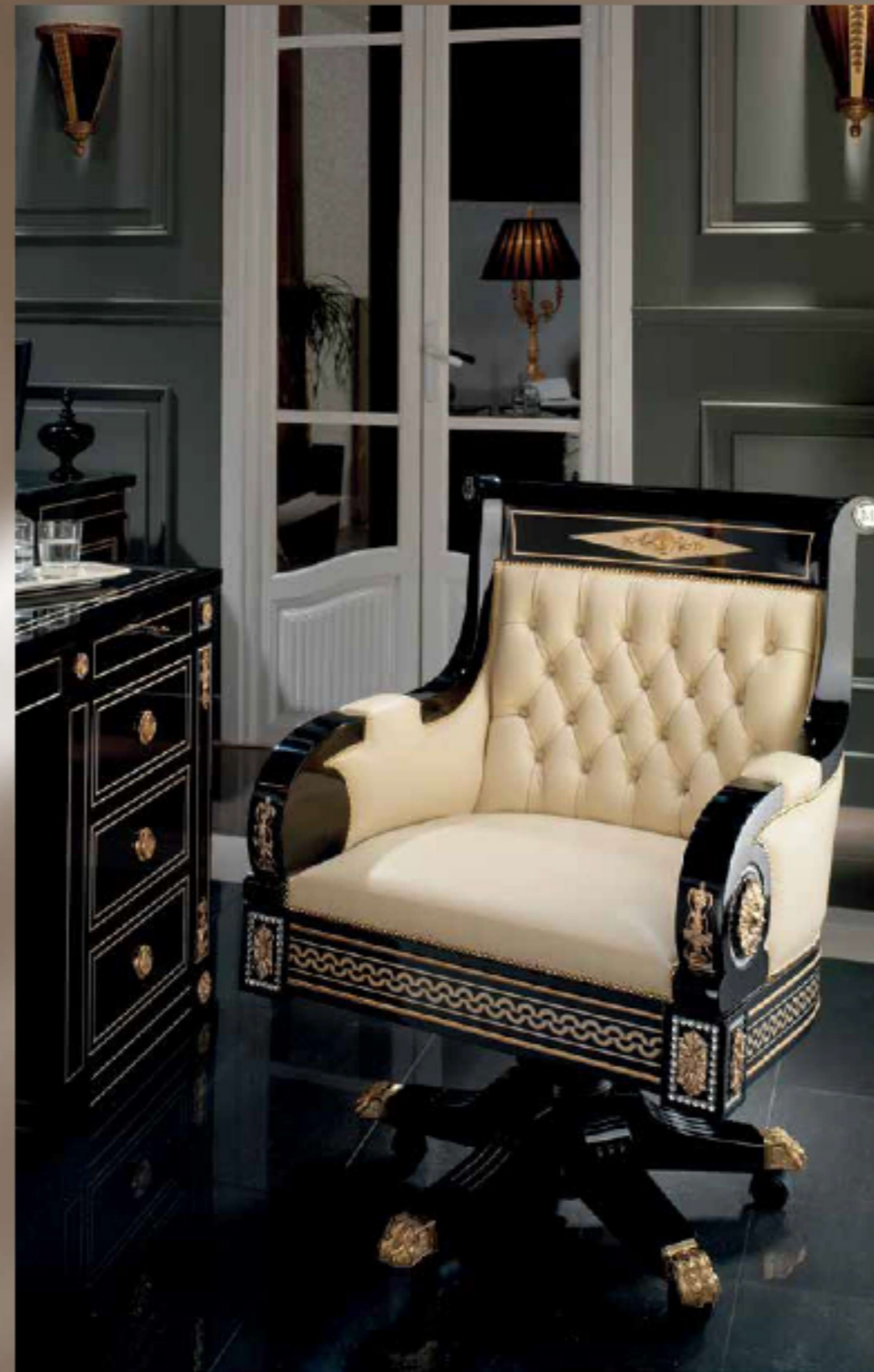
Sillón Giratorio/Armchair - 116[70→81]cm/45,67"→32,68" Acabado/Finish: N/DB (66/67) - Peso neto/Net Weight: 45,00Kg/99,12Lb Piel/Leather N°242.36