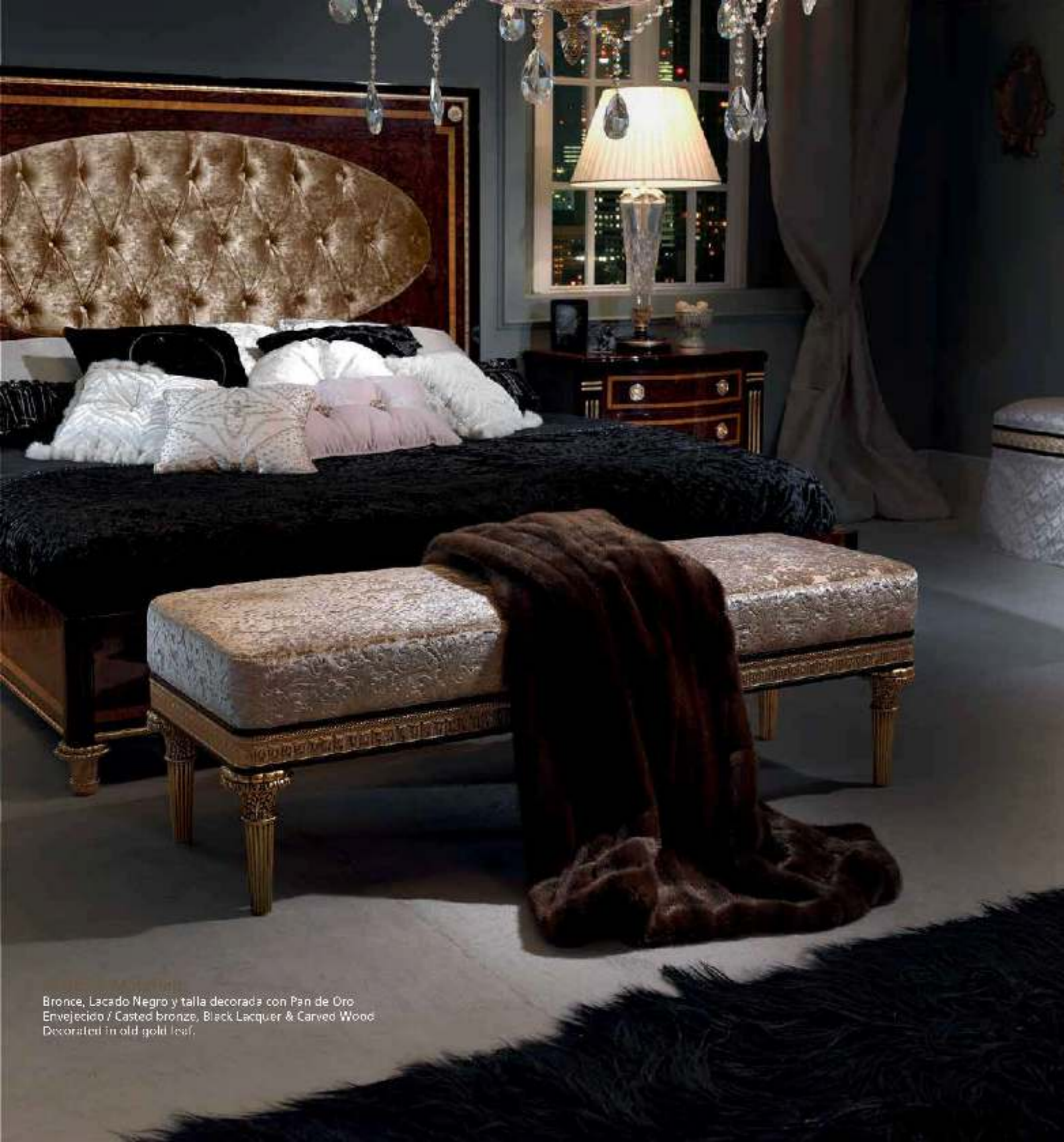
Bronce, Lacado Negro y talla decorada con Pan de Oro Envejecido / Casted bronze, Black Lacquer & Carved Wood Decorated in old gold leaf.