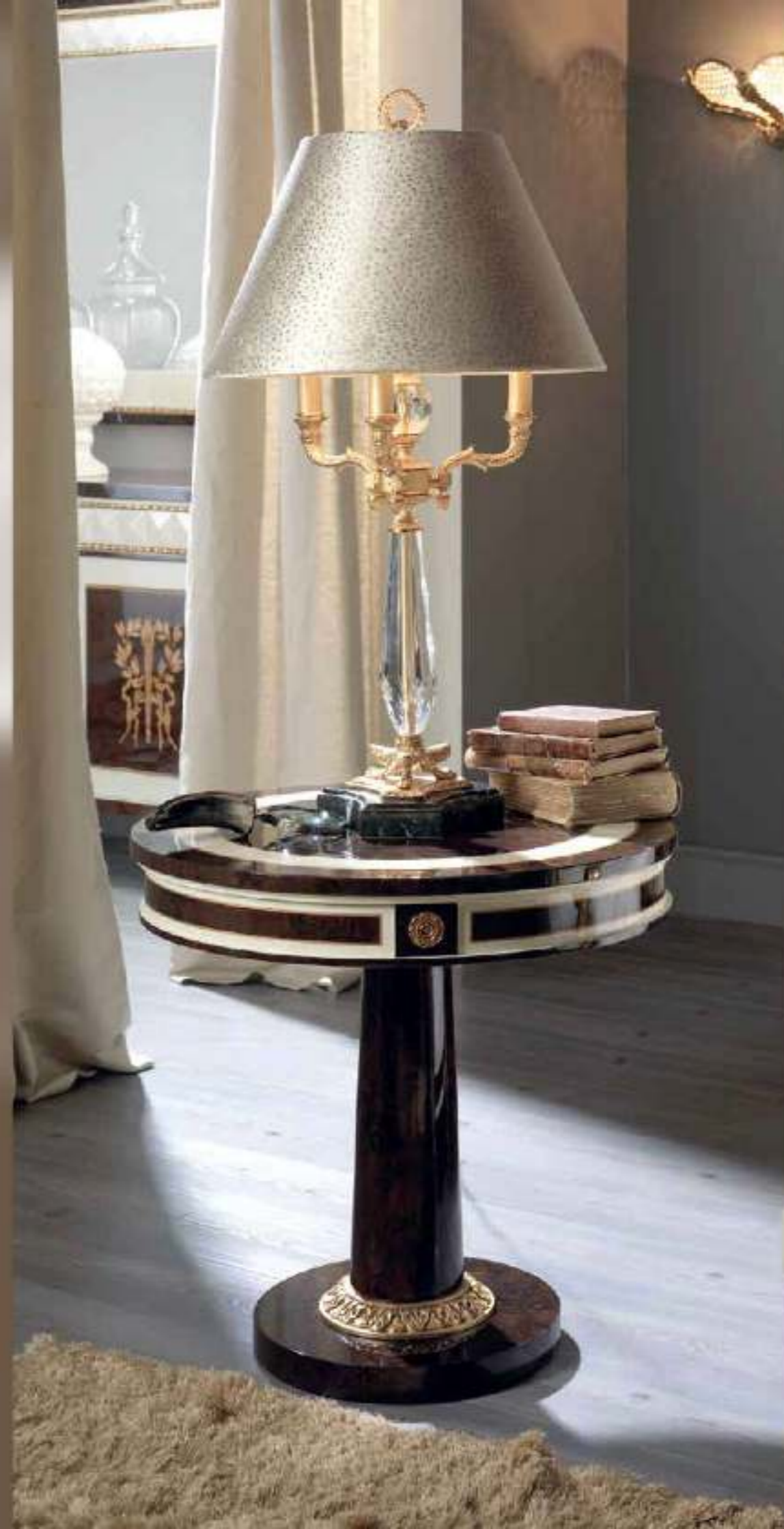
Velador/Side Table 65 | 68 | Ø cm 25,59" | 26,77" | Ø Acabado/Finish: BEL/OF (488/55) Peso neto/Net Weight: 20,00Kg/44,05 lb

Material/Materials: Chapa de Lupa de Nogal, lacado blanco y bronce / Wal- nut burl wood veneer, White Lacquer & casted Bronze.