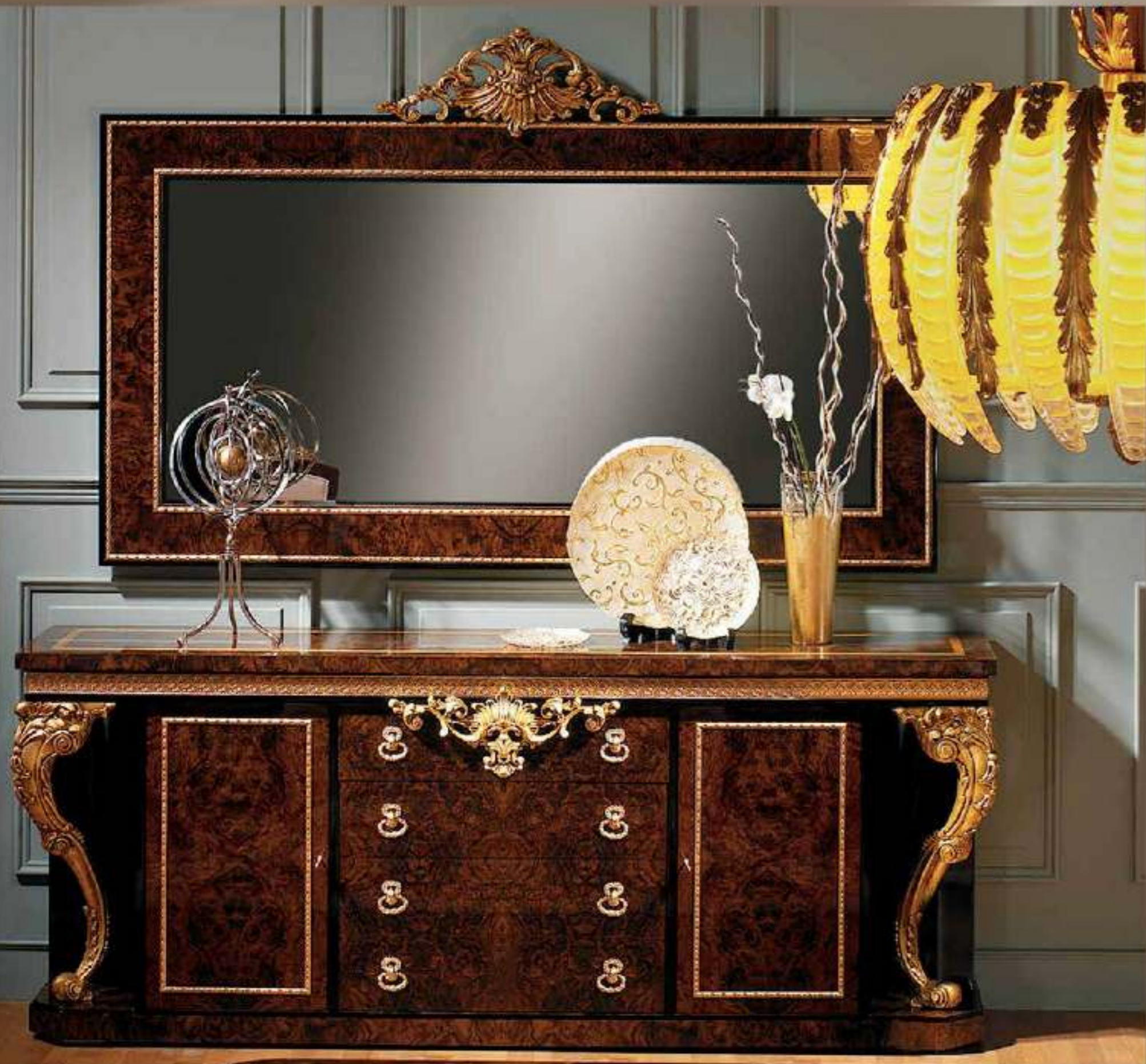
Aparador/Sideboard - 96 | 235 | 187 cm/37,80" | 92,52" | 18,90" | - Acabado/Finish: NO.POE/OA (435/231) - Peso neto/Net Weight: 169,00Kg/372,25lb Marco/Mirror - 111 | 211 | 101 cm/41,88" | 83,07" | 3,94" | - Acabado/Finish: NO.POE/OA (435/231) - Peso neto/Net Weight: 53,00Kg/116,71lb

Chapa de Lupa de Nogal, filets de Sicomoro, talla decorada con Pan de Oro Envejecido y bronce / Walnut burl wood veneer, Sycamore fillets, Carved wood decorated in old gold leaf & Casted Bronze.