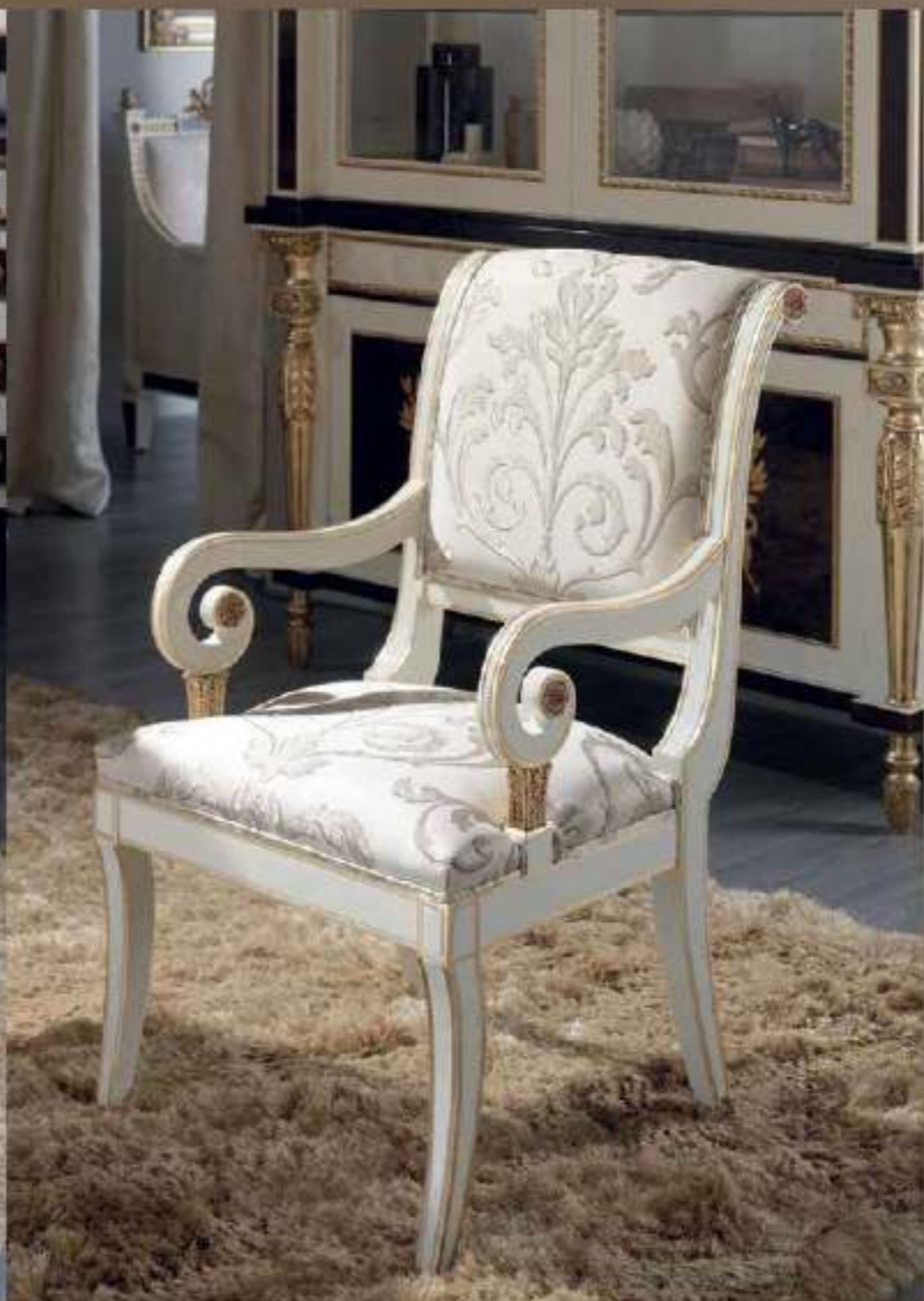
Sillon/Armchair 100 | 58x65 | cm 39,37" | 22,83" | 25,59" | Acabado/Finish: BEL/OF (488/55) Peso neto/Net Weight: 12,00Kg/26,43 lb