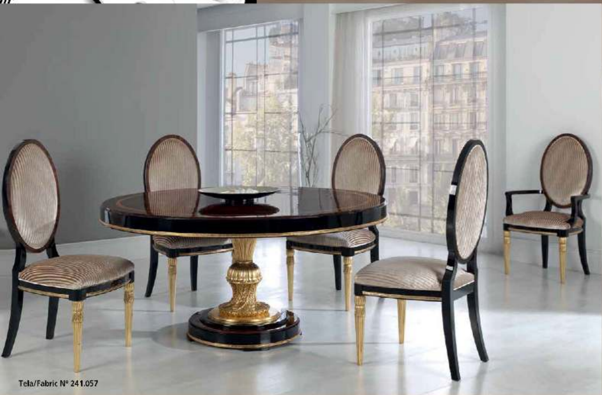
Tela/Fabric N° 241.057

Chapa de Lupa de Nogal, filets de Palma de Cerejeida, Bronces, Lacado Negro y talla decorada con Pan de Oro Envejecido / Walnut burl wood veneer, Cerejeida Palm filets, casted bronze, Black Lacquer & Carved wood Decorated in old gold leaf.