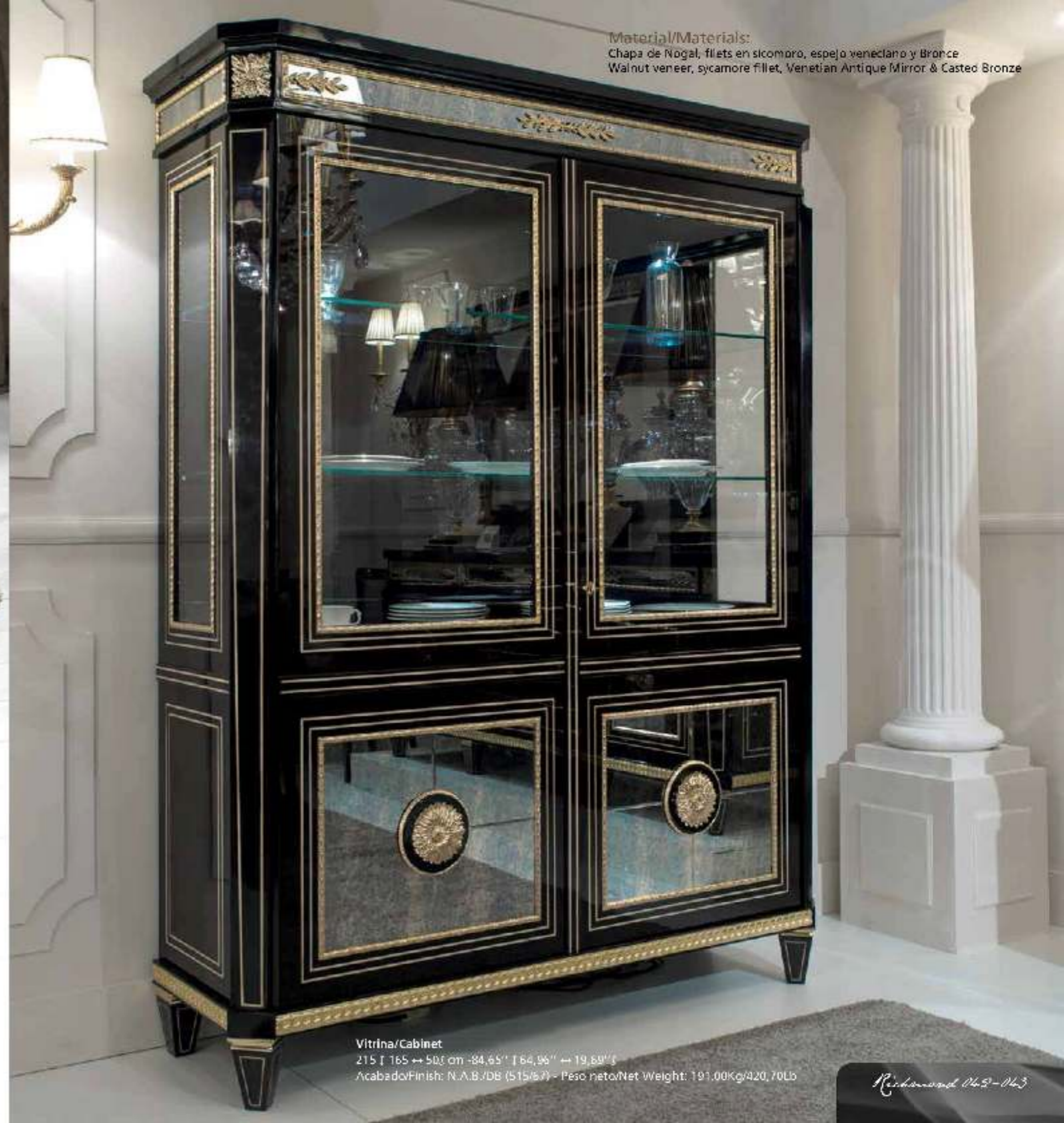
Material/Materials: Chapa de Nogal, filets en sicomoro, espejo veneclano y Bronce Walnut veneer, sycamore fillet, Venetian Antique Mirror & Casted Bronze