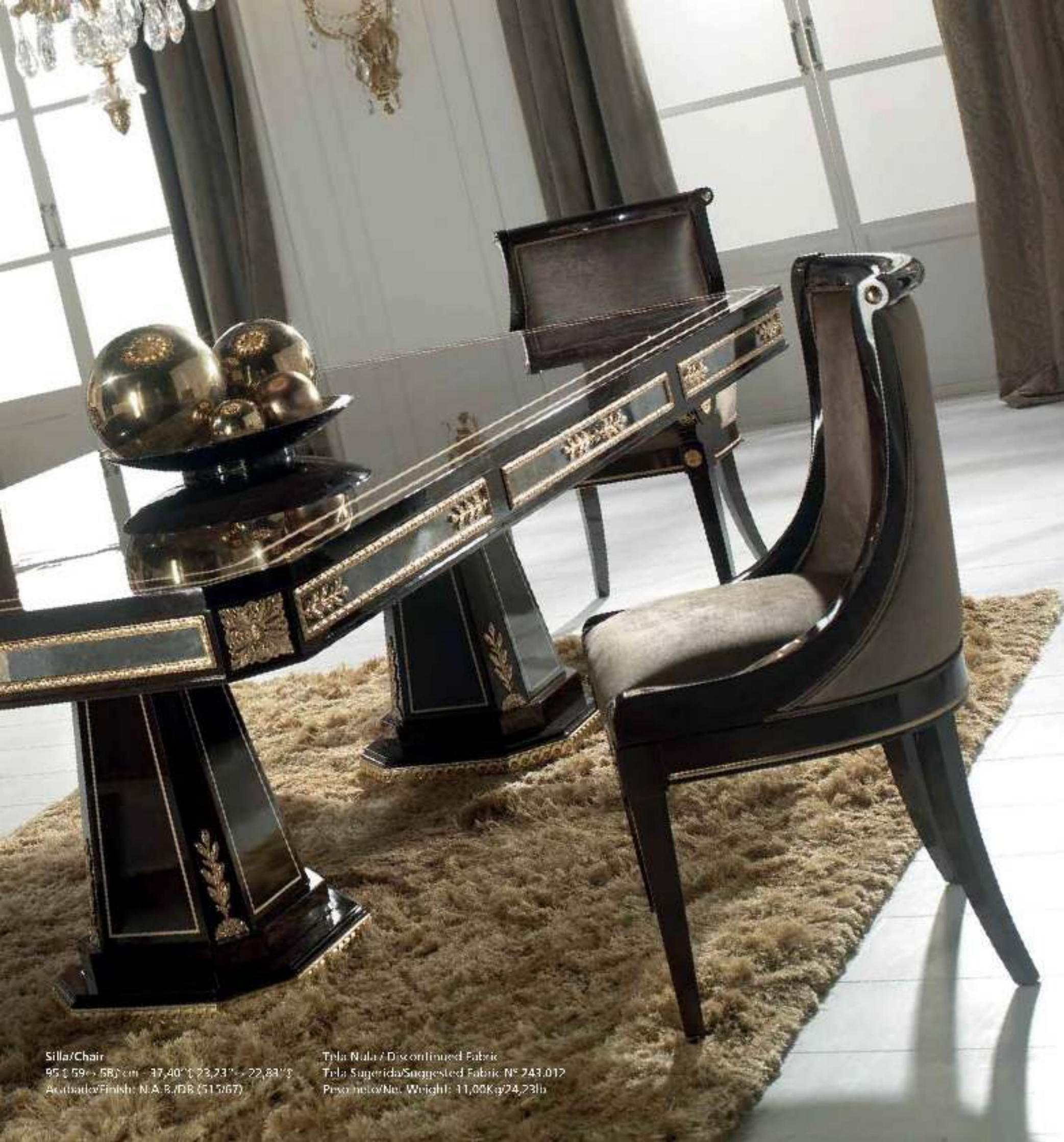
Silla/Chair 85,1 59 → 58,7 cm - 37,40" 23,23" → 22,83" 1" Acabado/Finish: N.A.B./DB (515/67)