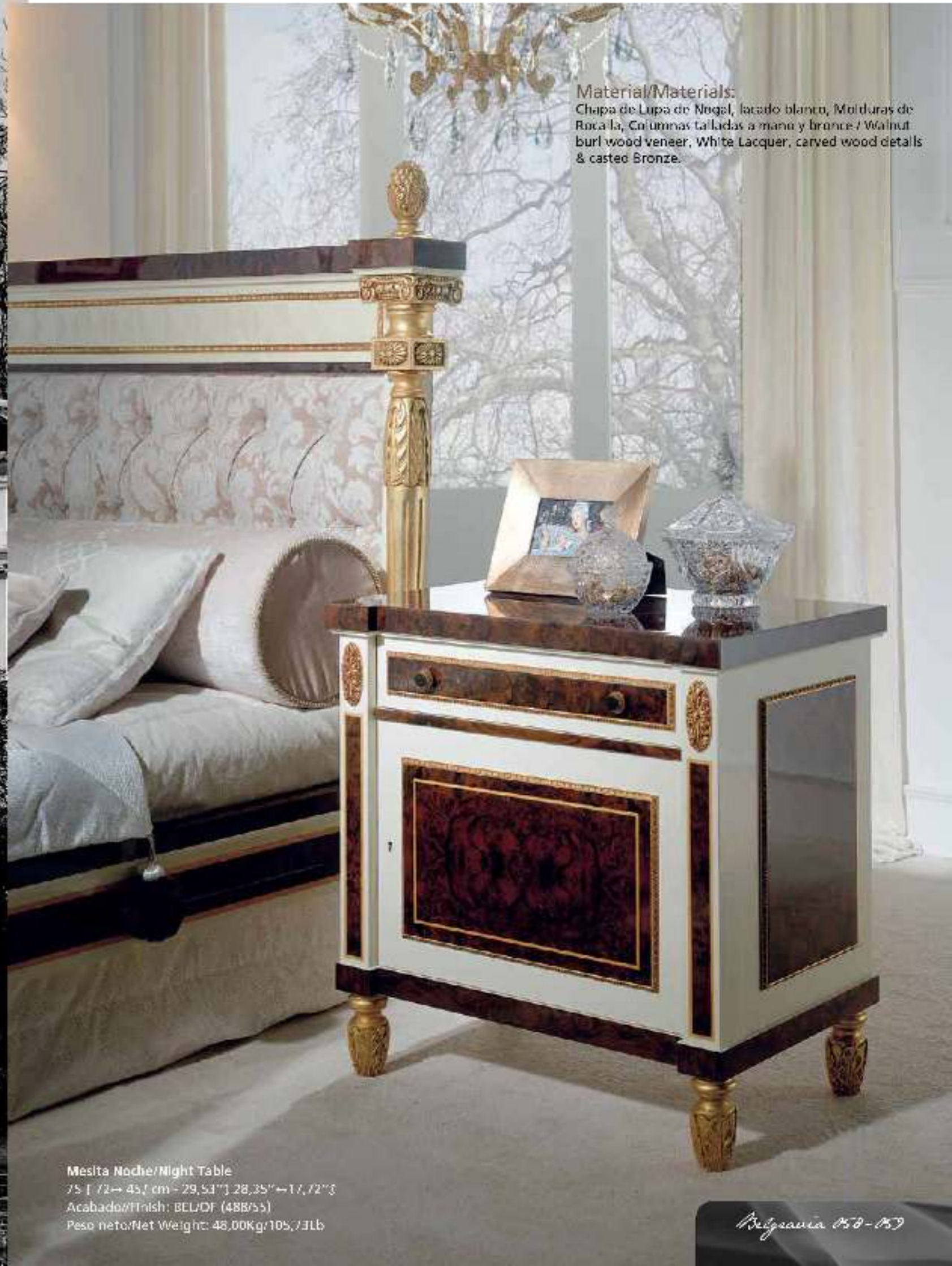
Material/Materials: Chapa de Lupa de Níquel, lacado blanco, Molduras de Roca-la, Columnas talladas a mano y bronce / Walnut burl wood veneer, White Lacquer, carved wood details & casted Bronze.