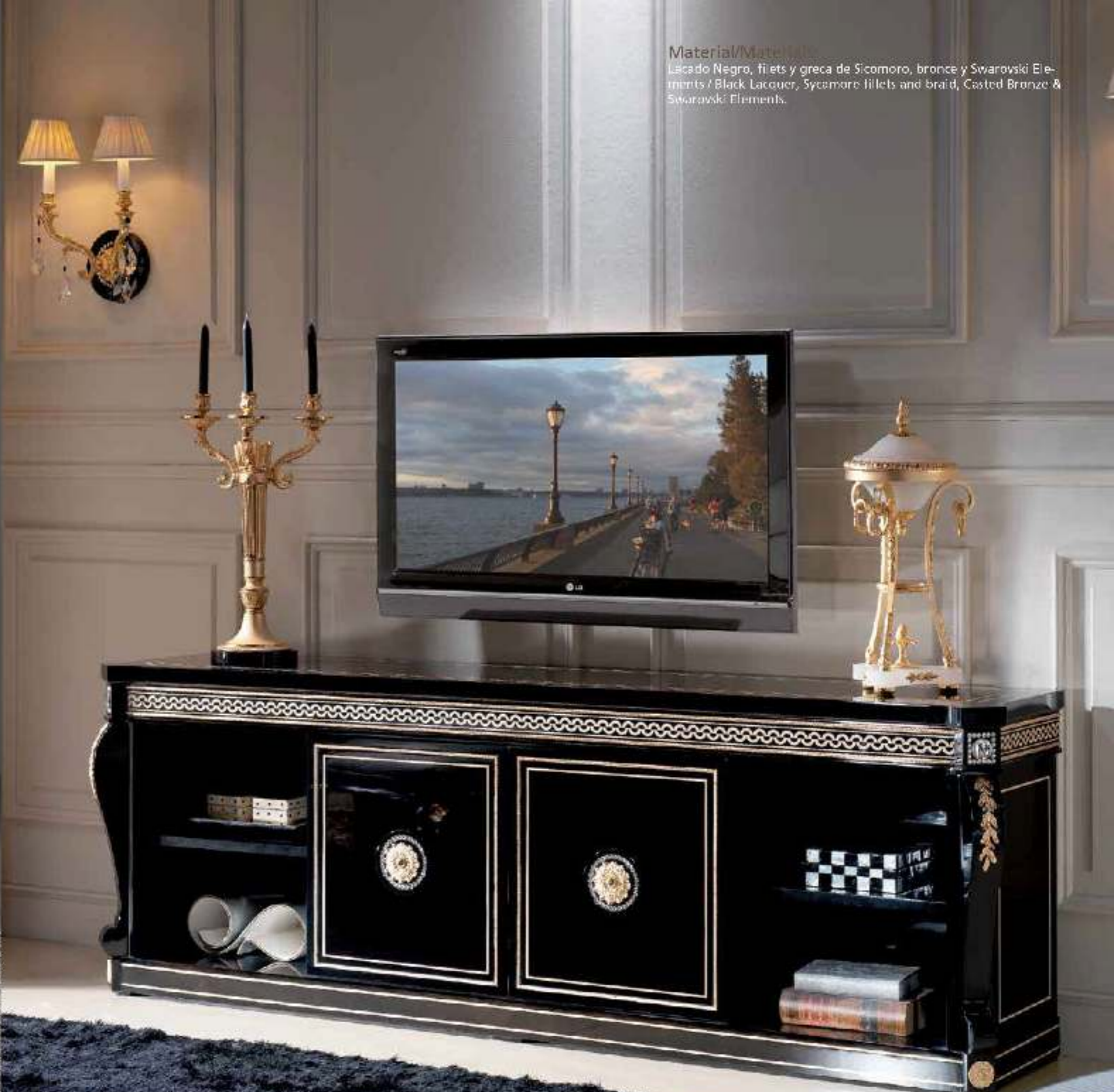
Mueble TV/TV Furniture - 772221 - 50 cm/30,31" | 87,01" | 19,69" Acabado/Finish: N/DB (56/67) - Peso neto/Net Weight: 103,00Kg/226,87Lb

Lacado Negro, filets y greca de Sicomoro, bronce y Swarovski Elements / Black Lacquer, Sycamore filets and braid, Casted Bronze & Swarovski Elements