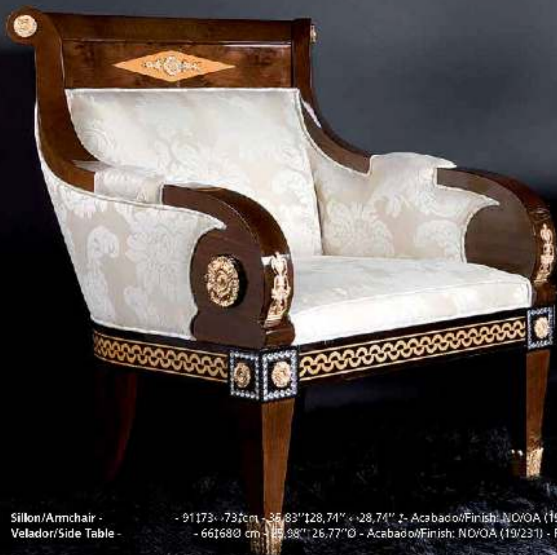
Sillon/Armchair - 91173x73cm - 35,83"x28,74"x28,74" - Acabado/Finish: NO/OA (19/231) - Peso neto/Net Weight: 21,00Kg/46,26Lb Velador/Side Table - 66168Ø cm - 49,98"x26,77"Ø - Acabado/Finish: NO/OA (19/231) - Peso neto/Net Weight: 19,00Kg/41,85Lb

Tela Nula/Discontinued Fabric Tela Sugerida/Suggested Fabric N°241.062