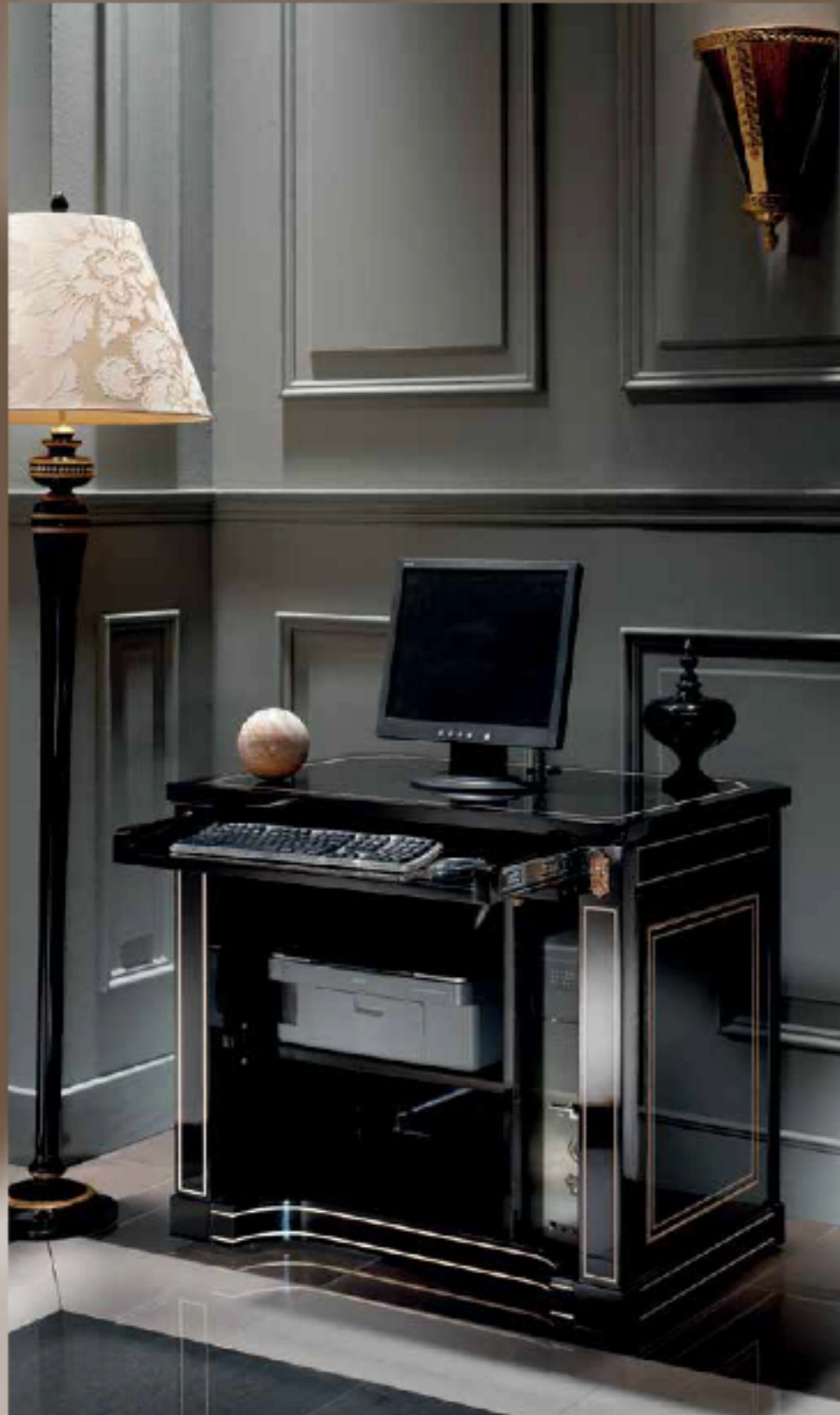
Mueble PC/PC Desk - 81,96→64,3cm/31,89"→25,20" Acabado/Finish: N/DB (66/67) - Peso neto/Net Weight: 50,00Kg/110,13Lb