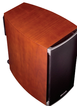
Top View of RTiA Cabinet Design