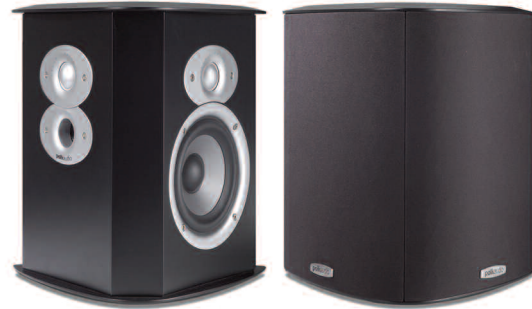
F/XiA6 Surround Loudspeaker