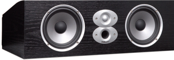
CSiA4 Center Channel