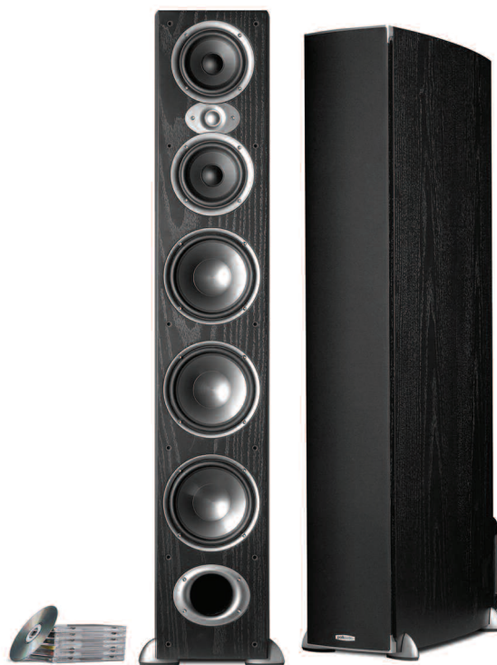
RTiA9 Floorstanding Loudspeaker