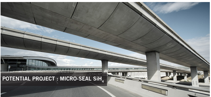
POTENTIAL PROJECT : MICRO-SEAL SiH 4