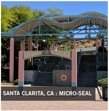
SANTA CLARITA, CA : MICRO-SEAL