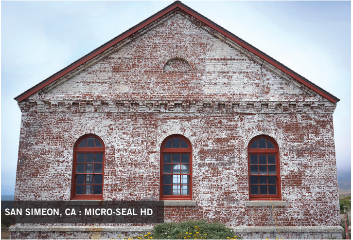
SAN SIMEON, CA : MICRO-SEAL HD