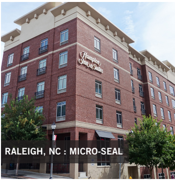
RALEIGH, NC : MICRO-SEAL