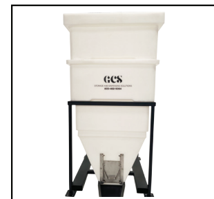
Extension with lid