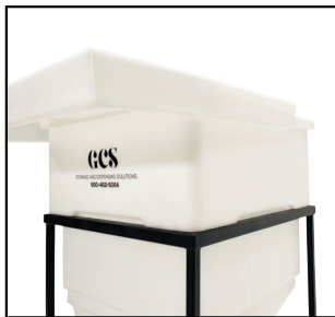
Large lid detail