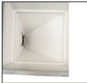
Side discharge interior