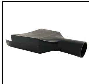
Bag Fill Chute