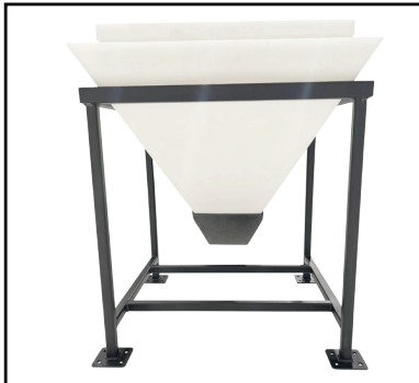
66 gallon back