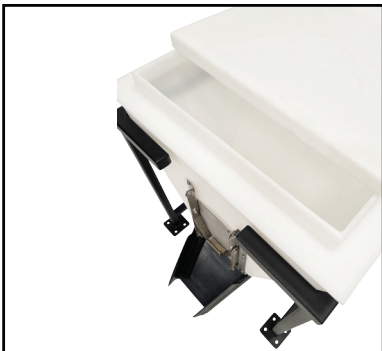
66 gallon top