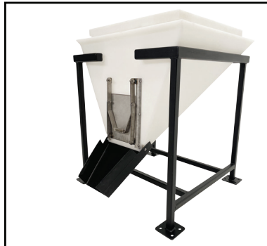
66 gallon side