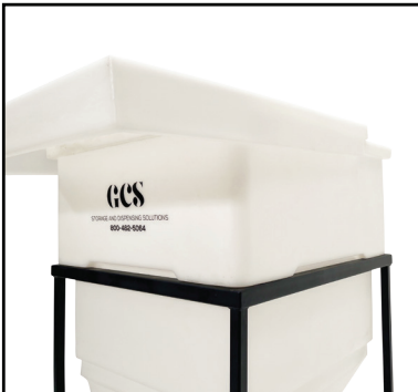
Large lid detail