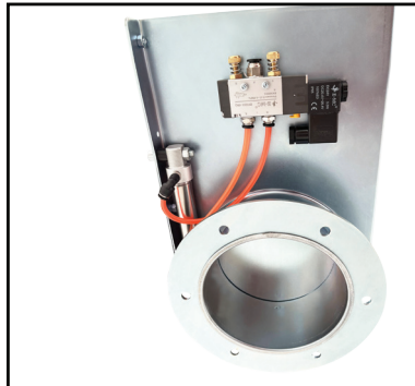
295 gallon Auto detail