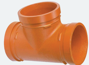
Tee (Short) | ALETSR