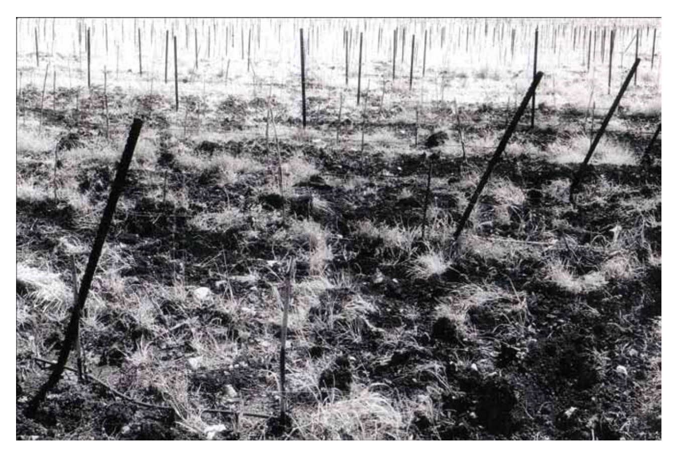
Search, 1997 B&W Infra Red Photography

Jerusalem, a city that he describes as being in exile itself, was as much the undoing of him as it was his making. He discovered through it not only the burden of its own lack of belonging, but the reality that in the city's exile was but a sliver of a shadow of his life. "Jean Baudrillard said the world has been transformed to an image, we live