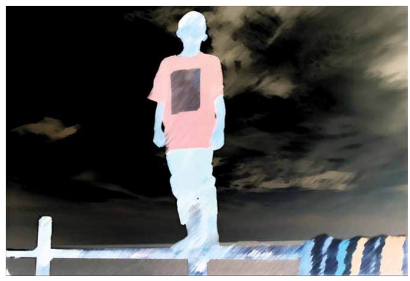
End of Days, 2003 Digital editing. Light boxes installation placed at random in a complete darkened room

in a world where there is a copy with no original, and I realised that Jerusalem had indeed been transformed into an image in people's minds, and I was simply living in that image. This was not where I belonged. There was no home."