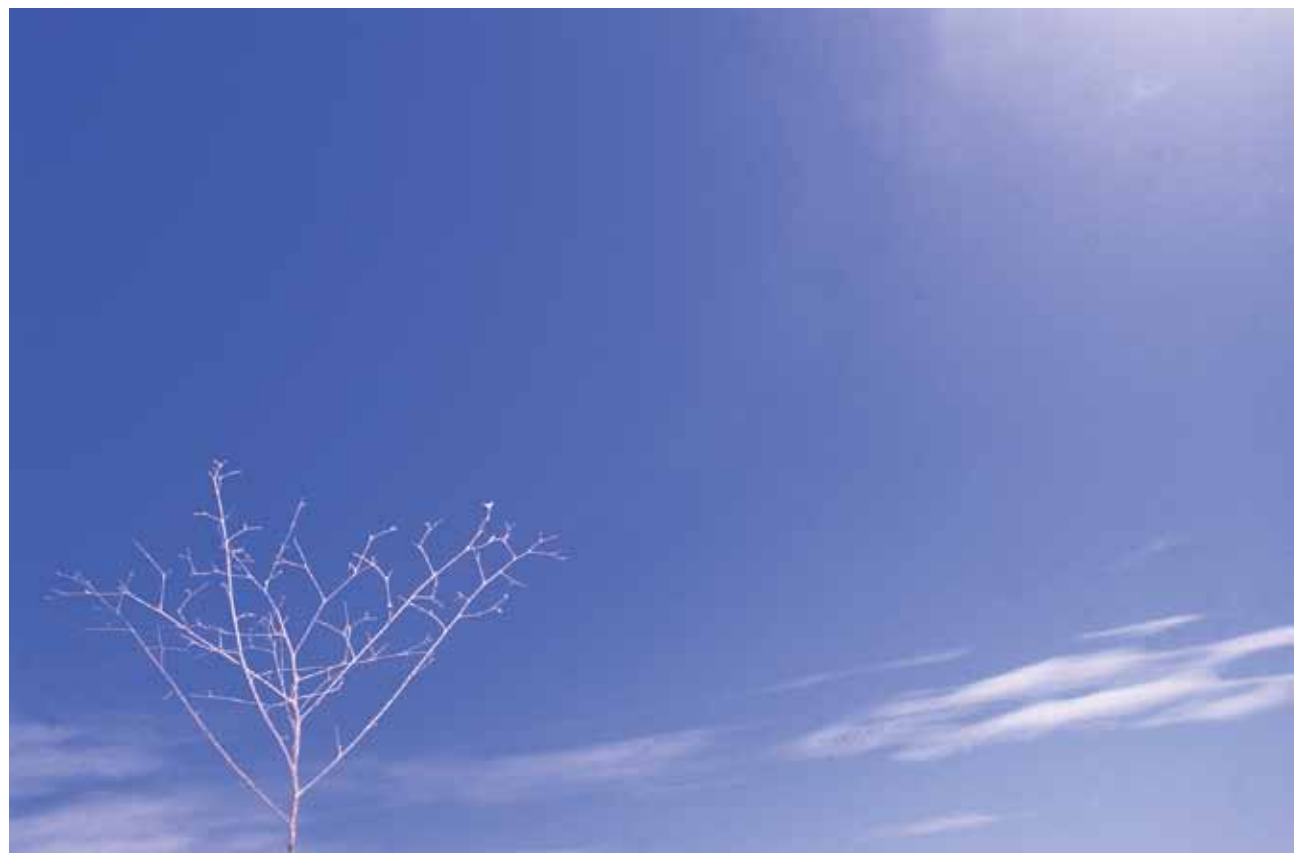
Identity, 2002 colour transparencies, 40/50 cm

The pieces that form this series speak of a childhood Sabella never had, they speak of transformation of context to content, and they ruminate on suffering and home and loss. But amidst his conveyance of confusion, alienation even, in the alternate sides of fabric that look in many ways like they have no link to each other at all, the work also speaks of dialogue and the reality of connectivity even in the face of difference and change. And it was perhaps this moment of discovery of the physics and science of the other side that allowed Sabella to create the realities that form In Exile (2008). It was, one wants to believe, in that fleeting moment by the window looking out, that he looked out on a world, however faulted, that could form a whole.