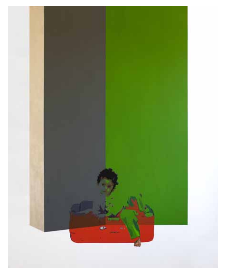
Figure 1. Hani Zurob, Flying Lesson #06, Acrylic on Canvas, 200x160cm, 2010

There is a distinctive shift in the style of Zurob's art since he left Palestine to Paris in 2006 This thesis was submitted in conformity with the requirements for the Master's Degree in Art Business