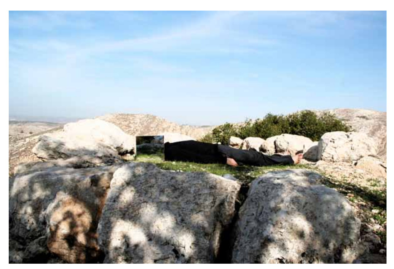
Figure 2. Bashar Hroub, Here & Now Series, c-print, ed of 3, 80 x 53 cm, 2010

happened which I did not account for later... The attention brought many people from abroad who wanted to see who the artists were, and Anadiel was the only place as a reference and an address.... So I was looking for an income, I started going to initiate projects through opening connections with the outside world; I went to diplomatic missions, suggesting projects where I would invite artists from abroad, who would come and engage with the people here. The first idea was to connect between Palestinians from inside and from outside. Given that several Palestinian artists have been nationalized, I contacted the foreign representative offices asking them for funding.... Accordingly, such initiatives would cover my running costs. Anadiel helped to advance Contemporary Palestinian Art.... and eventually led to the establishment of Al-Mamal Foundation in 1998.41