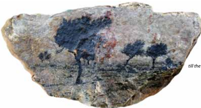
till the end, spirit of the place (#3), 2004. Photo emulsion on Jerusalem stone UNIQUE (one original)