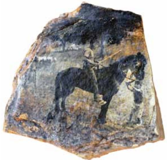
till the end, spirit of the place (#2), 2004. Photo emulsion on Jerusalem stone UNIQUE (one original)