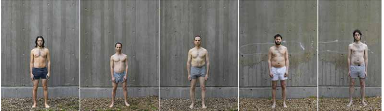
Installation of life-size images. The image of the Palestinian faces the six Israelis. That is, the work hangs on two opposite facing walls.

stake of the Shoa (the Holocaust) and then of endless wars, terrorist attacks and immense hostility from their neighbors; the others repressed and chased away from their own homes or imprisoned in unbearable situations and contexts), requires a therapy, a cure which is able to penetrate so deeply to finally reach individuals. The artist clarifies: “Any solution between Israelis and Palestinians should also involve a psychological solution. Both nations require mental healing.” On the contrary, the artist’s attempt is evidently to actually see the people in their bare essence: Also to be able to see himself.