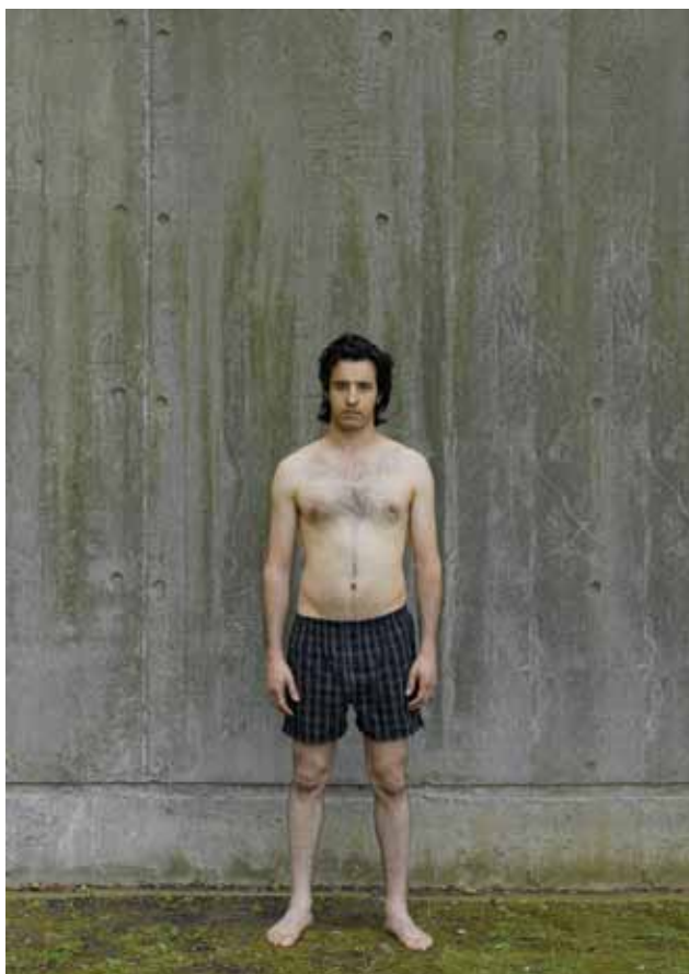
Settlement – Six Israelis & One Palestinian, 2008, limited edition of five. 210 cm / 150 cm each

‘Otherness’—face-to-face, and right to the core. The borders whether mental or physical, might move aside and a dialogue of a different nature might take place.”