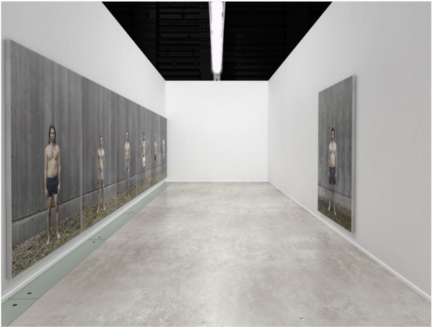
Steve Sabella, 'Settlement—Six Israelis & One Palestinian', installation shot, 2008–10, LightJet print on aluminium with 5-cm aluminium box edge, 230 x 164 cm.

work, a foreword and six essays complete the monograph.