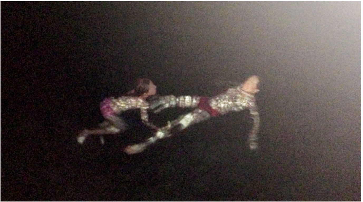
Steve Sabella, 'Independence', 2013, Lambda print on Diasec with 3.5-cm aluminium box edge, 81 x 45 cm.