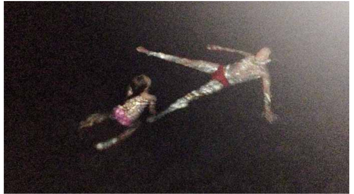
Independence 13 (2013) Lambda print on diasec 3.5 cm aluminum box edge 81 x 45 cm Limited edition of 6 + 2AP