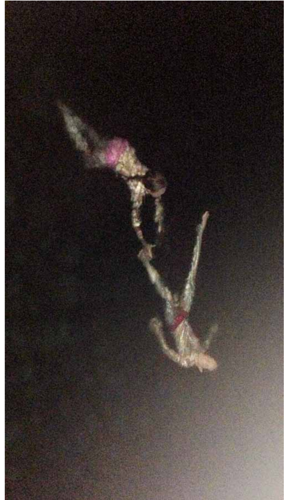
Independence 10 (2013) Lambda print on diasec 3,5 cm aluminum box edge 81 x 45 cm Limited edition of 6 + 2AP