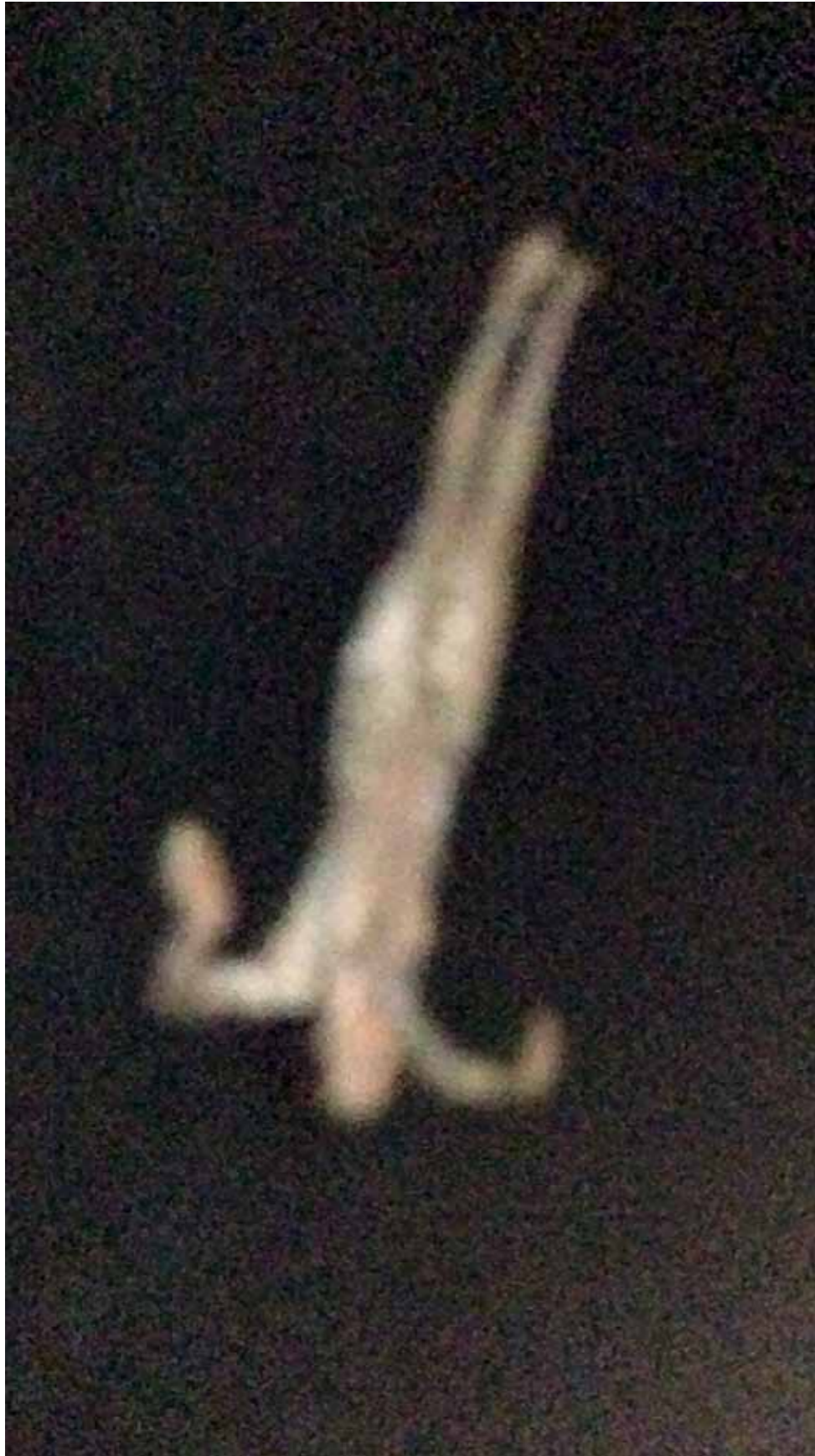
Independence 2 (2013) Lambda print on diasec 3.5 cm aluminum box edge 81 x 45 cm Limited edition of 6 + 2AP