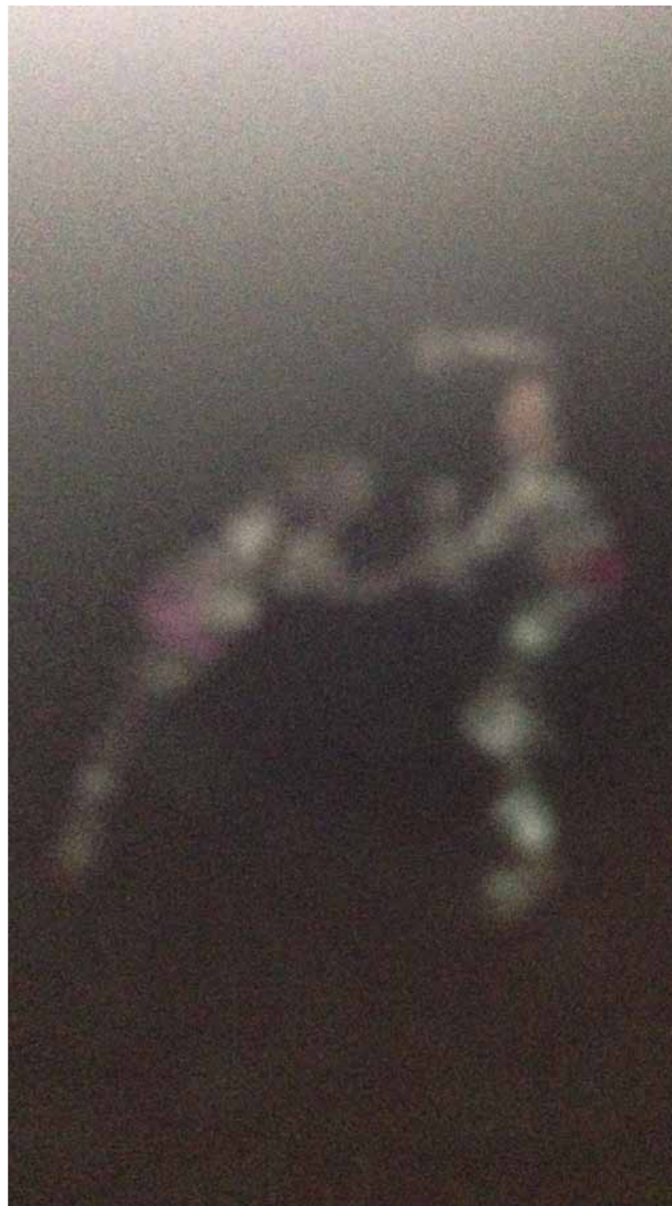
Independence 6 (2013) Lambda print on diasec 3.5 cm aluminum box edge 81 x 45 cm Limited edition of 6 + 2AP