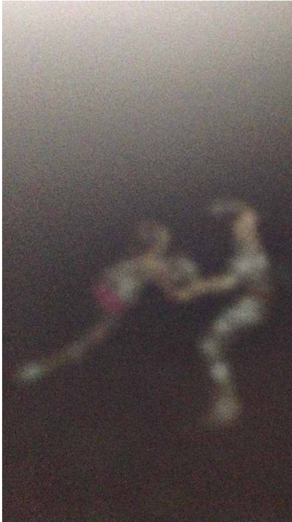
Independence 4 (2013) Lambda print on diasec 3.5 cm aluminum box edge 81 x 45 cm Limited edition of 6 + 2AP