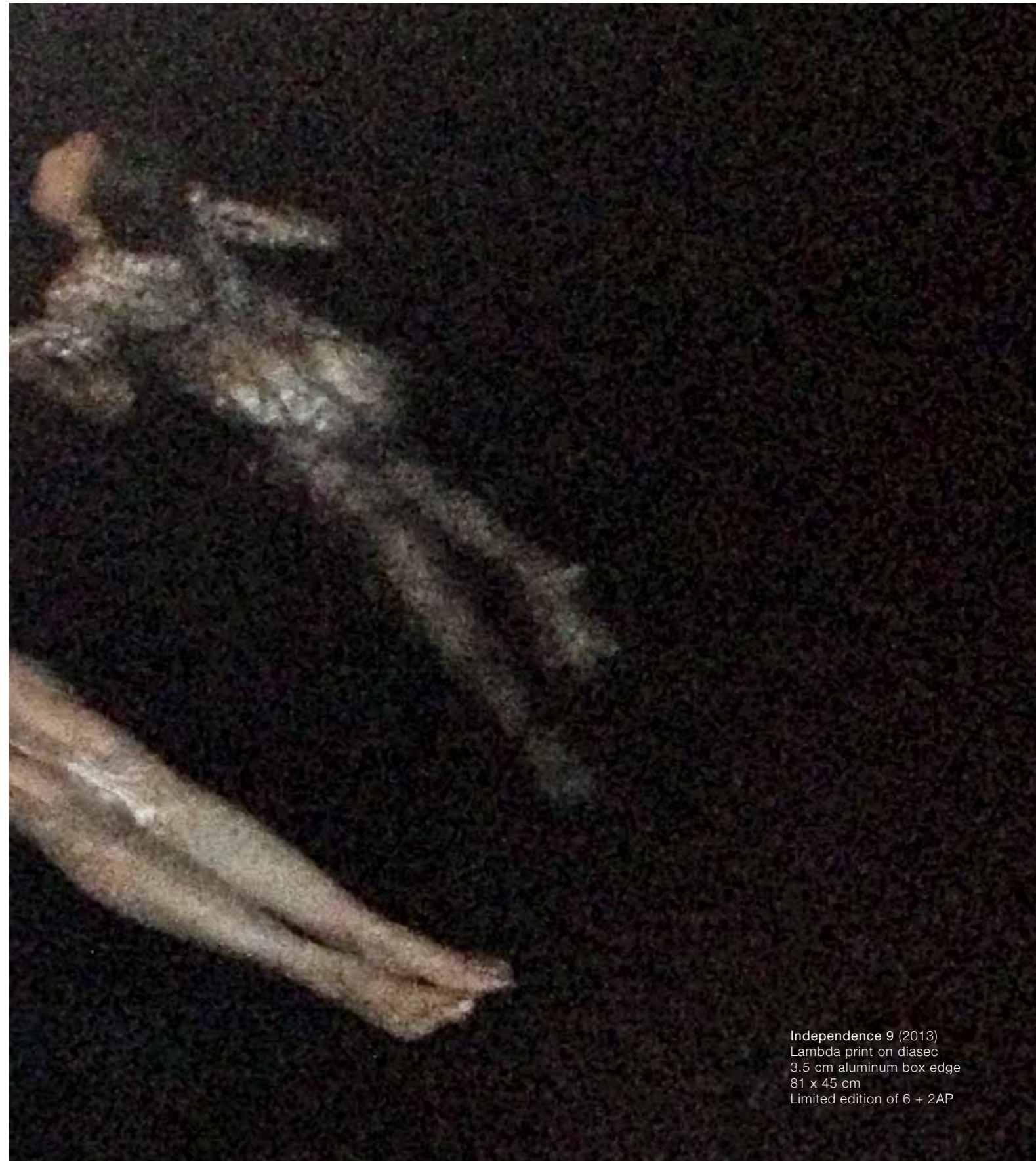
Independence 9 (2013) Lambda print on diasec 3.5 cm aluminum box edge 81 x 45 cm Limited edition of 6 + 2AP