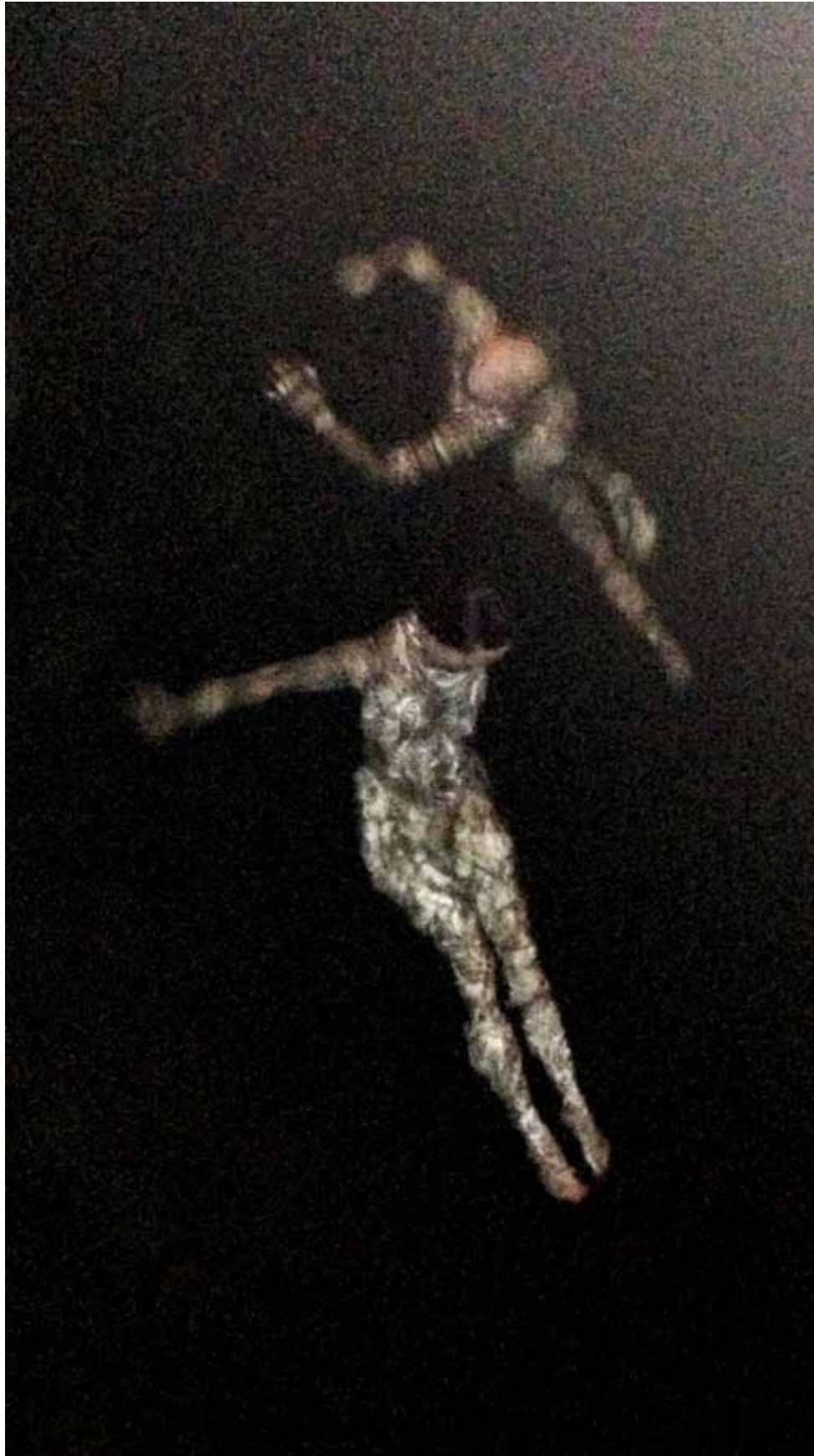
Independence 11 (2013) Lambda print on diasec 3.5 cm aluminum box edge 81 x 45 cm Limited edition of 6 + 2AP