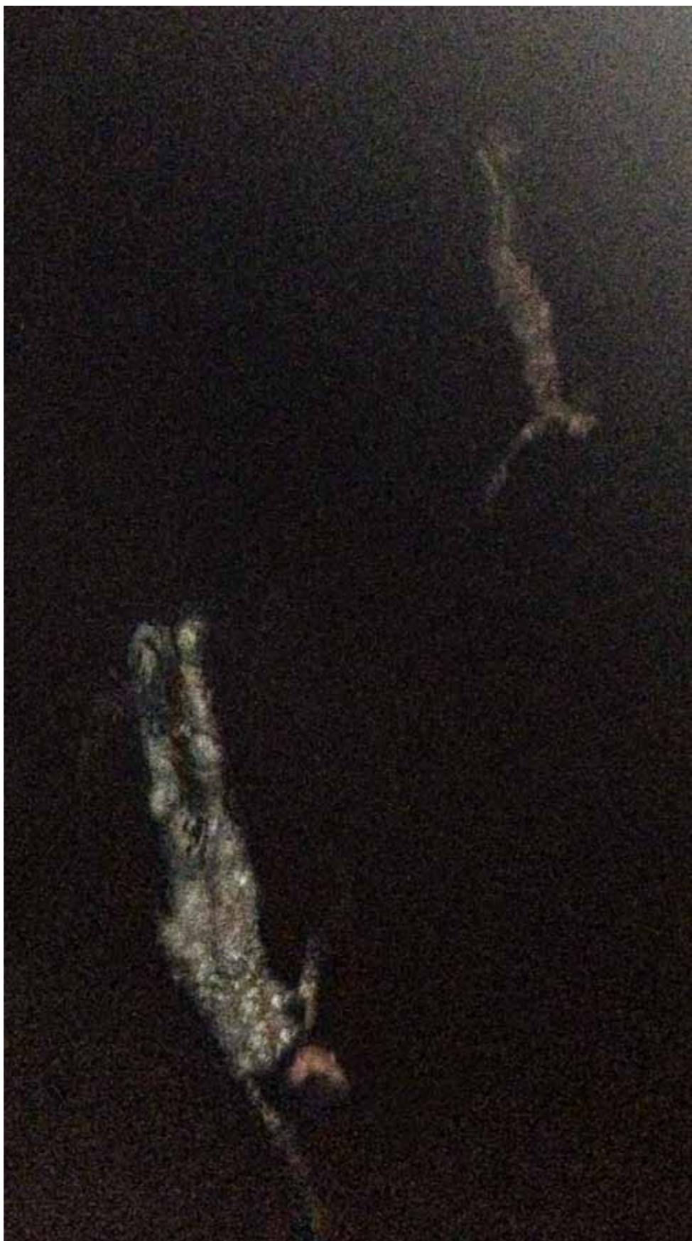
Independence 15 (2013) Lambda print on diasec 3.5 cm aluminum box edge 81 x 45 cm Limited edition of 6 + 2AP