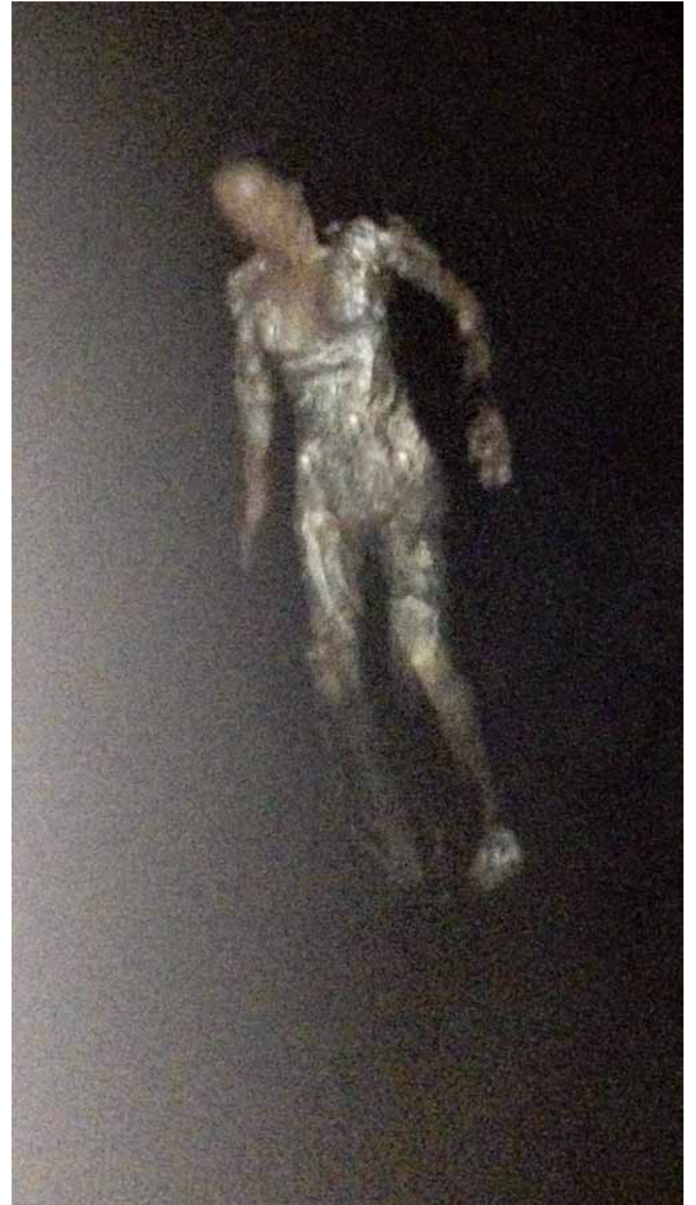
Independence 18 (2013) Lambda print on diasec 3,5 cm aluminum box edge 81 x 45 cm Limited edition of 6 + 2AP