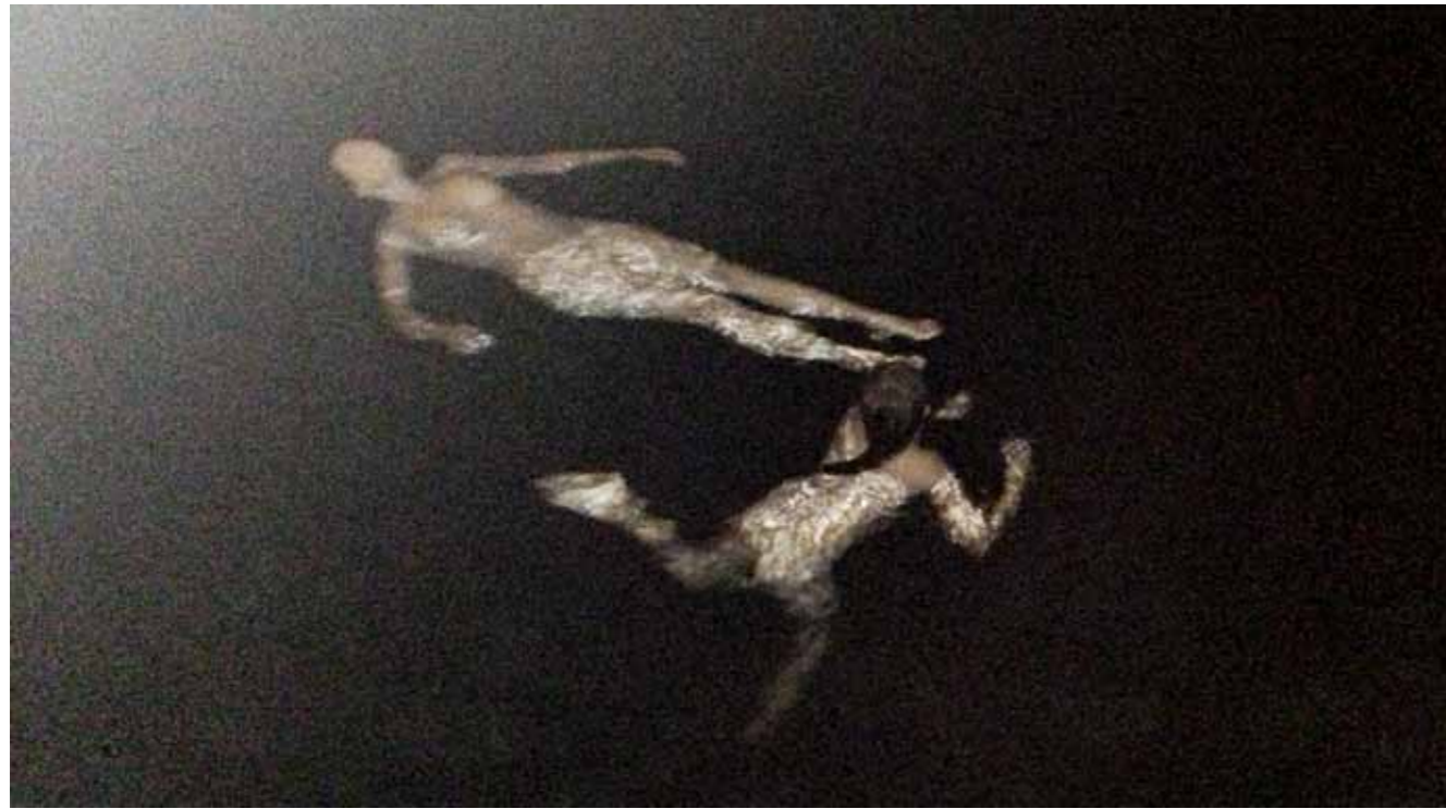
Independence 12 (2013) Lambda print on diasec 3.5 cm aluminum box edge 81 x 45 cm Limited edition of 6 + 2AP