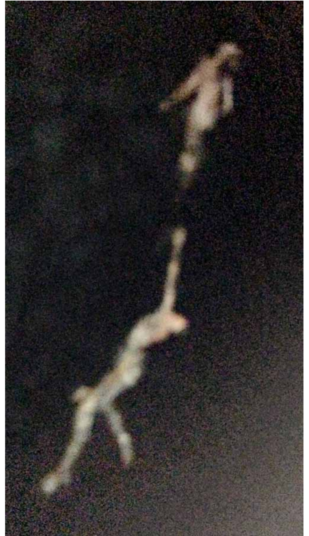
Independence 3 (2013) Lambda print on diasec 3.5 cm aluminum box edge 81 x 45 cm Limited edition of 6 + 2AP