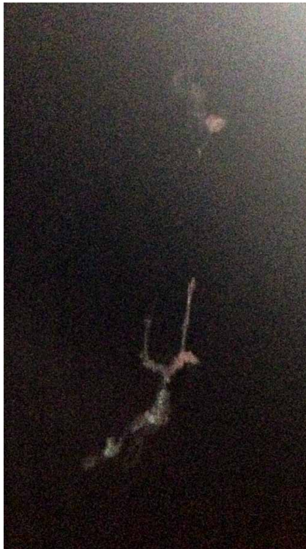
Independence 16 (2013) Lambda print on diasec 3.5 cm aluminum box edge 81 x 45 cm Limited edition of 6 + 2AP