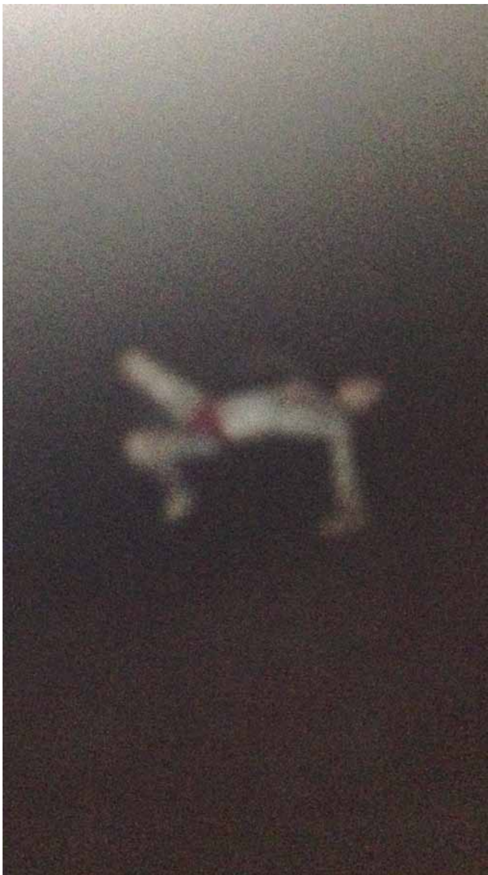
Independence 5 (2013) Lambda print on diasec 3.5 cm aluminum box edge 81 x 45 cm Limited edition of 6 + 2AP