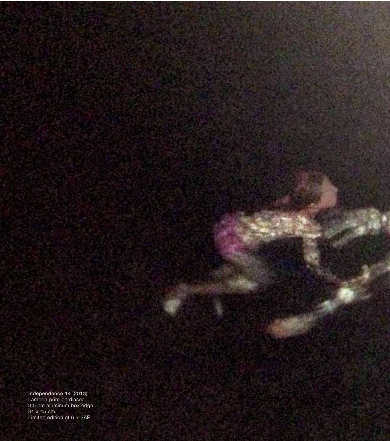
Independence 14 (2013) Lambda print on diasec 3.5 cm aluminum box edge 81 x 45 cm Limited edition of 6 + 2AP